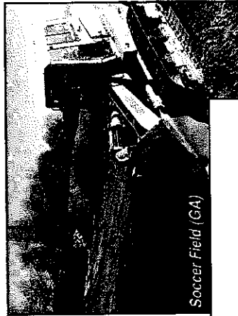
Soccer Field (GA)

Targeted Brownfields Assessments supplement and work with other EPA programs to minimize the uncertainties of contamination. TBA assistance is usually provided to those without EPA Brownfields Assessment grants. States and Tribes, local governments, and state-chartered redevelopment agencies are eligible for funding.