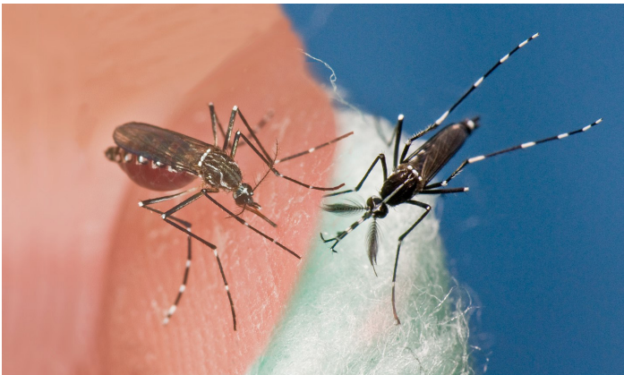
Figure 1. The invasive mosquitoes Aedes aegypti (left) and Aedes albopictus (right) occur in the Americas, including Florida, and have been implicated in the transmission of Zika virus.