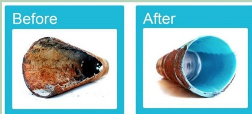
Graphic showing what an old pipe looks like compared to what it looks like after it has been repaired with a new lining.

"The safety of our residents is our highest priority and this investment by the state for the rehabilitation of the city's sewer system will not only be an improved structure but will continue to help prevent wastewater spillage and keep sewage and pollutants out of waterways," says City of Port Orange Mayor, Don Burnette. "We appreciate the efforts of State Senator Tom Wright, State Representative Tom Leek, and the Pittman Law Group on the city's behalf in securing the funding for this project in our city."