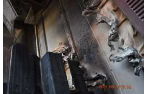
Photos of a structure fire at 1025 Eagle Lake Trail