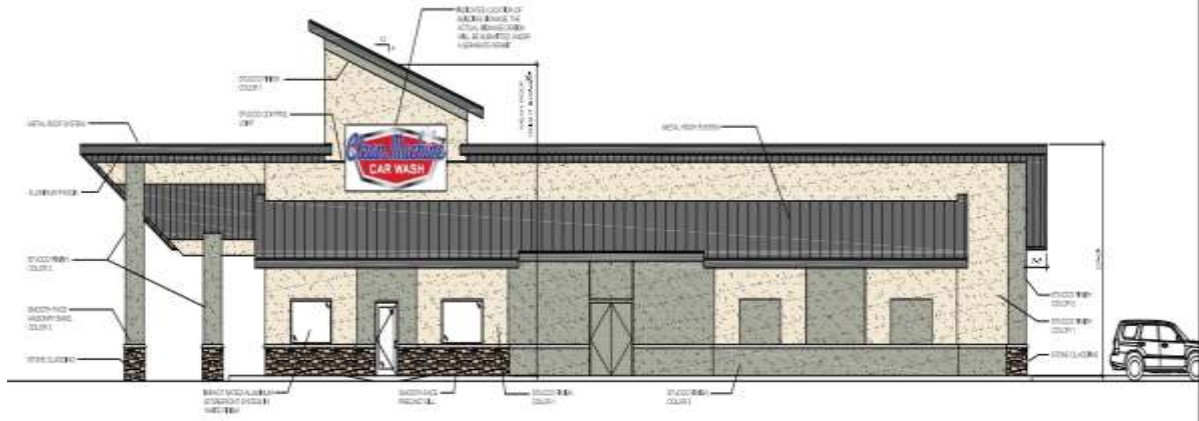
Proposed architectural elevation for the Clean Machine Car Wash project