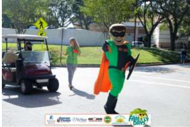
Photo of Rec Man in the Family Days parade

Also, the Port Orange Fire Rescue (POFR) crew covered the event on their Emergency Response Vehicle (ERV) and they also had several members walk in the parade on Saturday. In total, the crew treated only one patient during the event!