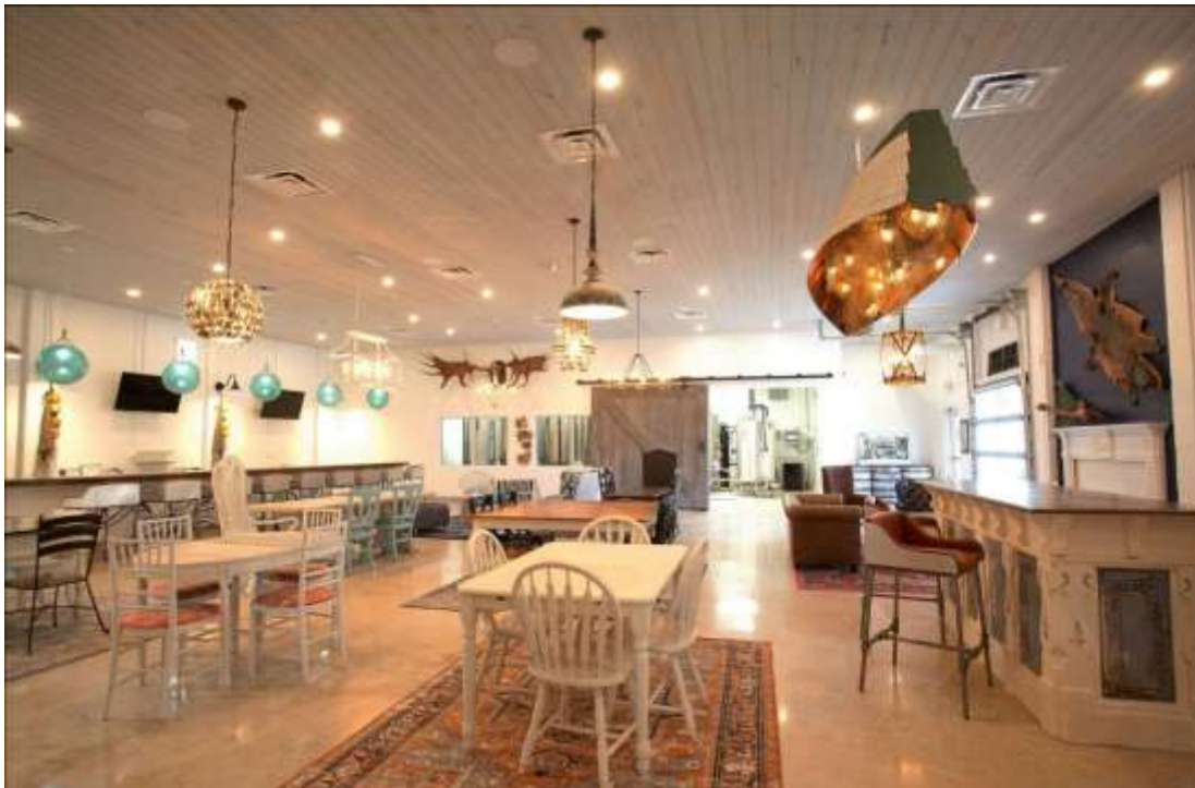
Photo of the interior of Dunes Brewery