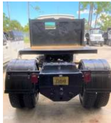
Before and after photos of Flatbed Truck #1735