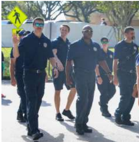
POFR participating in the Family Days parade

Also, the Port Orange Fire Rescue (POFR) crew covered the event on their Emergency Response Vehicle (ERV) and they also had several members walk in the parade on Saturday. In total, the crew treated only one patient during the event!