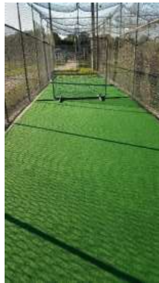
Photo of new turf after installation