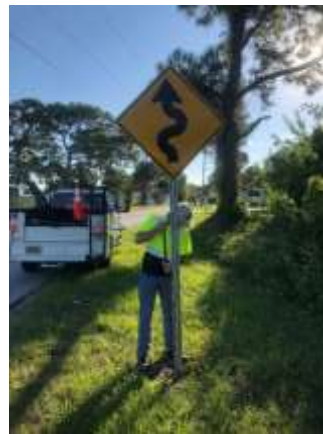
Before and after photos of the sign that was knocked down