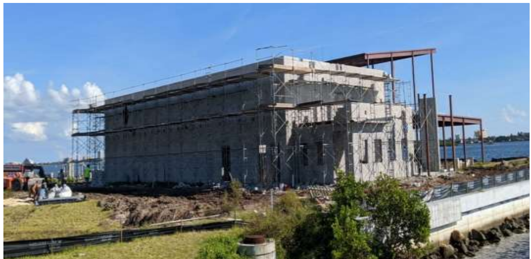
Photo of Fysh Bar & Grill Restaurant under construction