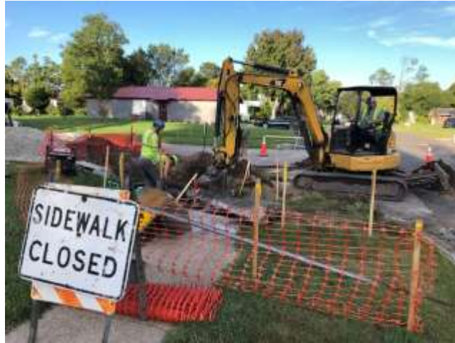
Photo of storm pipe being installed on Pagano Court