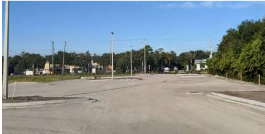
Photo of the parking lot under construction at Fysh Bar & Grill Restaurant