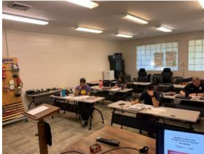
Photo of Port Orange Fire training division hosting a Fire Service Building Construction class