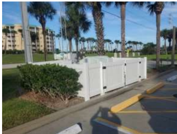
Photo of new fence installed at Ocean Quest lift station in Ponce Inlet