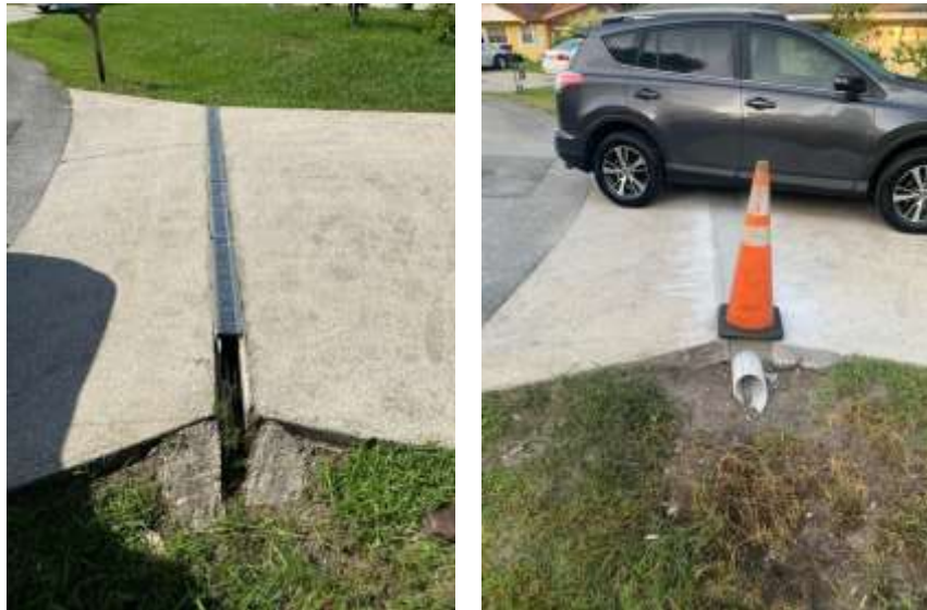
Before and after photos of the driveway drain pipe replacement