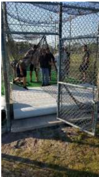
Photo of turf being installed in the batting cages