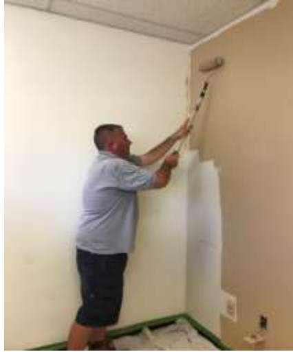
Before and after photo of staff painting the Deputy Director's Office at Public Works