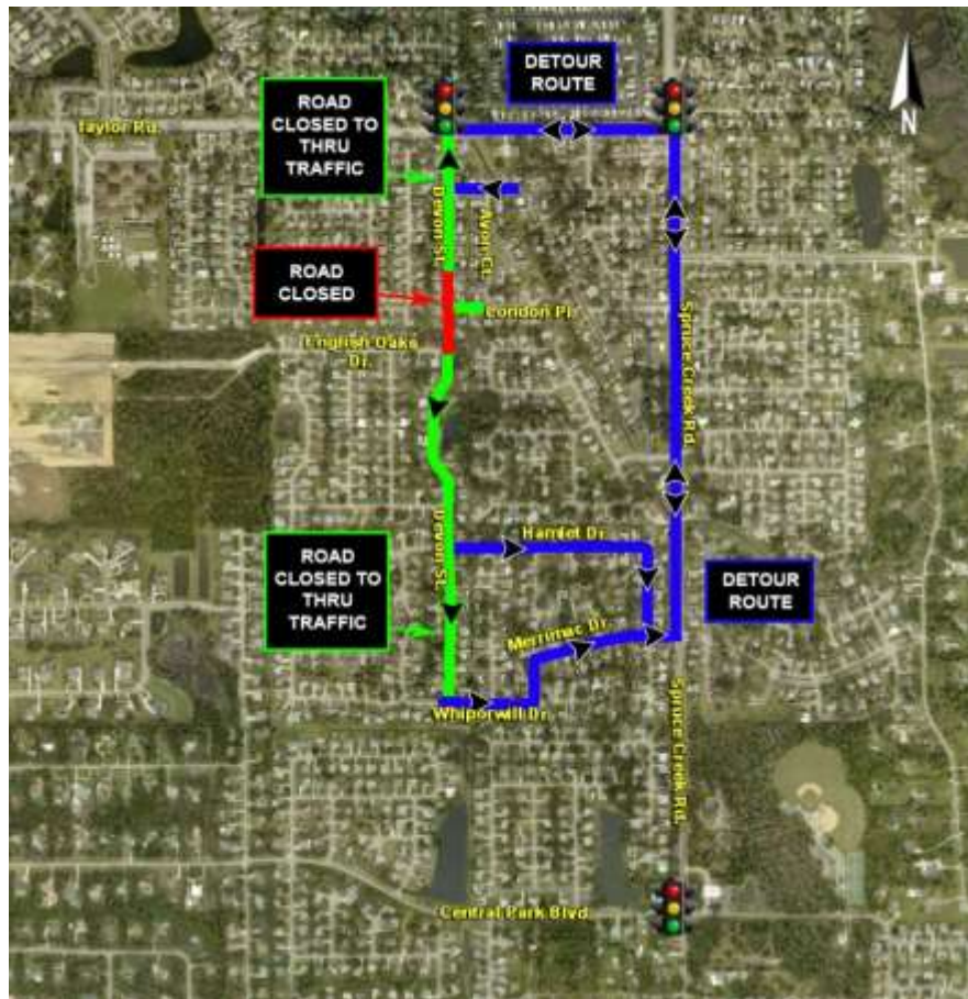
Detour map graphic showing the upcoming road closure at the intersection of Devon St. and London Pl.