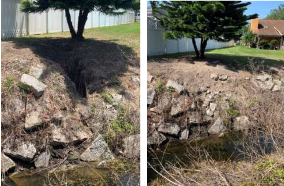
Before and after photos of the bank washout at 767 Horseman Drive