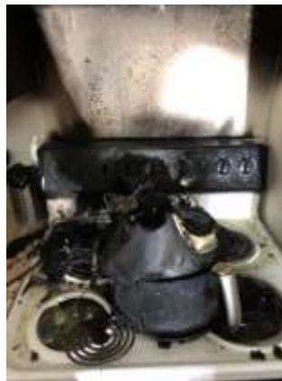
Picture of air-fryer that caused the apartment fire