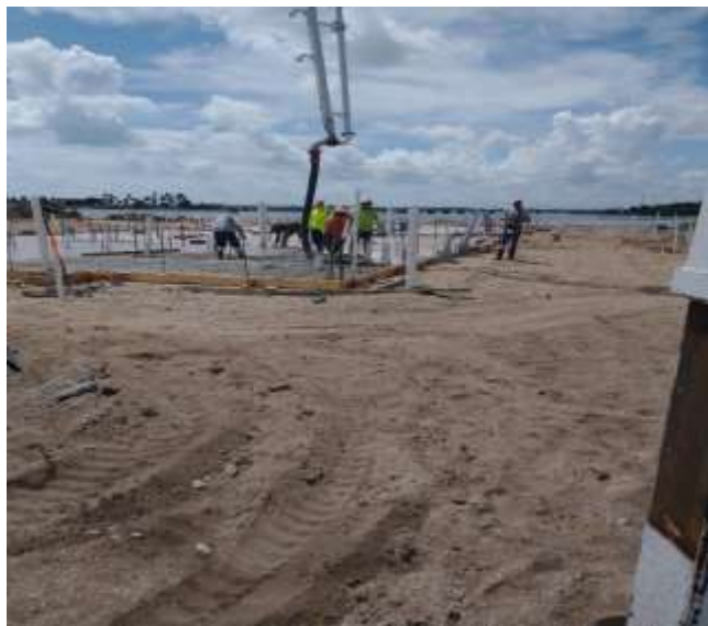
Fysh Bar & Grill Restaurant first concrete pour for the floor