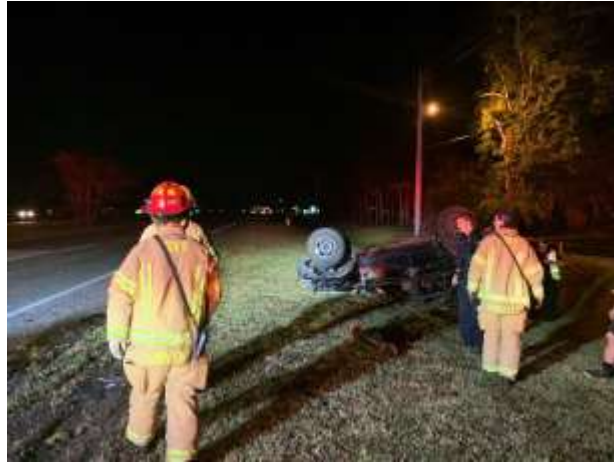
Picture of rollover motor vehicle accident