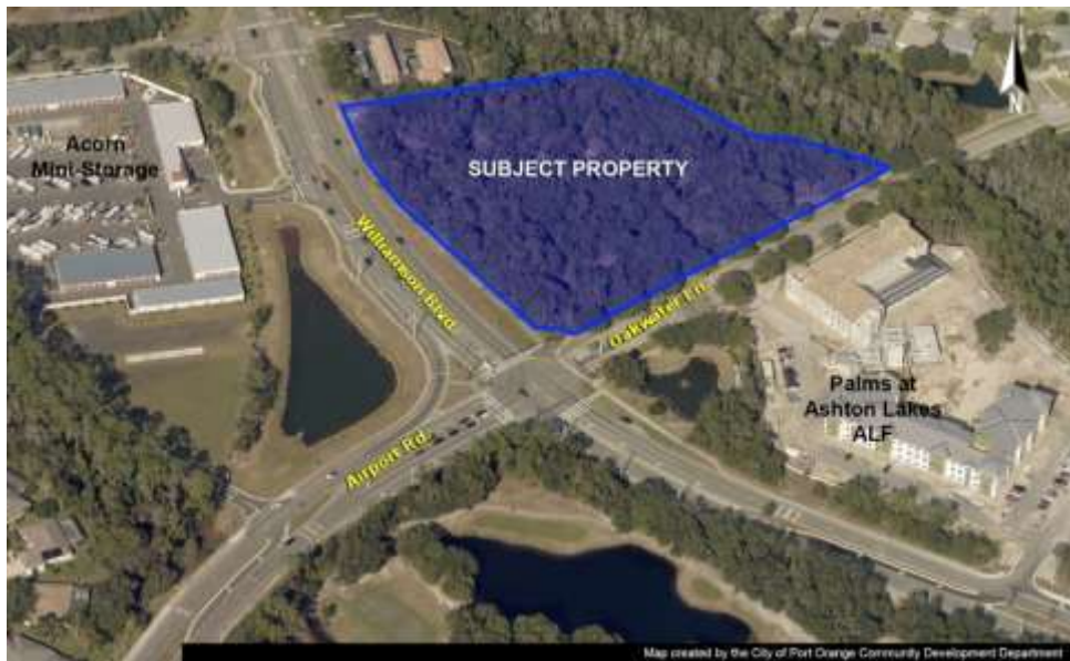
Location map of subject property at the northeast corner of Williamson Blvd and Oakwater Ln.