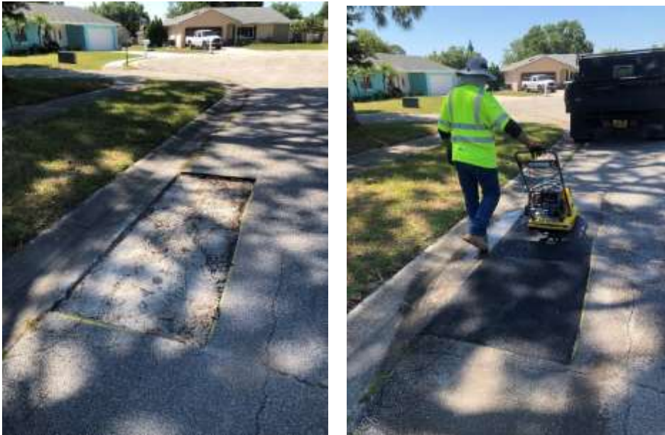
Before and after photos of the asphalt repair on Biloxi Court