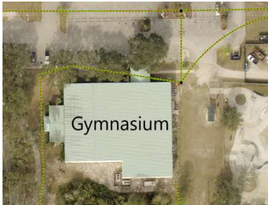
Graphic shows an ariel view of the city's gym