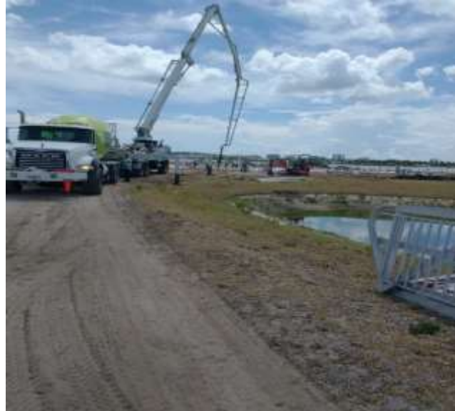
Fysh Bar & Grill Restaurant first concrete pour for the floor