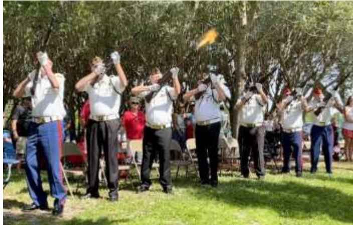
Photo of the 21 gun salute at the Memorial Day Ceremony at Veterans Park