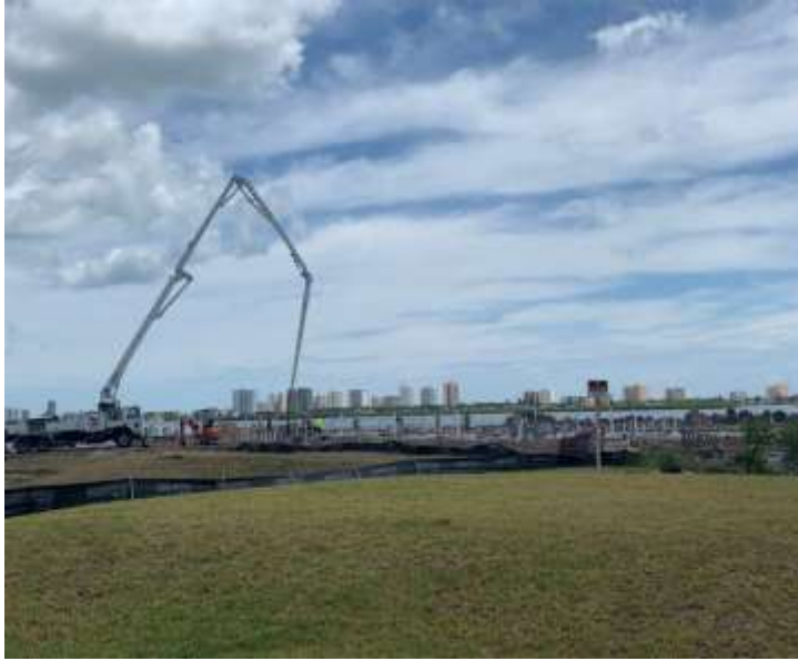
Fysh Bar & Grill Restaurant first concrete pour for the floor