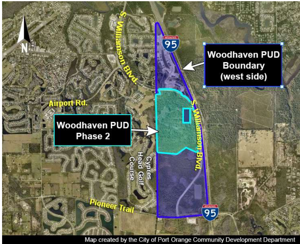
Location map of subject property on the south and west side of Williamson Boulevard and east of the Cypress Head Subdivision/Golf Course