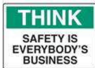
Graphic that states, "Think Safety is Everybody's Business"