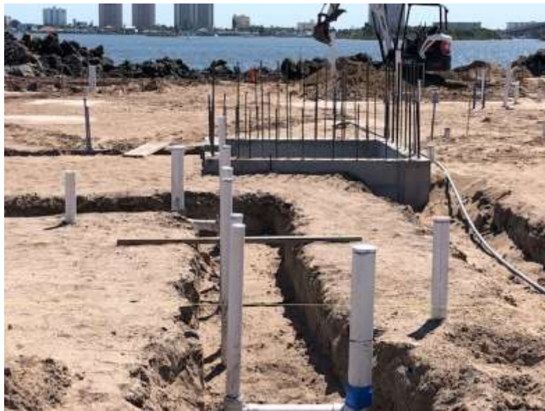
Photo of construction work in progress at Riverwalk Fysh Restaurant