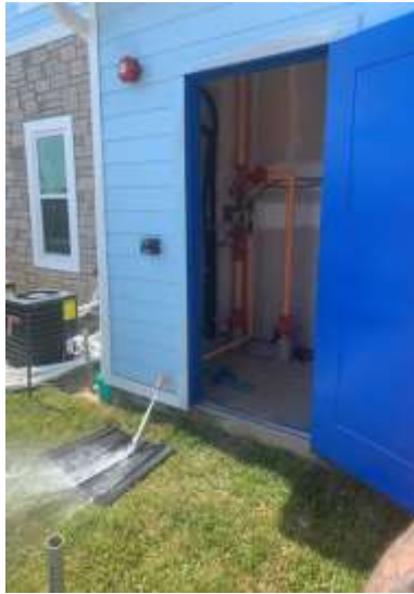
Picture of an inspector test flowing to sound the alarm