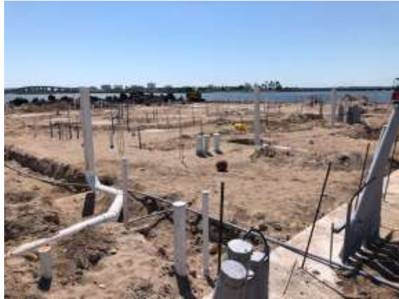
Photos of construction work in progress at Riverwalk Fysh Restaurant