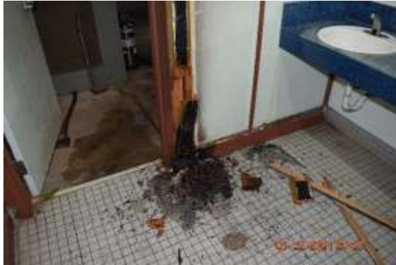
Photo of a fire in the women’s restroom at All Children’s Park