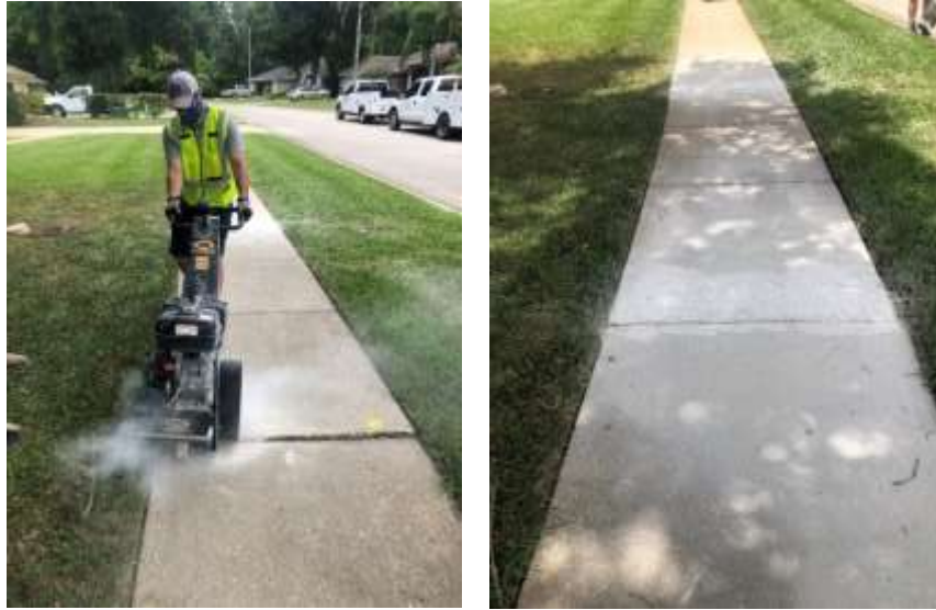
Before and after photos of staff grinding sidewalks