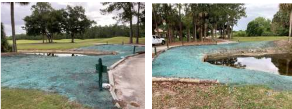
Photos of hydroseeding procedure completed along drainage area between holes 10 & 11