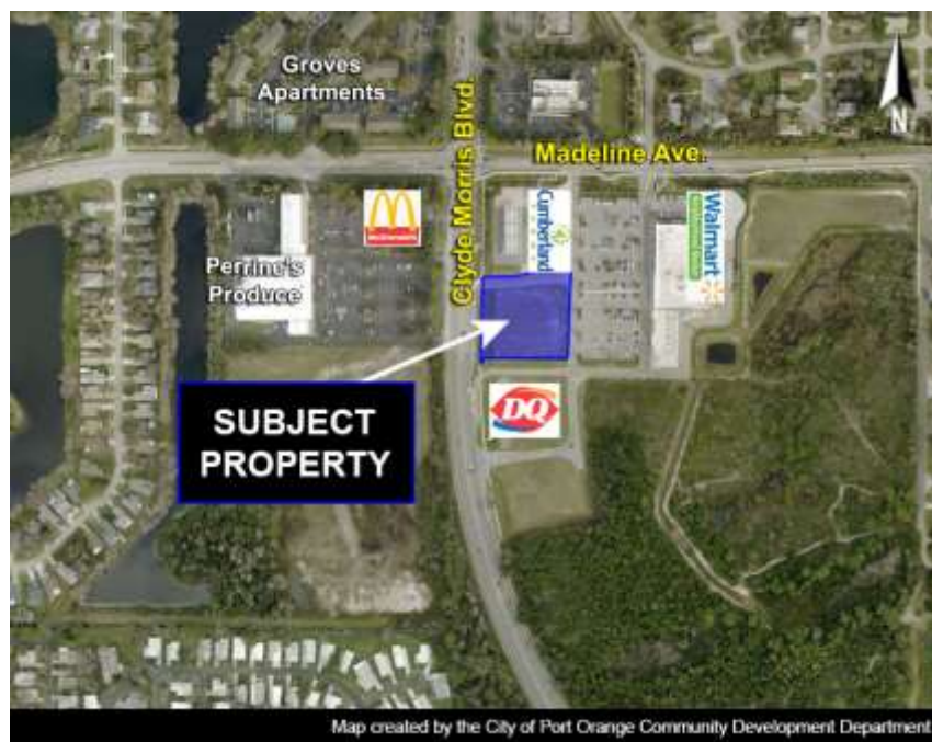
Location map of subject property at 3807 Clyde Morris Blvd.