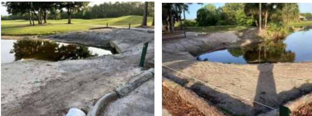
Photos of drainage area between holes 10 & 11 prepared for hydroseeding