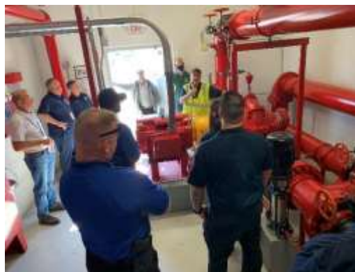
Photos of Port Orange Fire training division and other firefighters from Volusia County participating in a State Certification class