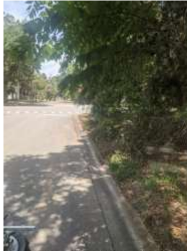
Before and after photos of the Street Sweepers cleaning the large dirt pile on a residential street