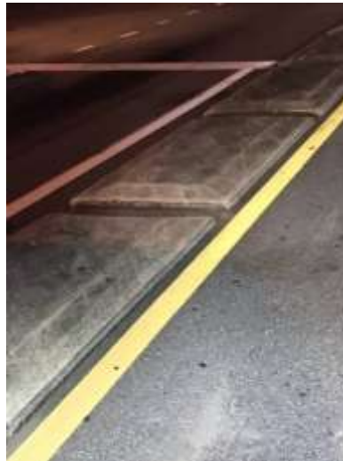
Before and after photos of Williamson Road turn lane