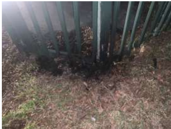
Photo of a mulch fire at the corner of Dunlawton Ave. and Swallow Tail