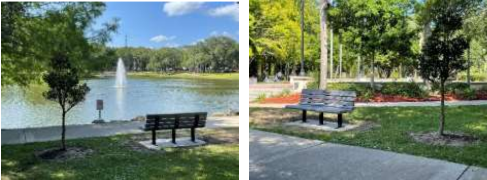
Photos of Memorial Bench near Veterans Park at City Center