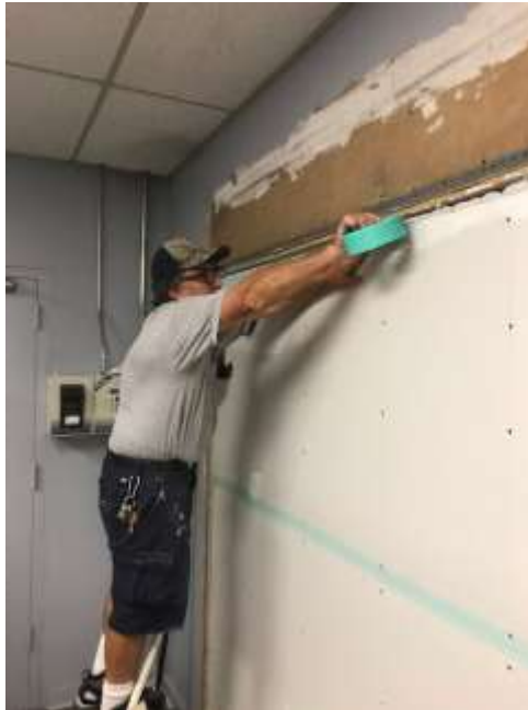
Photo of the staff repairing drywall at Public Works