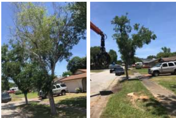
Before and after photos of a unsafe tree that was removed in the Rain Tree Subdivision