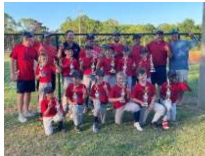
Photos of the 10U Baseball Championship Teams