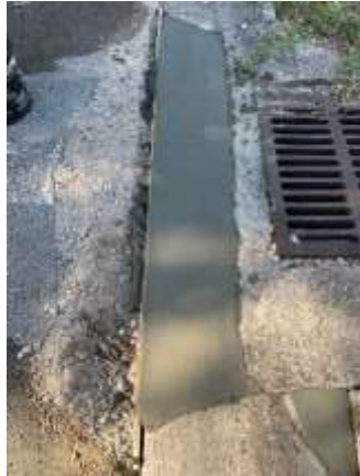
Photo of repaired curbing at 28 Golden Gate Circle