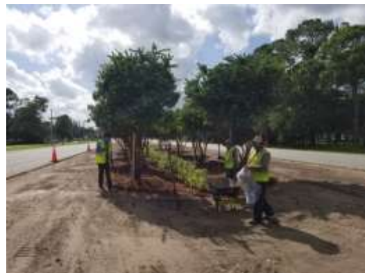
Photo of work crew placing mulch in median