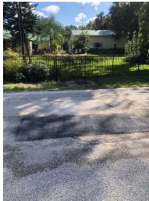
Before and after photos of the asphalt repair near 725 Herbert Street