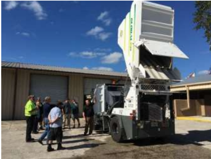
Photo of the street sweeper demonstration