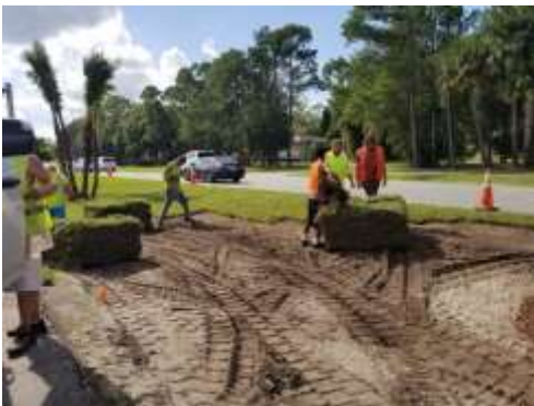
Photo of sod being installed on Dunlawton Ave. median