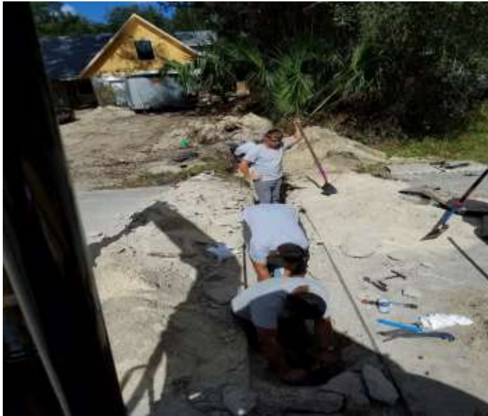
Field Ops staff installing a new water service on Houston St.