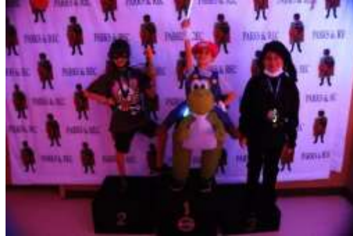
Photos from the Freaky Friday E-Sports Tournament, including the Gym Decorations and the Tournament winners in Super Smash Bros Costume