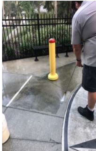
Photos of repairs on the boardwalk and pressure washing at All Children's Park