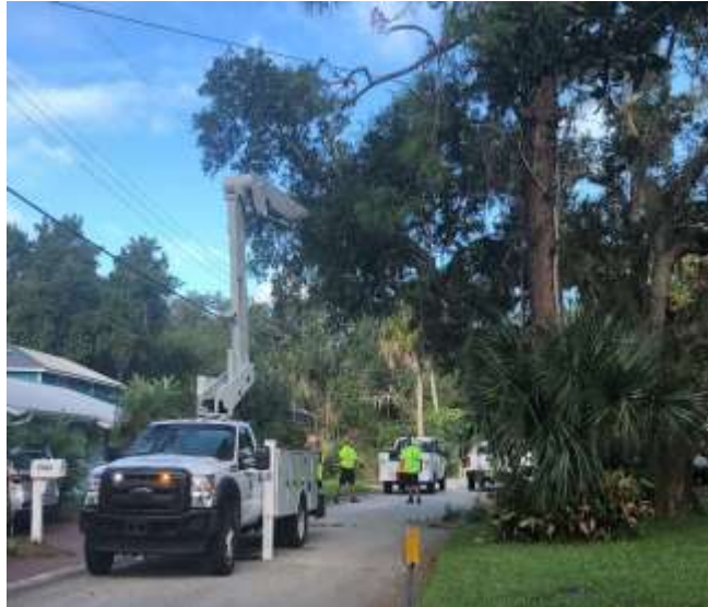
Photo of staff trimming an oak tree on West Bayshore Drive