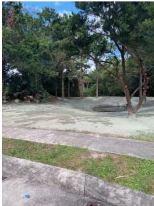
Before and after photos of the pond on Tumblebrook Drive