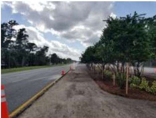
Photo of testing irrigation in median