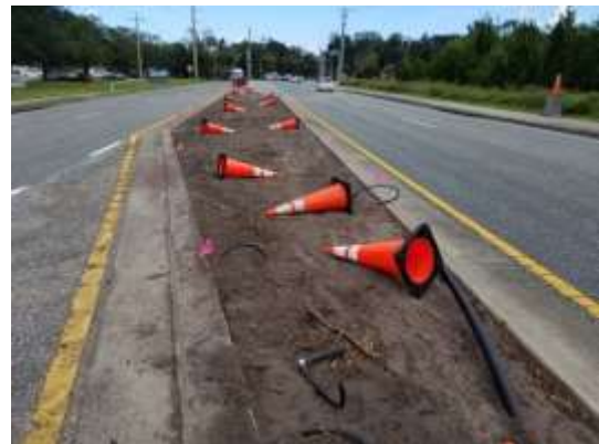
Photo of irrigation installed in median near Spruce Creek Road