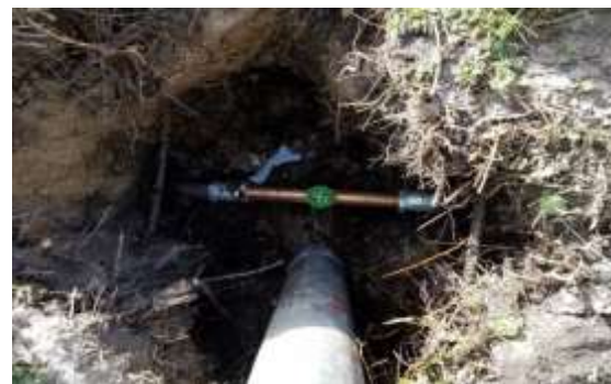
Photo of water line repair made in Maplewood MHP