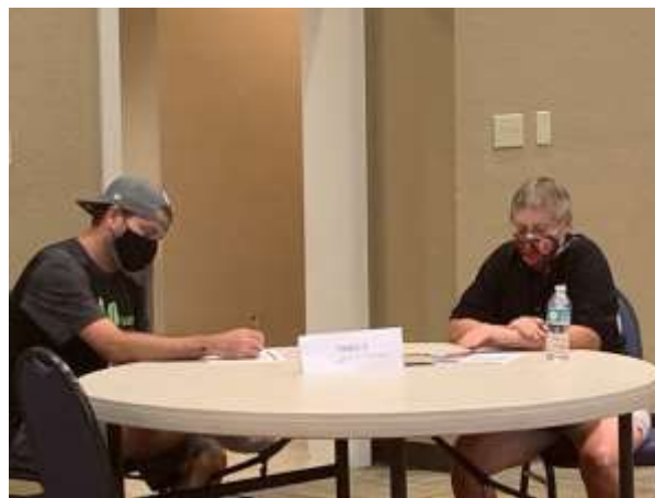
Photos from Port Orange University Session 6 with Community Development.