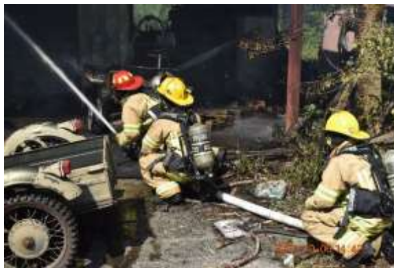
Photos of a structure fire located west of Tomoka Farms Rd.