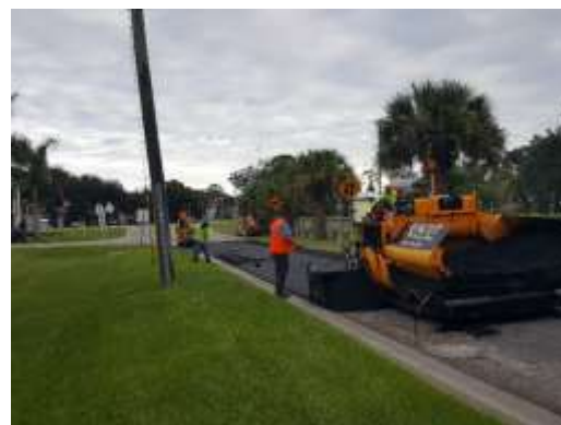
Photo of paving contractor streets on the FY20 paving schedule