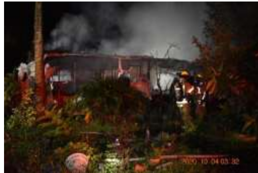
Photos of a fire that broke out in the early hours of Sunday morning