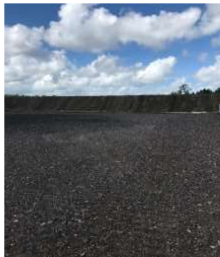
Before and After Photos of the New PD Shooting Range