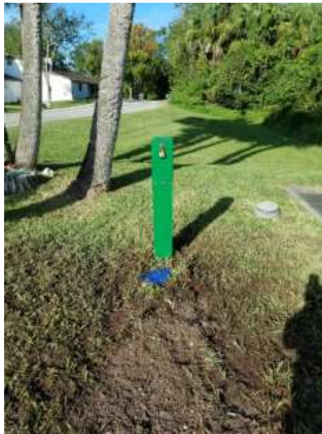
Photo of new water sampling station at Taylor Rd. and Country Lane