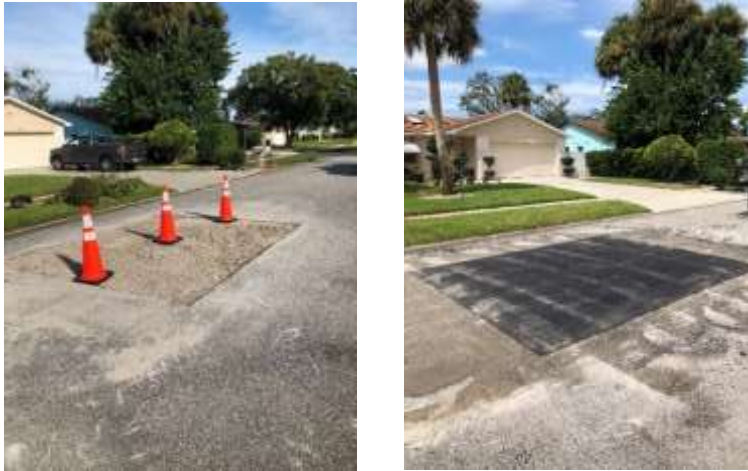
Before and After Photos of an Asphalt Repair in Front of 217 Peppermint Way