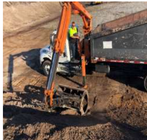
Photo of Staff prepping the PD Shooting Range Berms for Sod