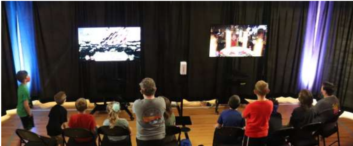
Photo of most of the E-Sports tournament participants watching two separate Super Smash Bros matches