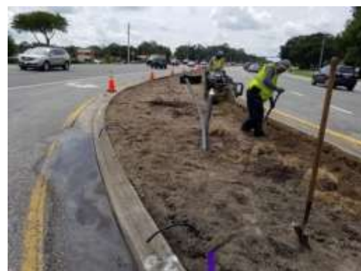
Photos of work being done stripping the sod from the median and working in the median