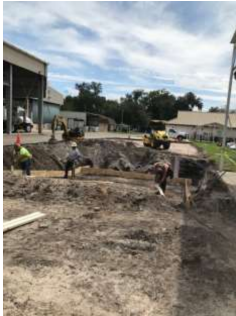
Photo of continuing work for the Sludge Trailer Parking area at the Water Reclamation Facility