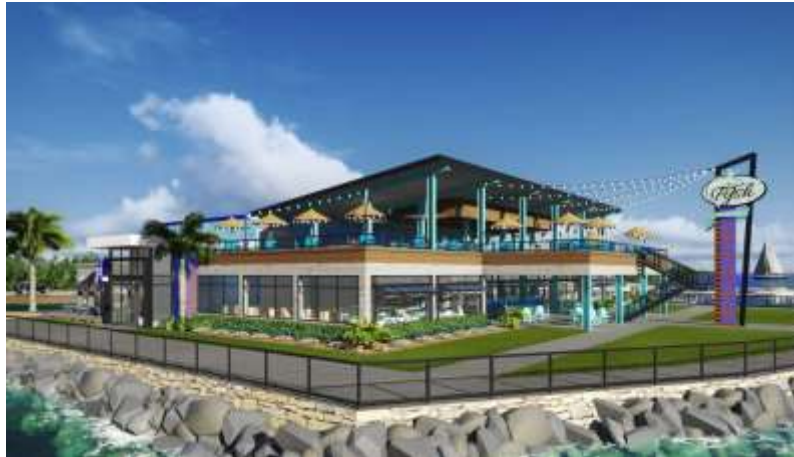
Architectural rendering of the new Fysh Bar and Grill restaurant design