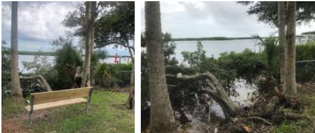
Photos of Before and After Tree was removed at the Main Street Park