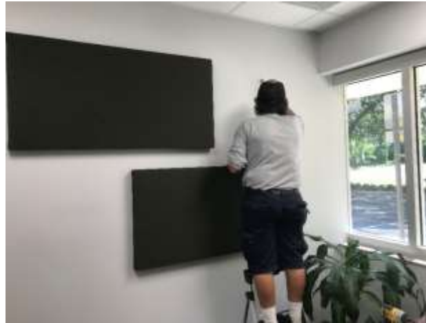
Photo of Staff Installing Sound Panels at the DLH City Center Annex and City Hall