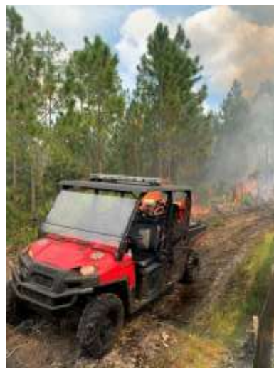
Photos of a controlled burn at the city wellfields