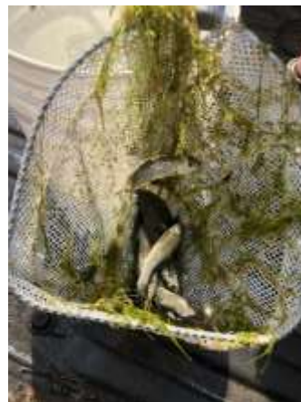
Photo of sterile grass carp being placed in the reclaimed lakes to help control pond weed