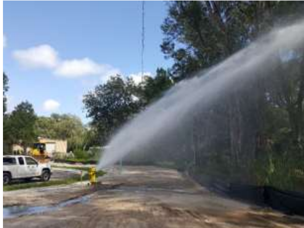
Photo of a fire hydrant flushing the water system for a partial clearance in the new subdivision