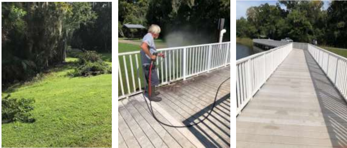
Photos of trimming brush and Pressure Cleaning the Walkway at Buschman Park