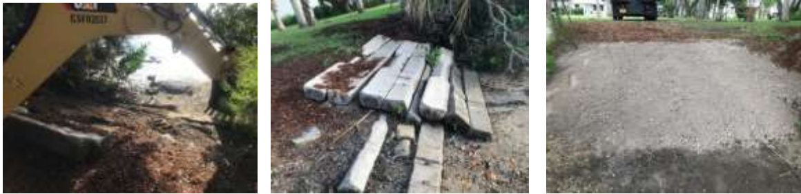
Photos of the before and after the removal of the concrete planks