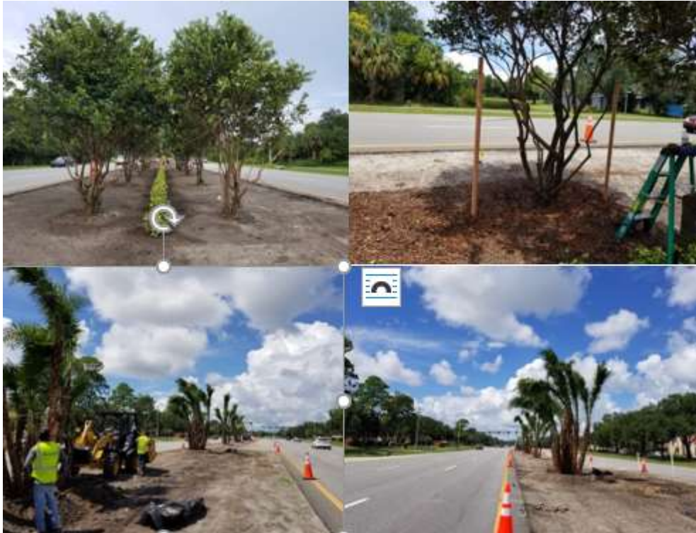
Photos of landscaping materials being installed or installed in the median between City Center Parkway and N. Swallow Tail Drive.