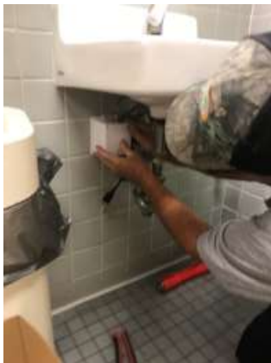
Photo of Staff Installing Touchless Faucets in the Lobby Restrooms at City Hall