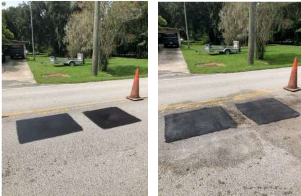
Before and After photos of Asphalt Repairs on Hebert Street