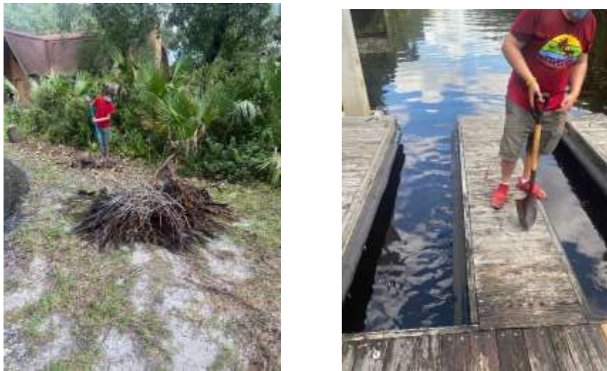
Photos of the Boy Scout Troop earning community service hours at Russell Property