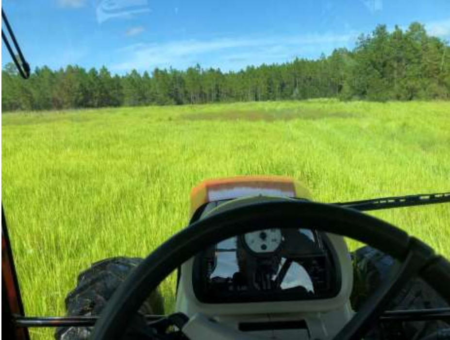
Photo of cogon grass being treated in the City Forest