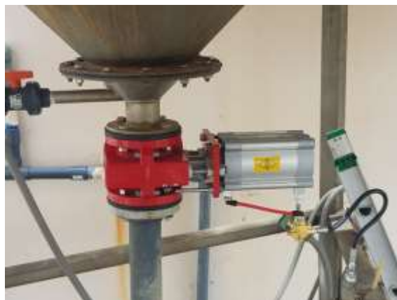
Photo of new pinch valve installed at the WRF