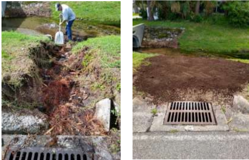
Crews repair stormwater basin at the intersection of Jackson and Rockledge Lane