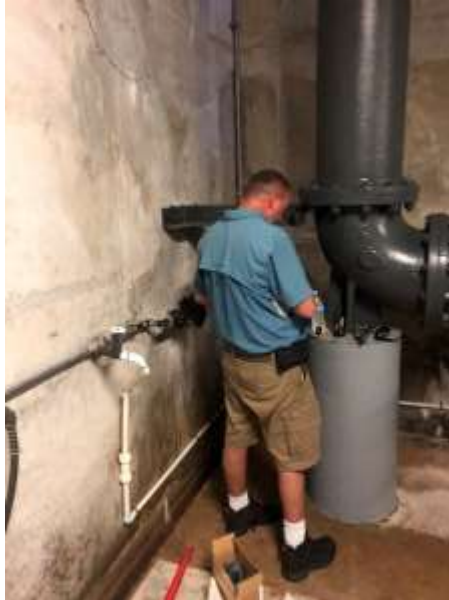
Photo of repairs to a backflow device at Ponce Lift Station