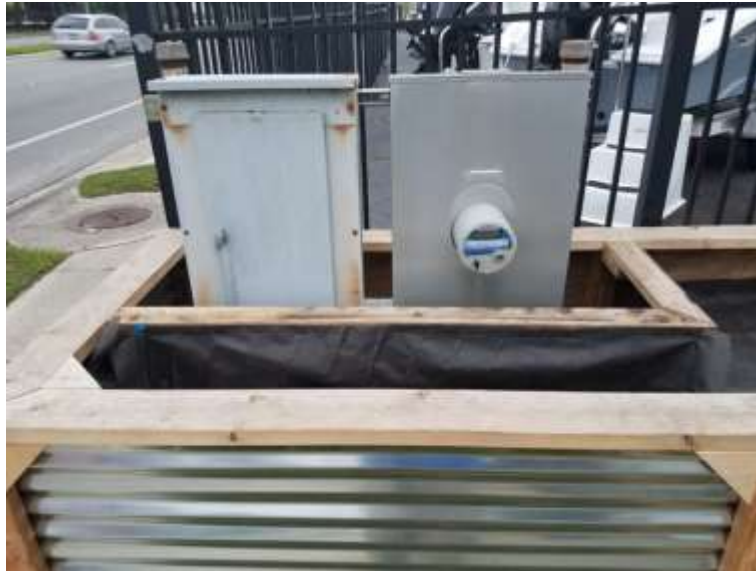
Photo of planter constructed around electrical boxes used for the grinder stations on Ridgewood Avenue