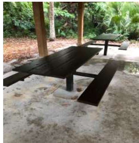
Photo of picnic table repainted