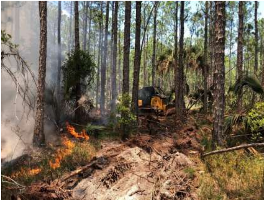
Photo of Forestry Services dozer containing the small wildfire on 5/22/20