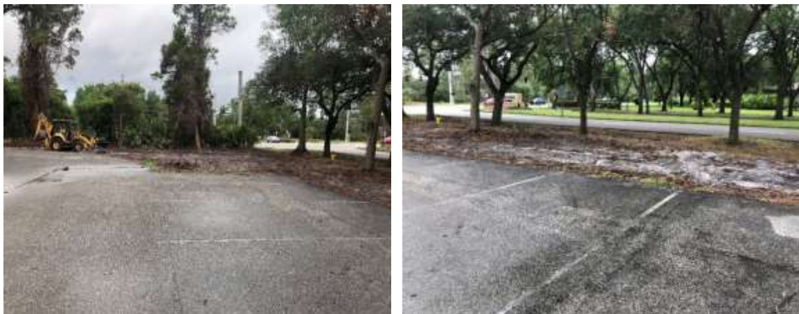
Photos of Fire Station 73 Parking Lot being prepped for Hydroseed