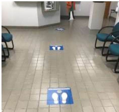
Photo of Social Distancing Floor Minders at the DLH City Center Annex