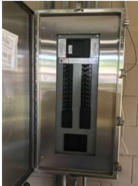
Photos of the before and after for replacement of the chlorine feed system breaker panel at the Water Reclamation Facility