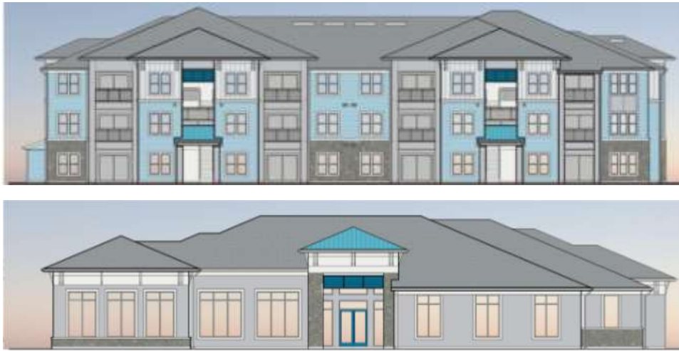
3-story building and clubhouse elevations for the Newport Apartments project.