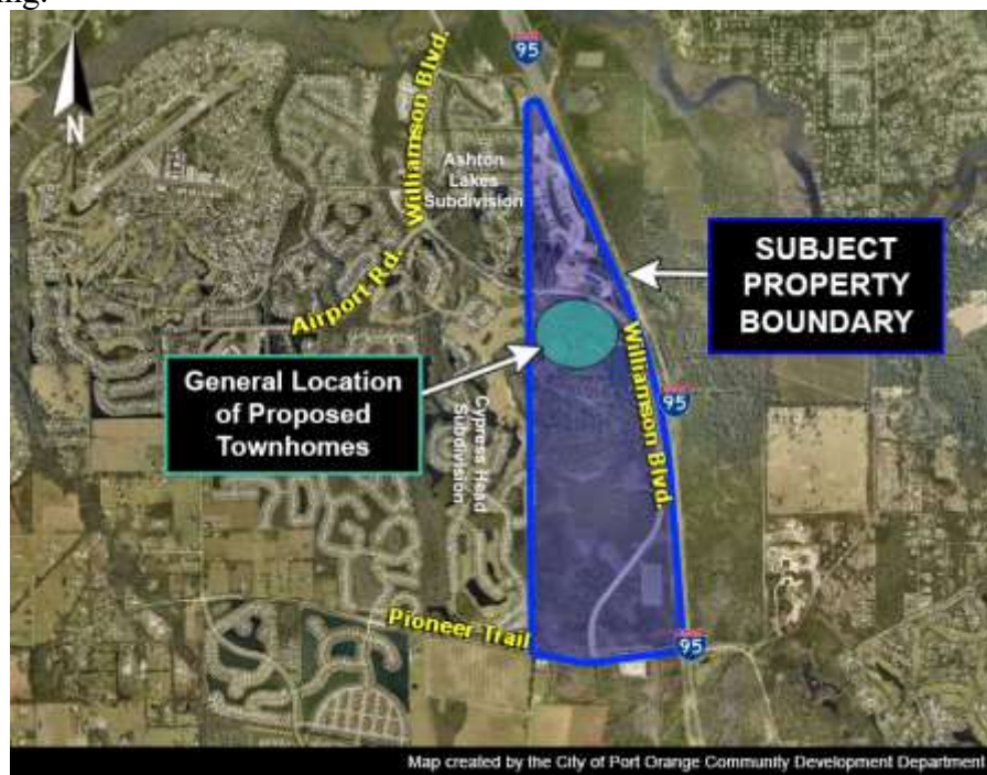
Location map of the Woodhaven Subdivision Planned Unit Development, located north of Pioneer Trail, east of Williamson Blvd., west of I-95, with townhomes are indicated on map.