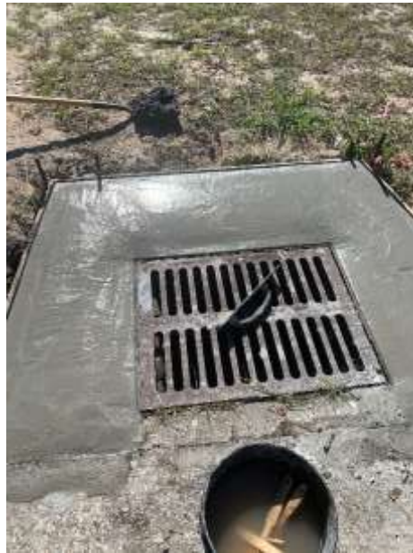
Photo of Concrete Basin at 1134 Viking Drive