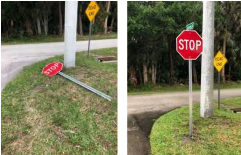
Before and After Photo of Downed Stop Sign on James Street