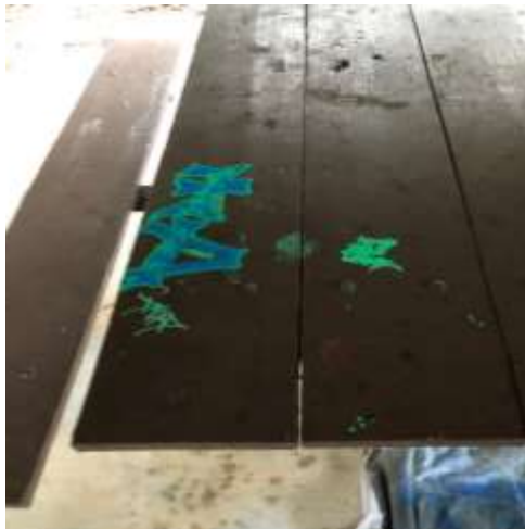
Photo of graffiti on the picnic table