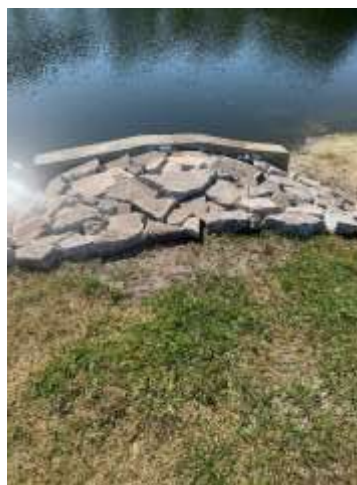
Before and After Photos of the Head Wall at Cypress Head Golf Course