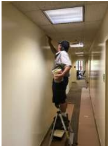
Photo of Staff Painting Hallway Walls at City Hall