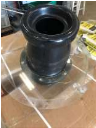
Photo of cracked cover