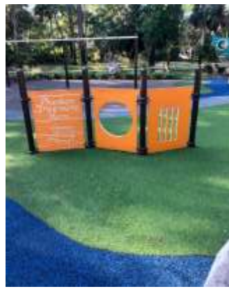
Photo of cannon platform