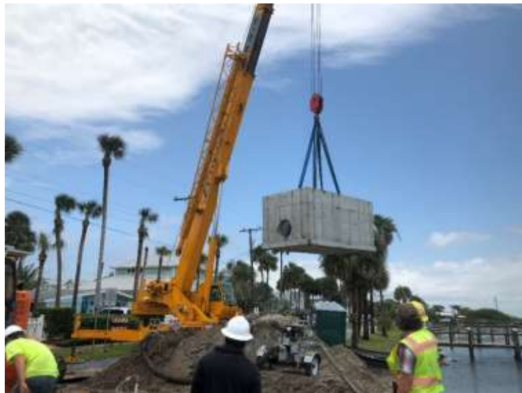
Photo of outfall structure being install on Halifax Dr. at Meeker Street