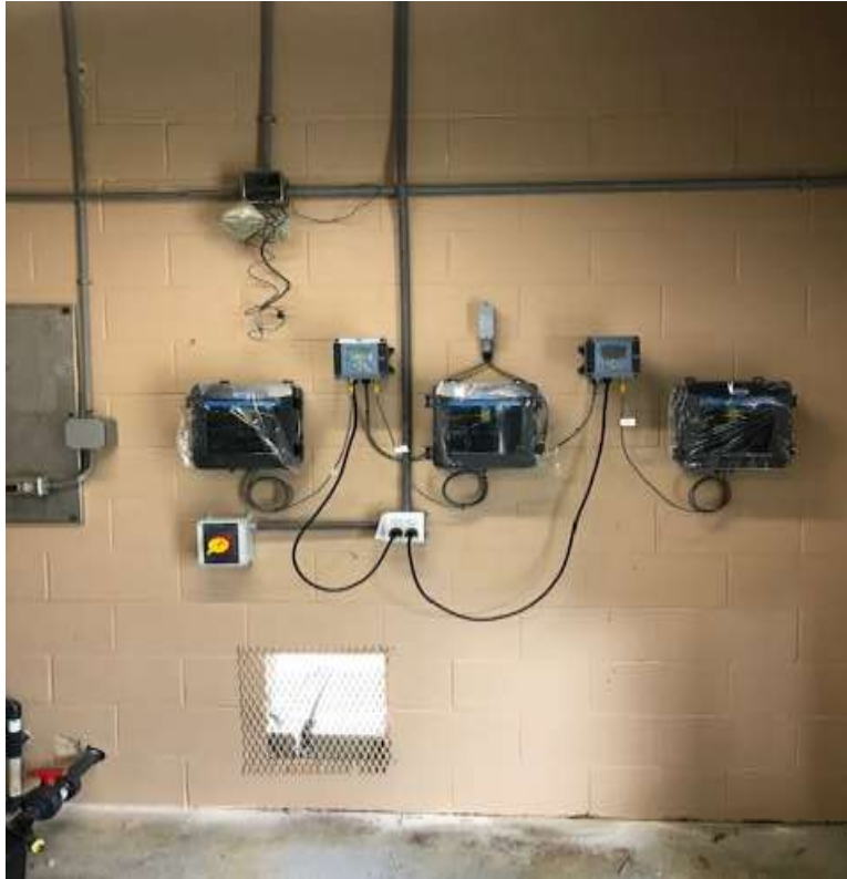
Photo of new chlorine analyzers installed at the WRF