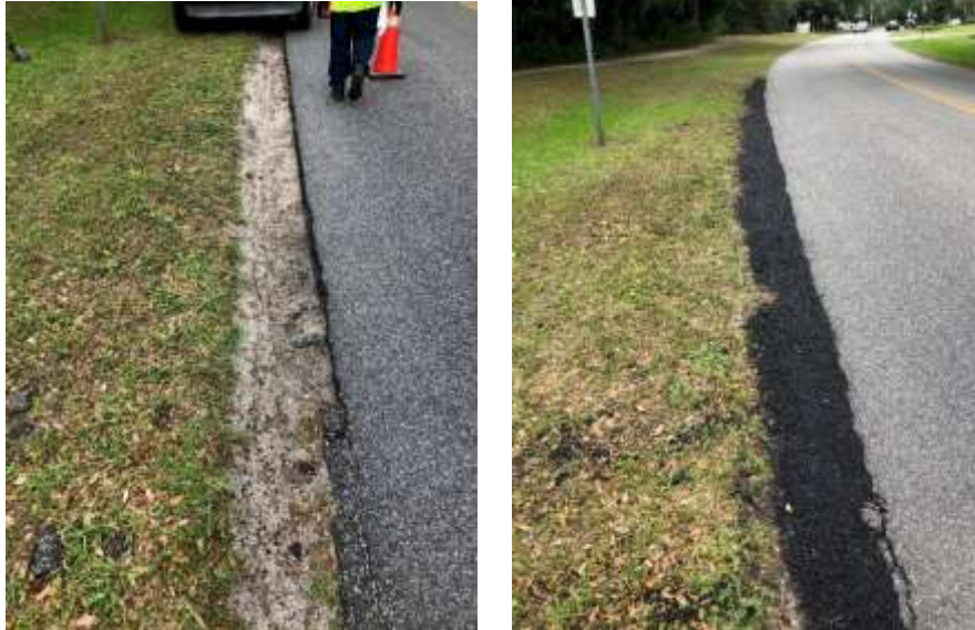
Before and After Photos of the Shoulder Repair on Village Trail