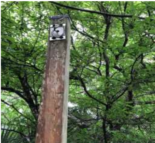
Photo of broken light pole