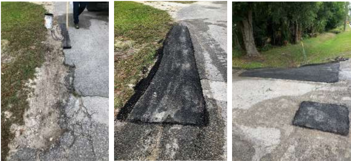
Staff filled in the shoulder of the road on Village Trail with asphalt to eliminate the hazardous drop off on the Right of Way