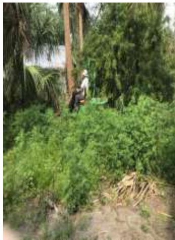
Photo of mowing