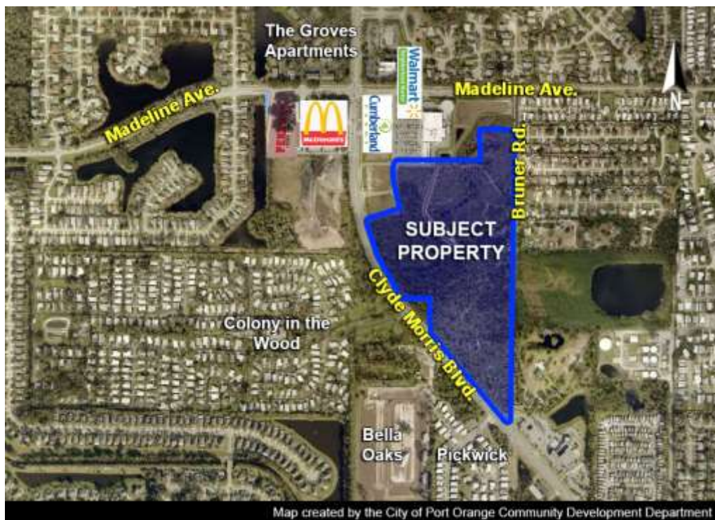
Map indicating location of proposed multi-family development located along Clyde Morris Boulevard, south of Madeline Avenue, between Clyde Morris Boulevard and Bruner Road.