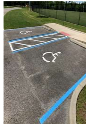
Photos of crew repainting the handicap lines in the parking lot. Photo of repainting completed