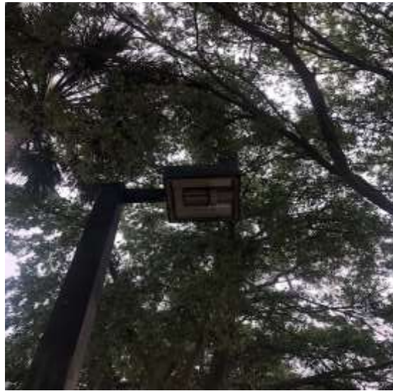
Photo of light pole with new glass lenses at Memorial Park