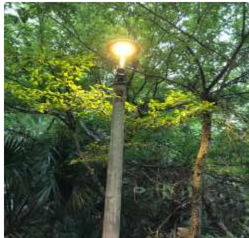
Photo of light pole repairs completed