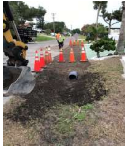
Before and After Photos of a new Storm Drain Pipe installed at 3602 S. Peninsula Drive