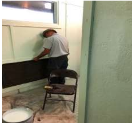
Photos of the restrooms being painted inside