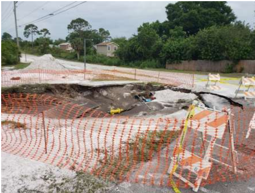
Photo of damage to sidewalk and road caused by a fire hydrant that was struck by a vehicle over the weekend on Madeline Ave.