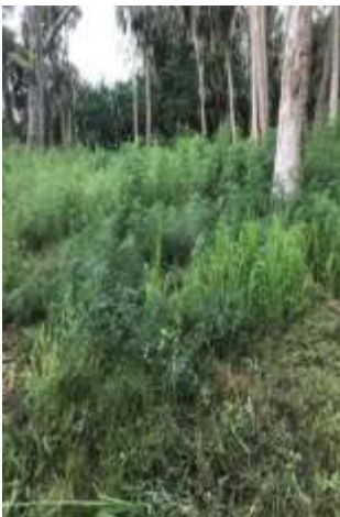
Photo of land area before mowing