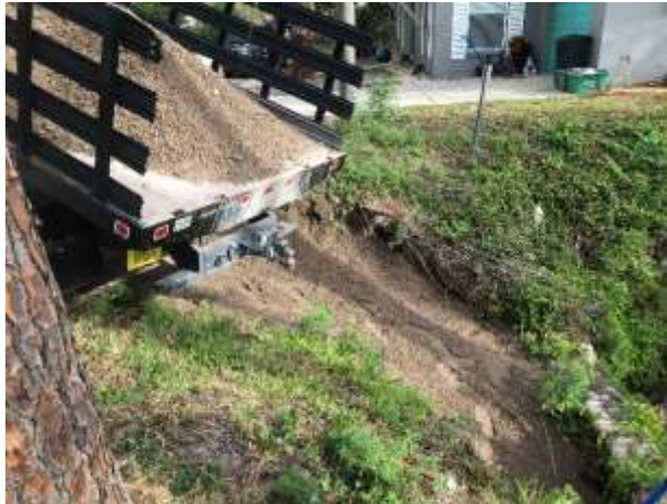
Photo of Staff filling in the washed-out spillway on Alexander Ave