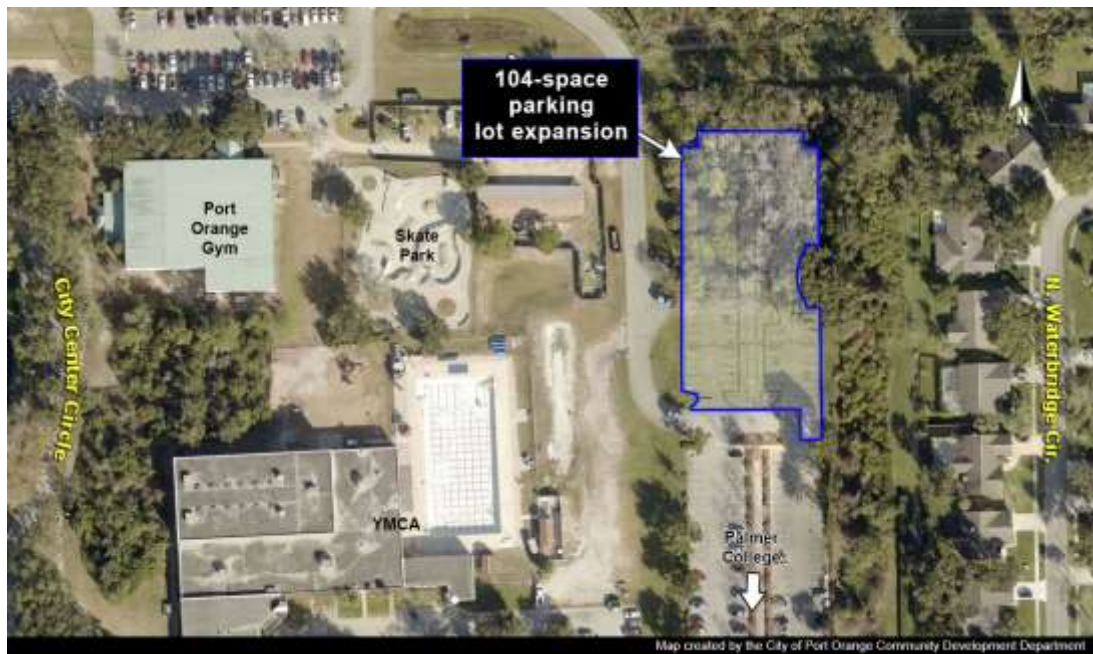
Location map with site plan overlay of 104-space parking lot expansion at 4777 City Center Parkway.