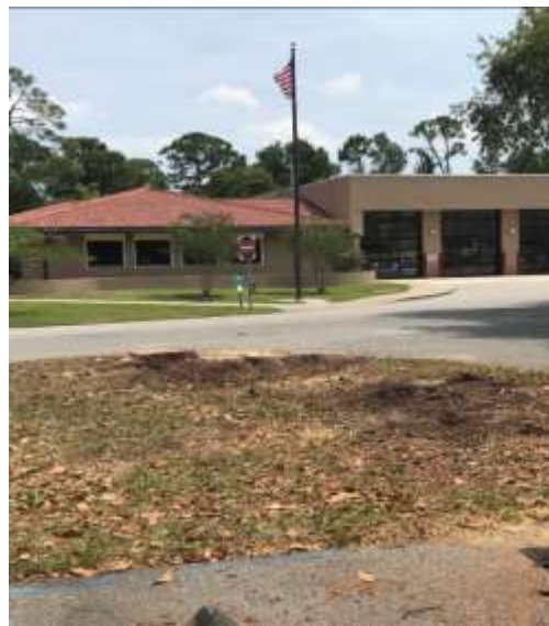
Before and After Photos of Fire Station 73's Parking Lot