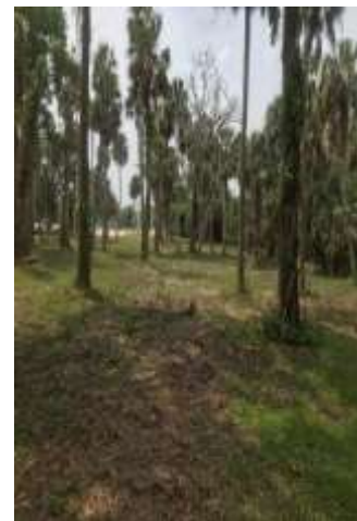
Photo of completed mowing