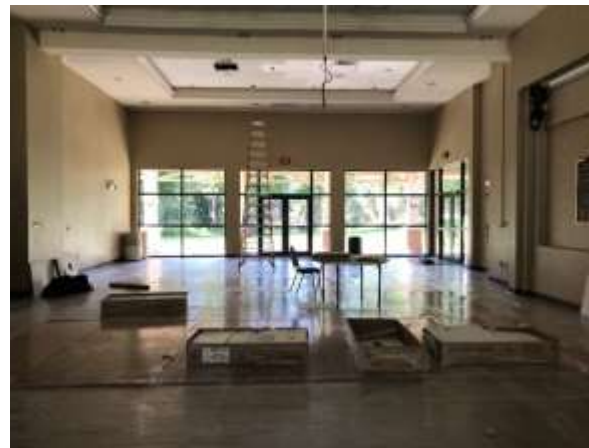
Photos of the Lakeside HVAC project underway