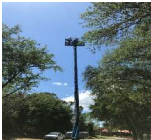
Photo of the Parks crew training on the new lift