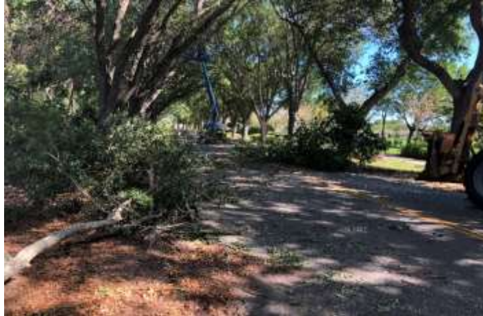
Photo of Crew Trimming Trees at City Center Parkway