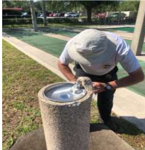
Photo of repairs being made to the broken drainpipe and leaking water fountain at the Adult Center