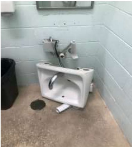
Photo of broken sink