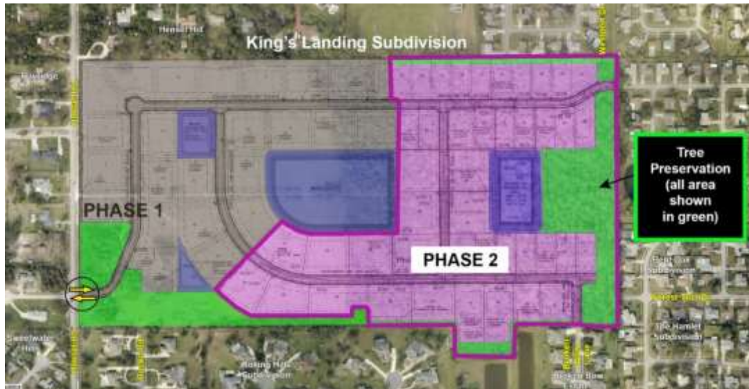
Location map of King's Landing Subdivision, Phases 1 and 2, with Tree Preservation area delineated

excavation) on Phase 2 is anticipated to begin in mid-April. Again, Phase 2 (pink boundary line) consists of 45 single-family lots (13 one-acre lots and 32 - 20,000 square-foot lots), along with tracts of land for common area, tree preservation, and stormwater. The area highlighted in green represents the area on the site where existing trees are to remain.