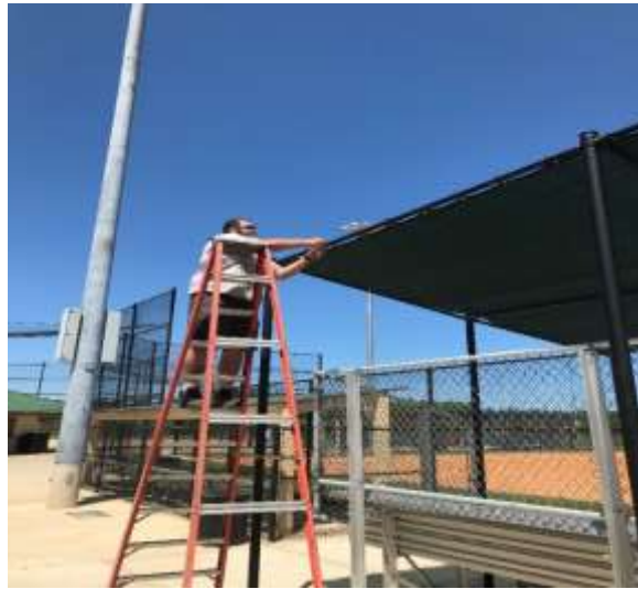
Photo of new sunshades being installed