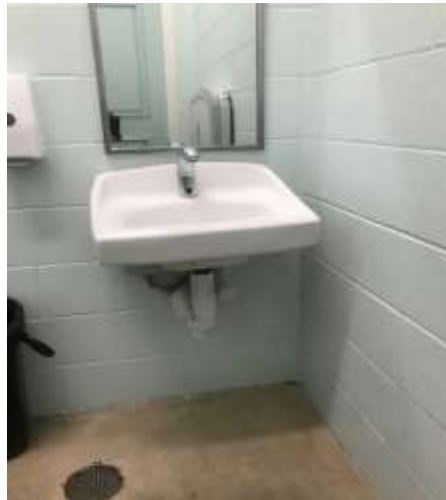
Photo of new sink installed