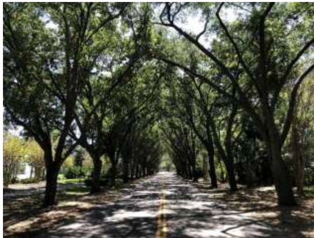
Photo of the Completed Tree Canopy at City Center Parkway