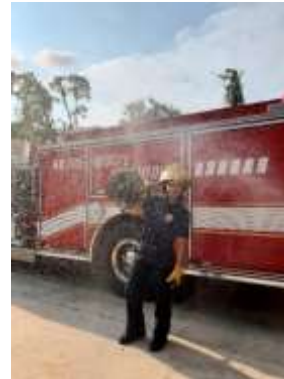
New hire training