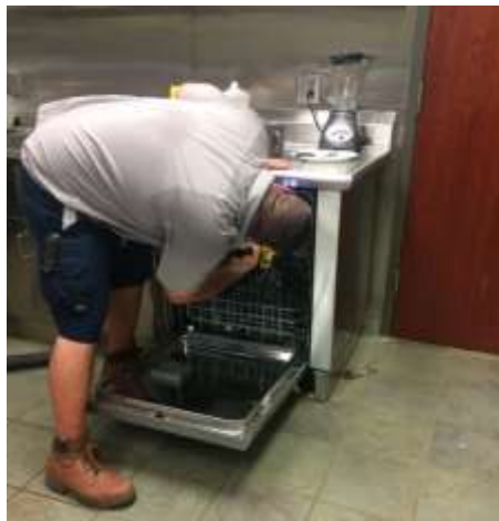
Maintenance Staff replace the dishwasher at fire station 72