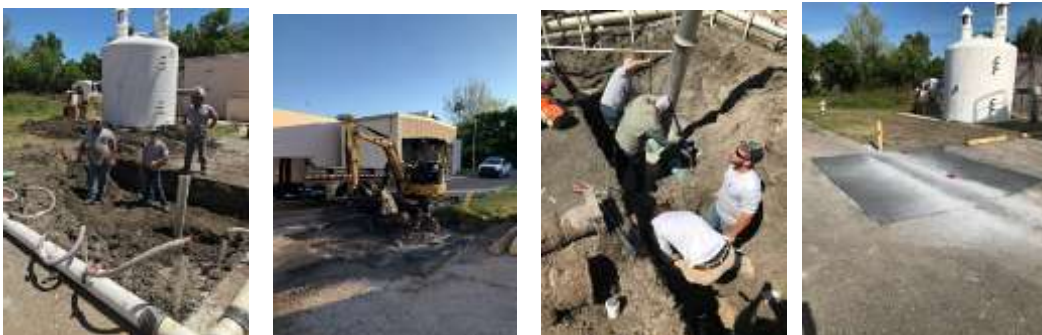
Photo of Danus Utilities repairing a leaking reclaim line at the WRF