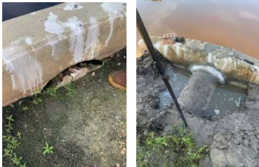
Before and After Photos of the Repirs of a Headwall at Cypress Head Golf Course