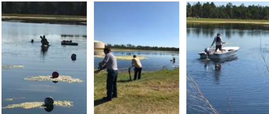
Photo of reclaimed lakes having the unwanted pond weed removed