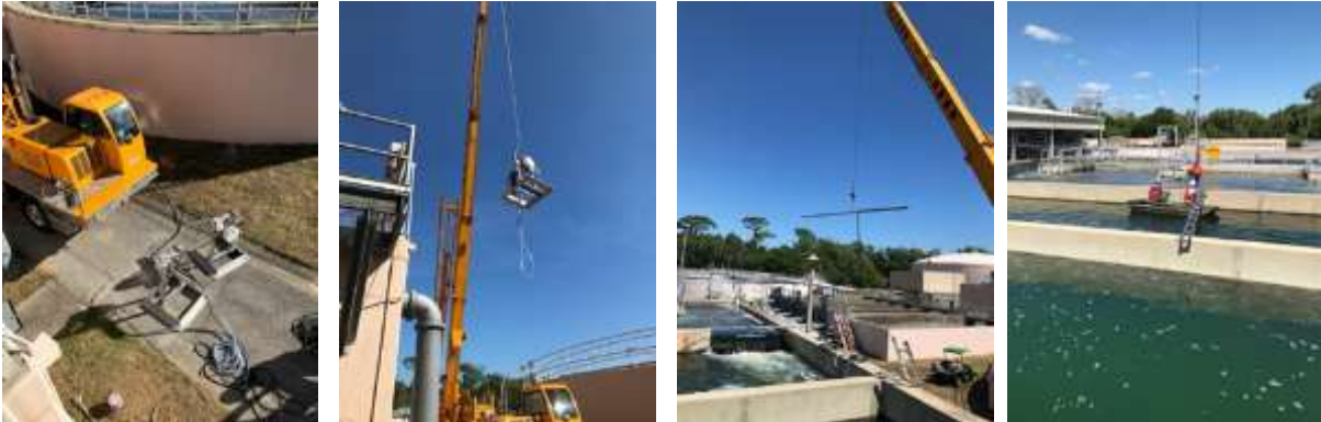
Photo of new chlorine mixers being installed at the WRF