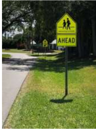
Photo of the Crosswalk Sign at the corner of County Lane and Bellflower Drive