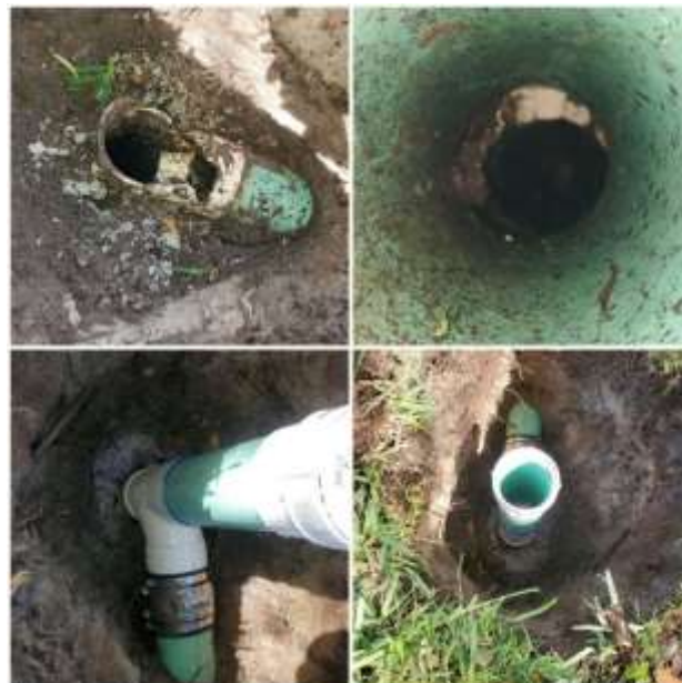
Photo of sewer laterals repair by collections crew. Repairing broken clean outs helps keep dirt and debris out of the collection system and lift stations.