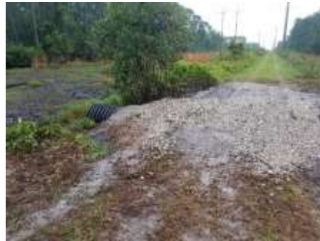
Photo of repaired drainage culvert off Shunz Rd.