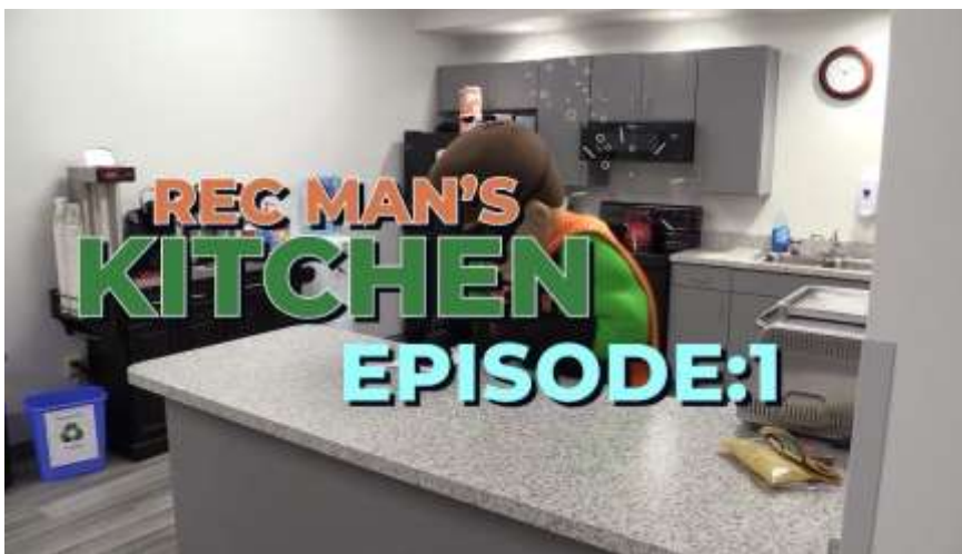
Photo of Rec Man's Kitchen Episode 1