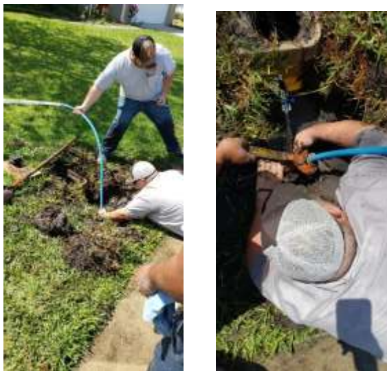
Photo of Field Ops crew installing a new water service on Knotty Pine