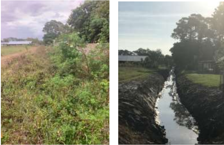
Before and After Photos of the Sleepy Hollow Ditch behind Publix