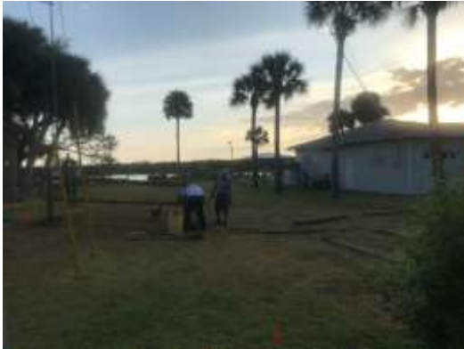
Photo of crew working on Split Rail Fence