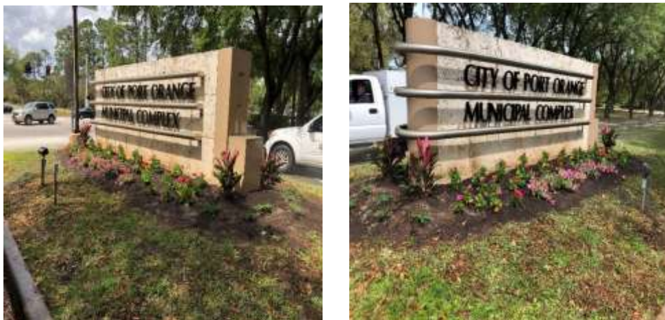
Photo of the Entrance Sign at City Center Parkway