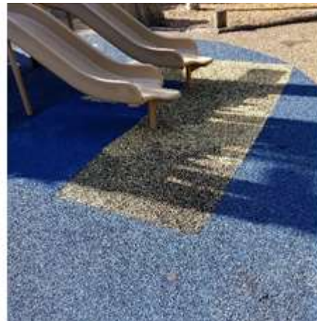
Photos of All Children's Park Playground Surface – Before and After