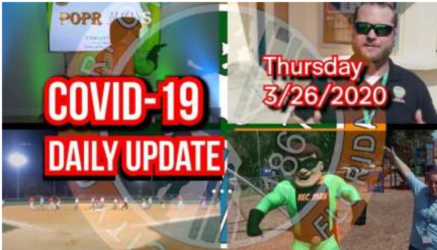
Photo from COVID-19 Daily Update Introduction