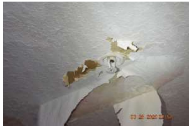
Photos from fire at Ashton Lakes apartment