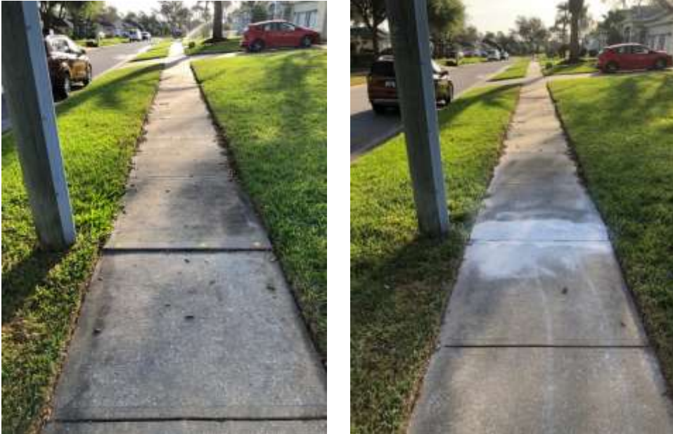
Before and After Photos of Sidewalk Grinding in the Sterling Chase Subdivision