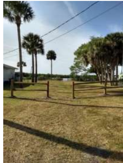
Photo of completed Split Rail Fence