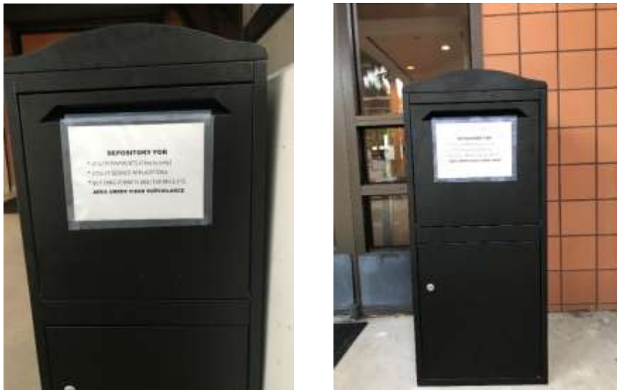
Photo of Drop Boxes for Utility Payments at City Hall