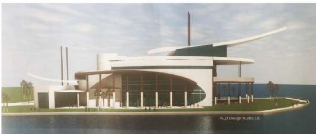
Artistic renderings of Riverwalk restaurant (Fysh Bar and Grill)