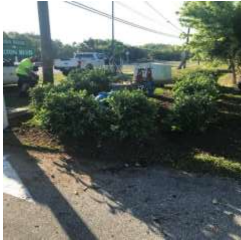
Photo of the new plants around the Master Meter at Lamplighter