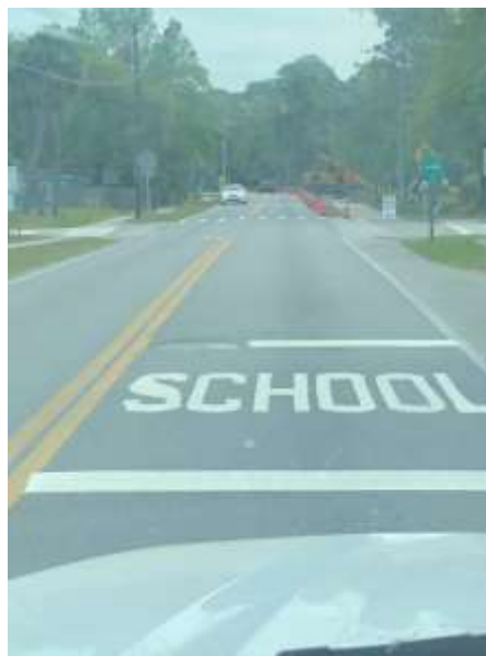
Photo of newly Striped School Legend on Herbert Street