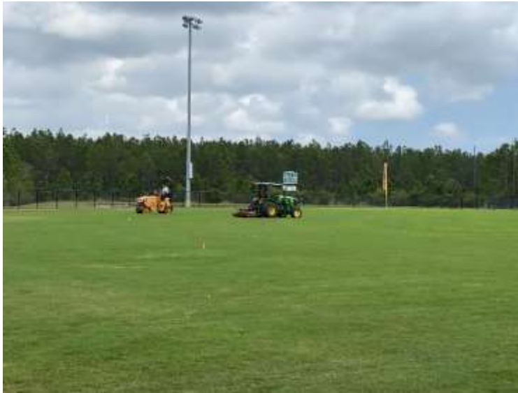
Photo of Parks Crew rolling Coraci Fields