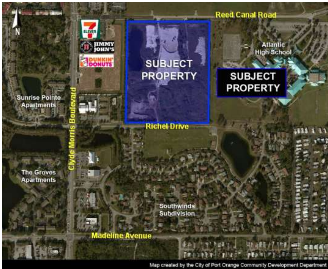
Location map of proposed New Port Apartments site located on the south side of Reed Canal Road, east of Clyde Morris Boulevard