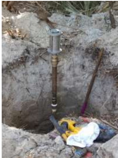
Photo of new air release valve installed by Field Ops in the Halifax River