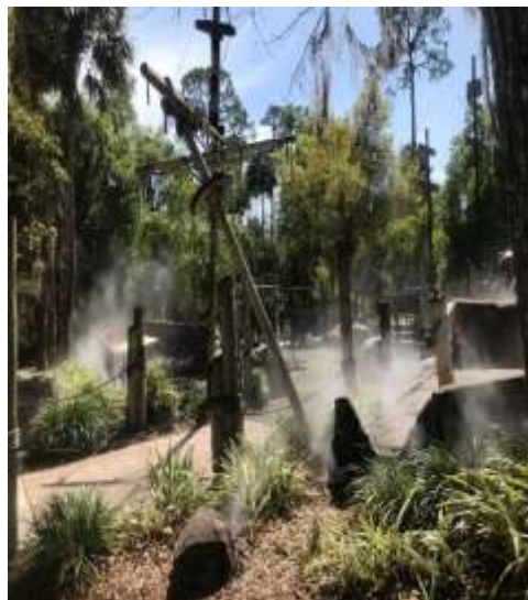
Photos of the misters on at the All Children’s Park