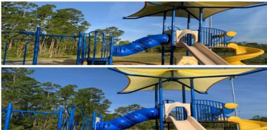
Photos of before and after cleaning completed by the Spray Soft Exterior Cleaning Company