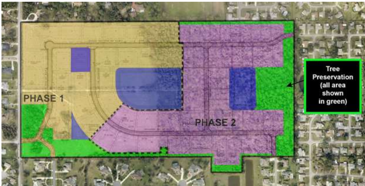
Graphic showing Phase 1 and Phase 2 of plans for King's Landing, with the tree preservation area delineated.