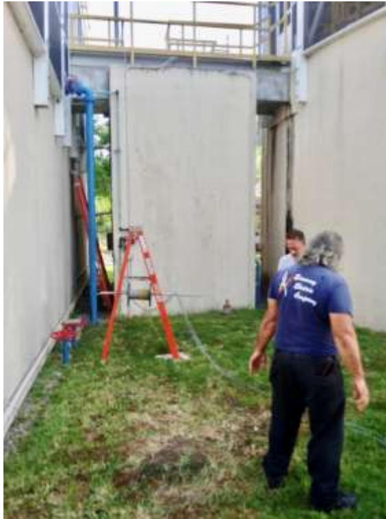
Photo of Economy Electric installing some new communication wires for level transmitters.