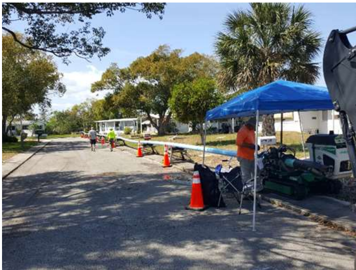
Photo of 6” fusible PVC being installed during the South Commonwealth project