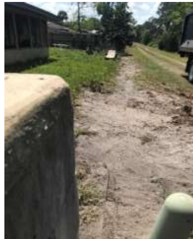
Before and After Photos of the Removal of the Harms Way Wall