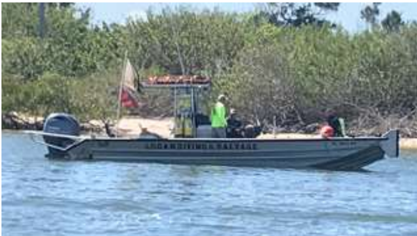
Photo Logan Salvage and Diving preparing to install more sandbags on the exposed 16” & 36” lines under the river bottom