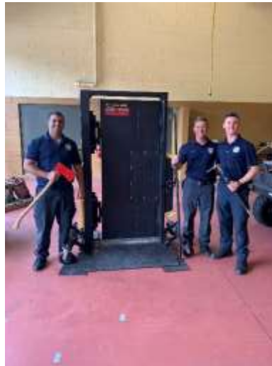
Photo of Port Orange Fire & Rescue posing in front of forcible entry door prop.