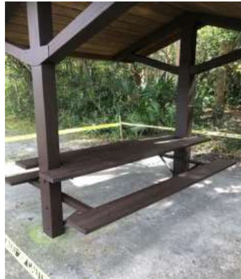
Photo of burned pavilion and after the pavilion was rebuilt