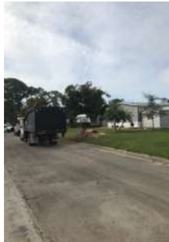
Before and after photos of tree removal on Orange Avenue