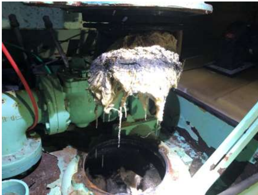
Photo of clogged lift station pump. Rags and flushable wipes continue to be an issue in the collection system.