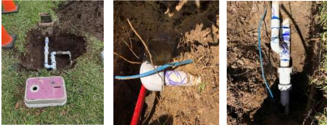
Photos of irrigation pipe repairs