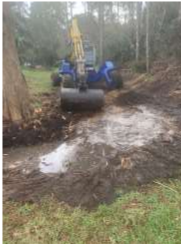
Photo of the Kaiser working on Pelham Drive Ditch