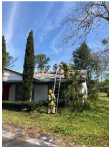
Photo taken of operational training on city property.