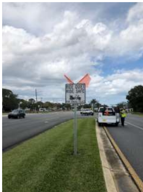
Photo of installed sign for Bike Week