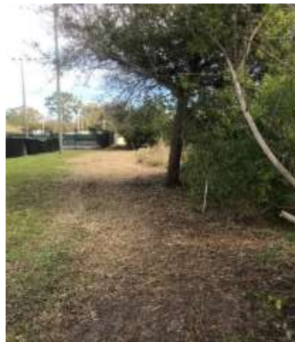
Photo of before and after cutting and trimming