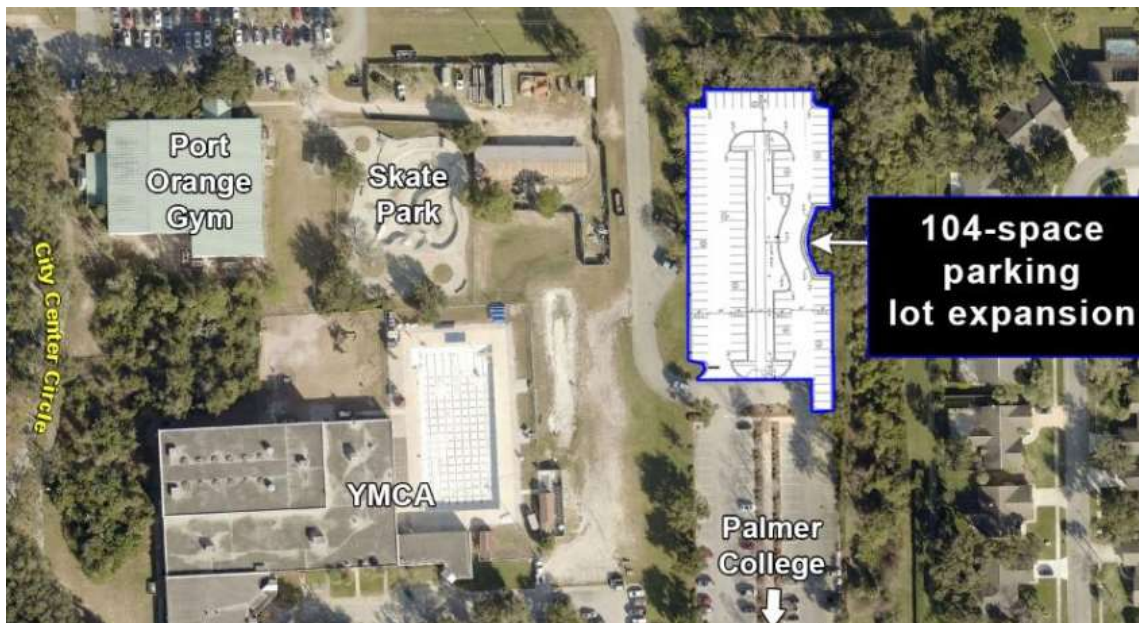
Location Map Palmer College 104-space parking lot expansion site plan overlay, located just east of the Port Orange Gym