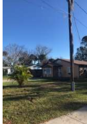
Before and after photos of tree removal on Taylor Avenue