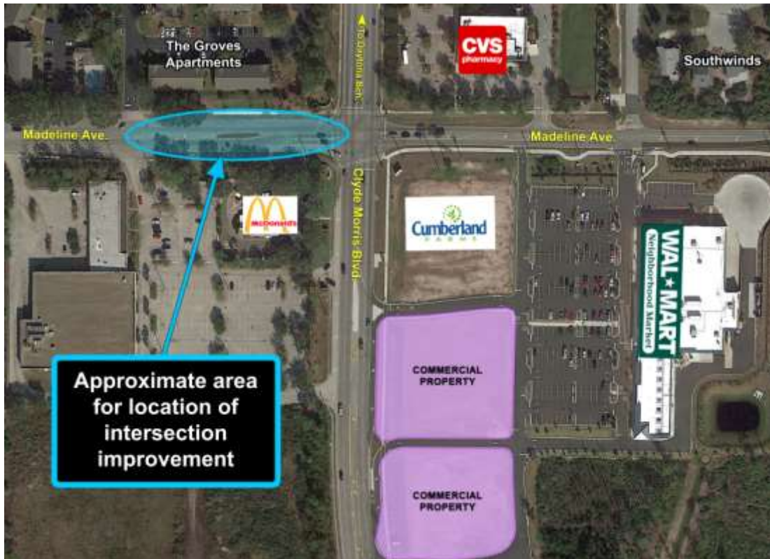
Location map of eastbound Madeline Avenue left-turn lane construction area