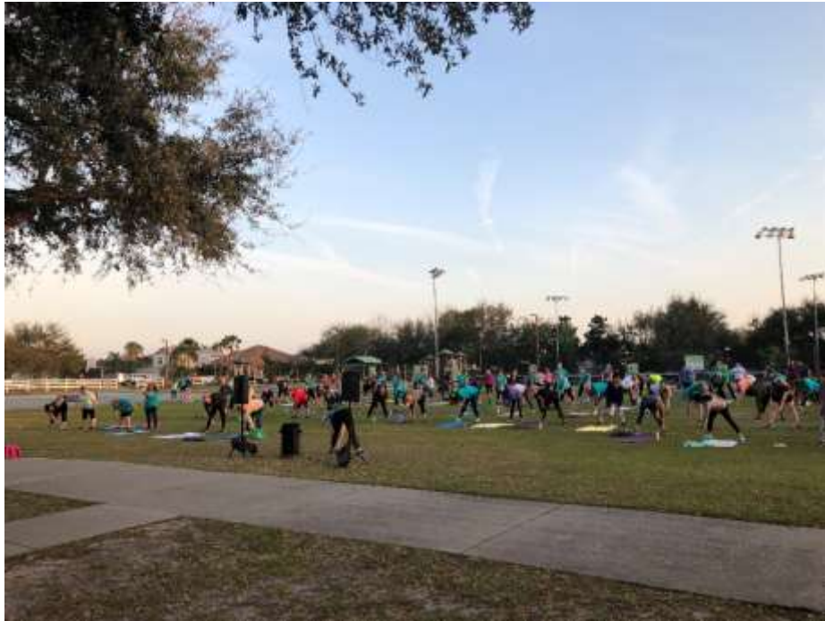
Photo of Get Fit Attendees at the first scheduled work out