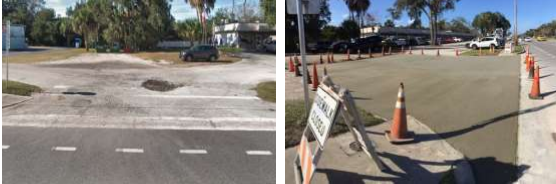
Before and after photos of apron repairs