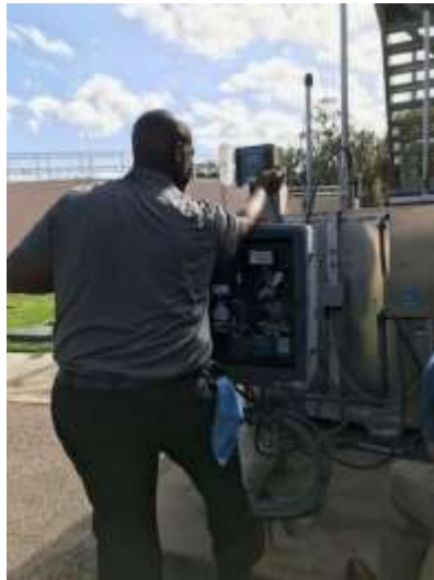
Photo of Hach technician performing maintenance on an analyzer at the WRF.