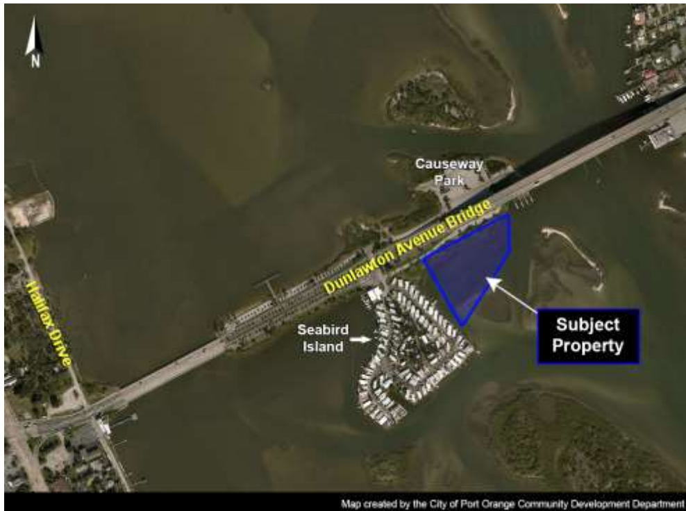
Location map of site located east of Seabird Island Mobile Home Park, south of the Dunlawton Avenue Bridge.