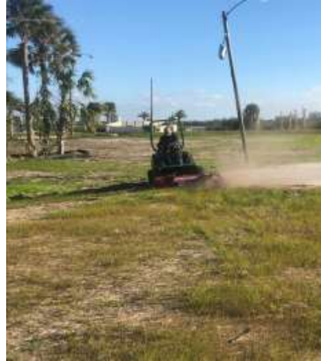
Photos of before and after mowing at Riverwalk Park