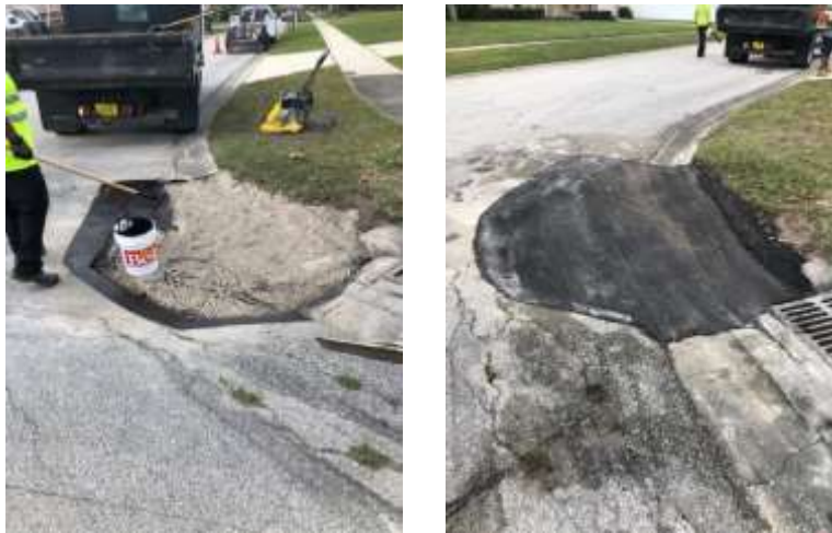
Before and after photos of asphalt patch