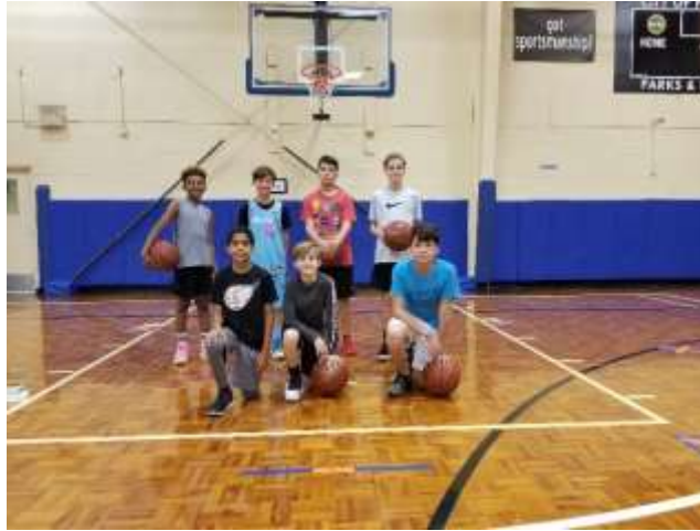
Photo of some of the kids who participated in the Jr. Skills NBA Challenge