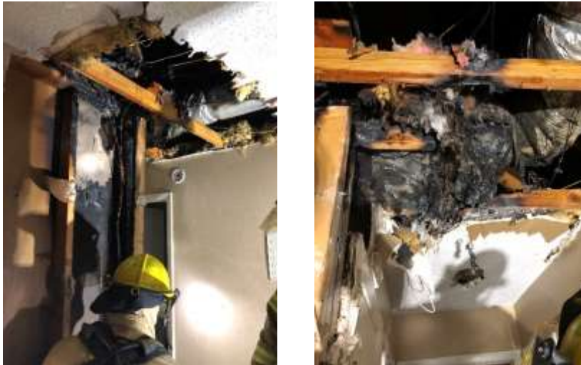
Photos from a house fire located on Willow Run Blvd.