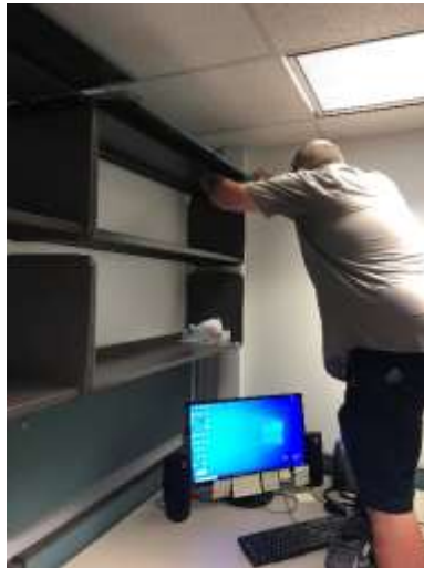
Photo of employee assembling shelves