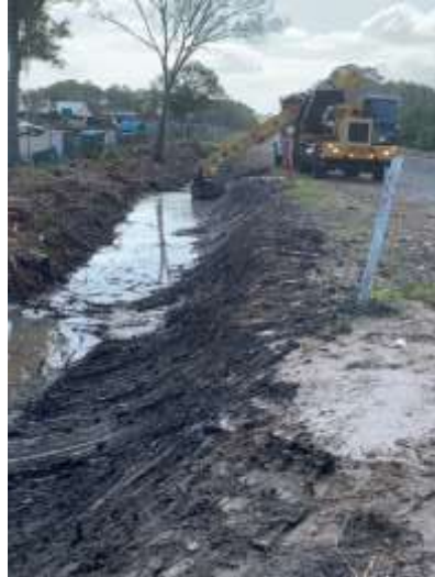
Photo of the Gradall