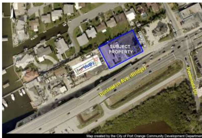
Location map of site at 59 Dunlawton Ave.