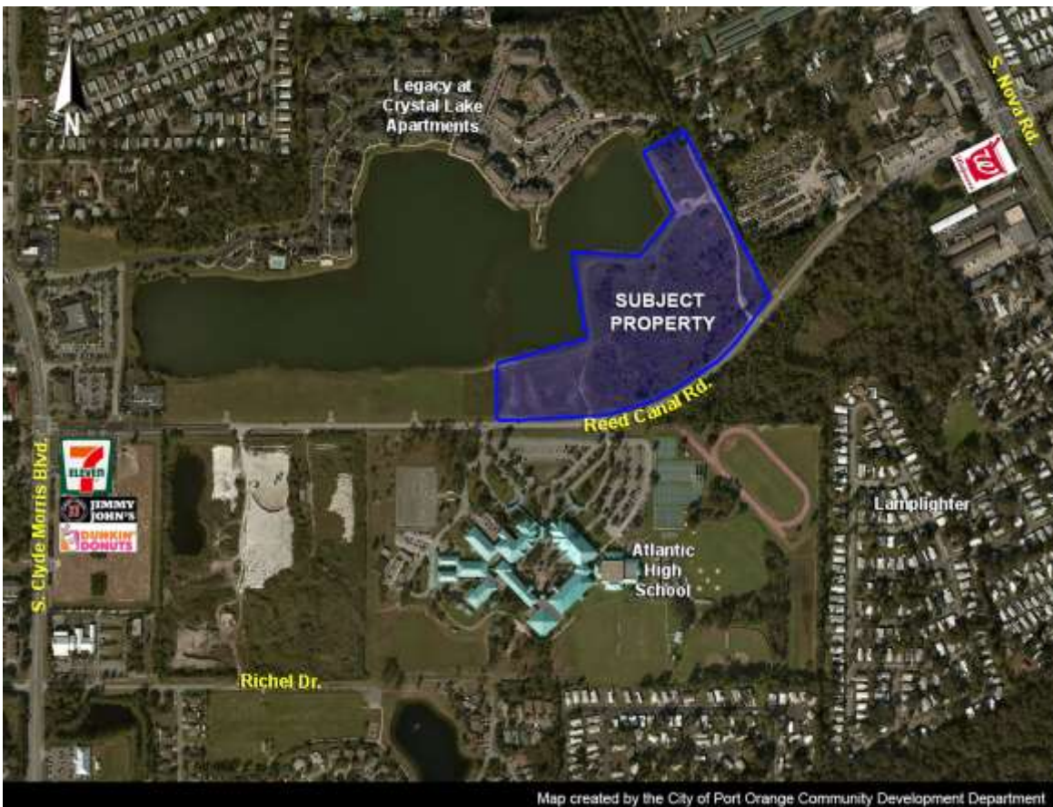
Location map of Eden Apartments site on the north side of Reed Canal Road, across from Atlantic High School.