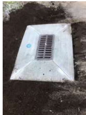
Before, during, and after repairs of a failing catch basin