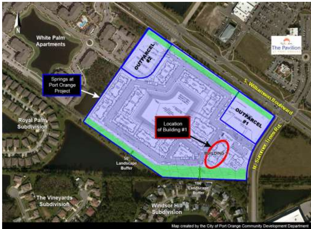
Location map of the Springs at Port Orange site located on the west side of Williamson Boulevard, north of Summer Trees Road. Map indicates location of Building #1 on the southwest corner of the site.