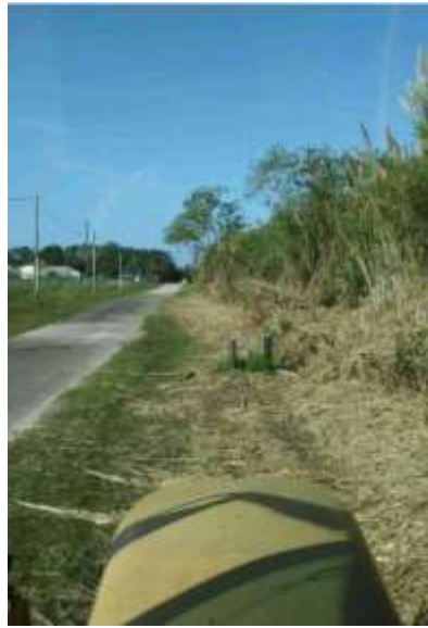
Before and after photos of Richel Drive push back