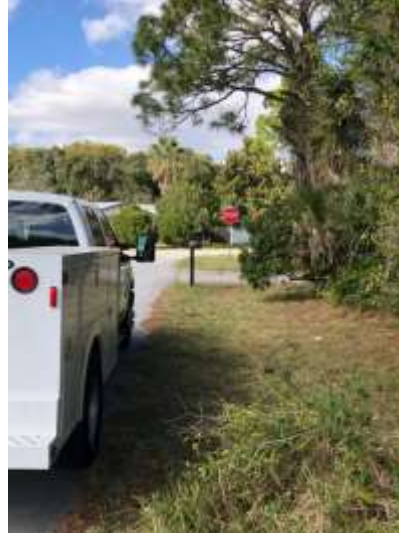
Before and after photos of trimming