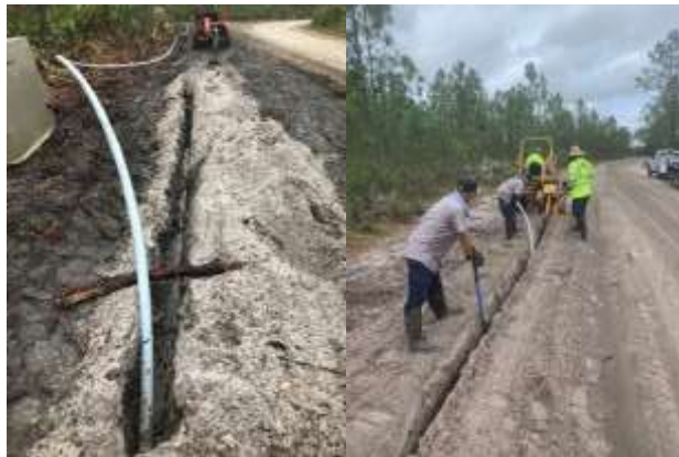
Photos of crew laying pipe