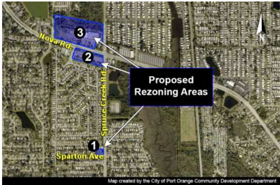
Location map indicating the 3 proposed rezoning areas along Spruce Creek Rd.

applications are scheduled for the January 23 rd Planning Commission meeting and the February 18 th City Council meeting.