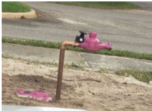
Photo of new reclaimed water meter installed of Acorn Storage on Williamson Blvd.