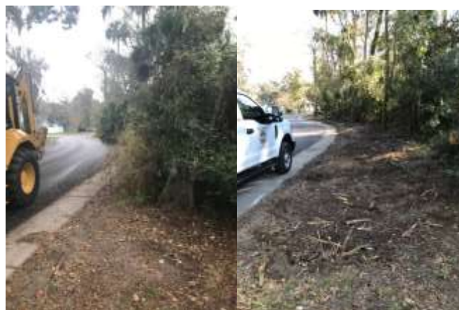
Before and After photos of Old Hammock Rd push back