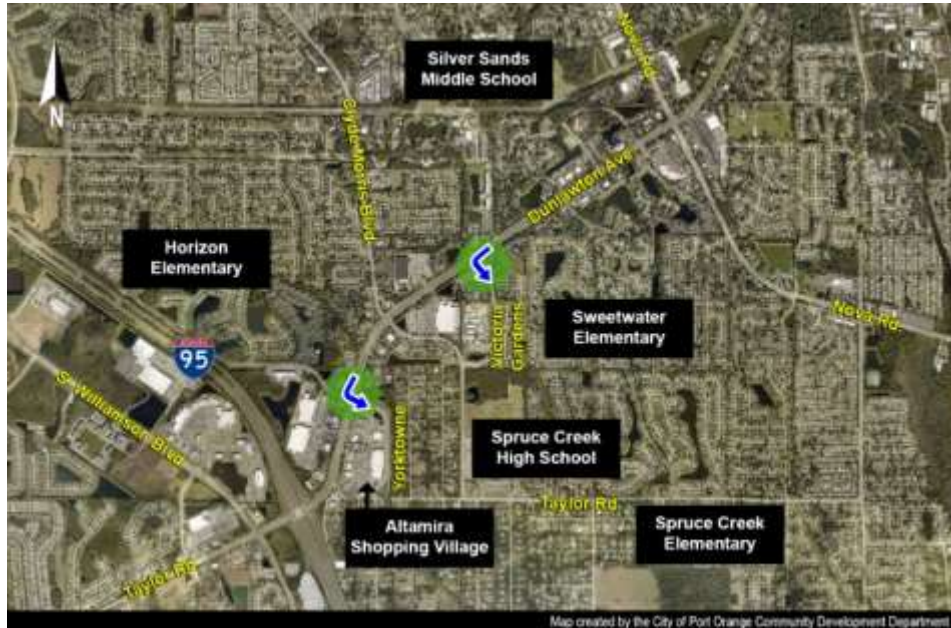
Location map indicating left-turn lane projects at Yorktowne Blvd. and Victoria Gardens Blvd.