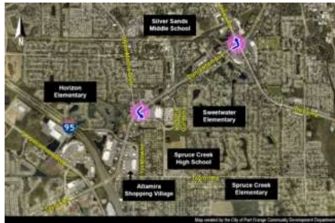
Location map indicating left-turn lane projects at Clyde Morris Blvd. and Nova Rd.