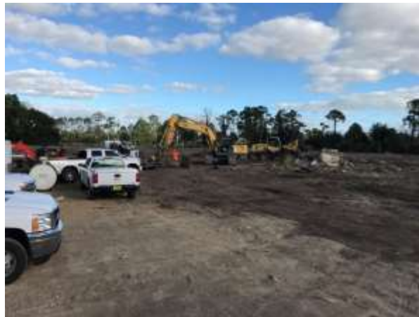
Photo of work being done at the Advent Health site located at the southeast corner of Taylor Road and Williamson Blvd.