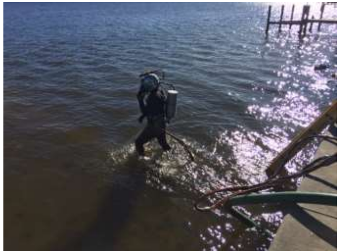
Photo of Leaking Pipe and Diver Entering Water to Assess the Leak