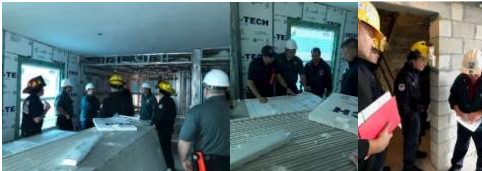
POFR Members at hydro test at Aruba Condo