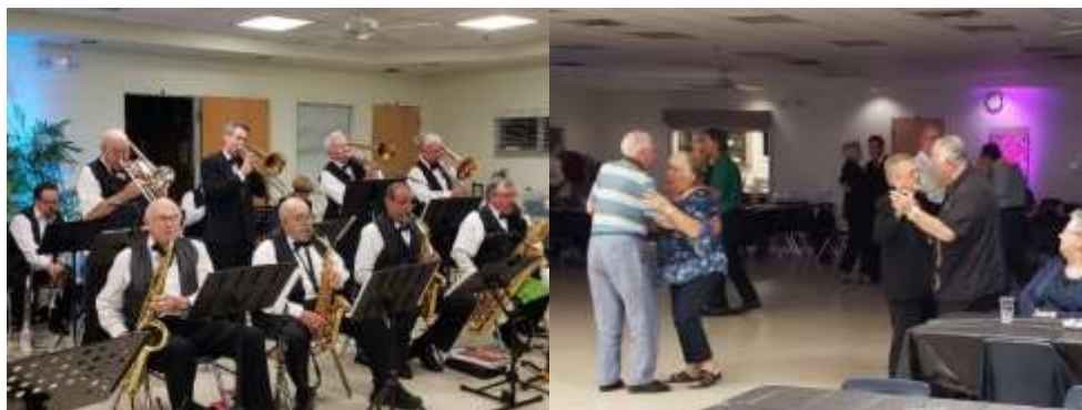
Photos of The Moonlighters band and dancers enjoying the music at the Adult Center