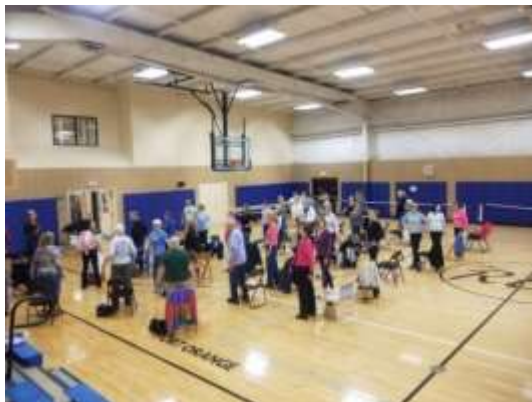
A picture of the chair yoga class at the Parks and Rec Gym