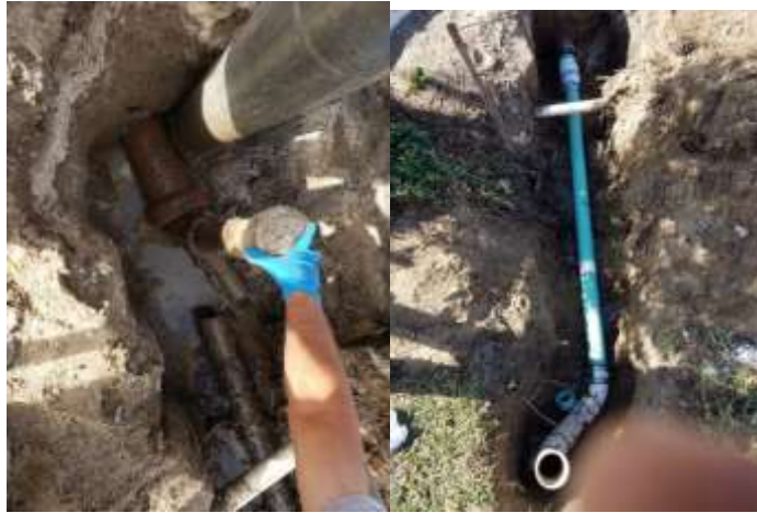
Photo of broken clay sewer line that was repaired with a PVC line