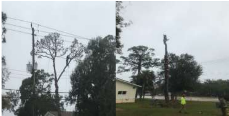
Photos of large dead pine tree being removed