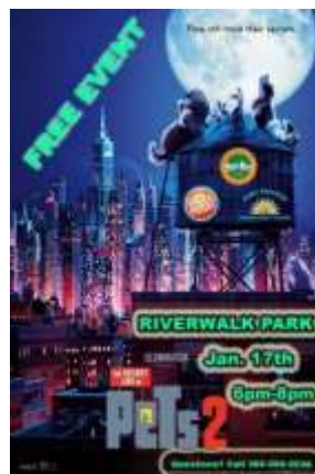
Flyer for the showing of Pets 2 at Riverwalk Park