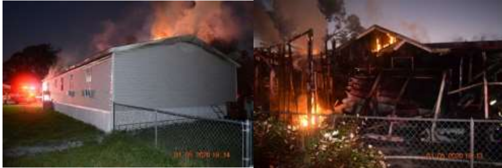
Structure fire on Tropic Drive