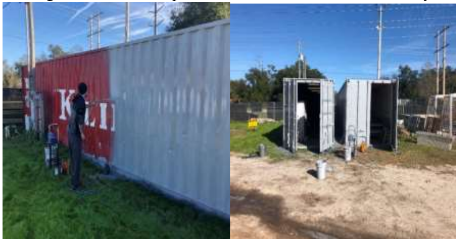
Photos of Parks employee painting and sealing storage containers in the maintenance yard