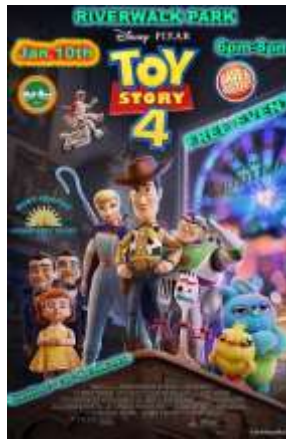
Flyer for the showing of Toy Story 4 at Riverwalk Park