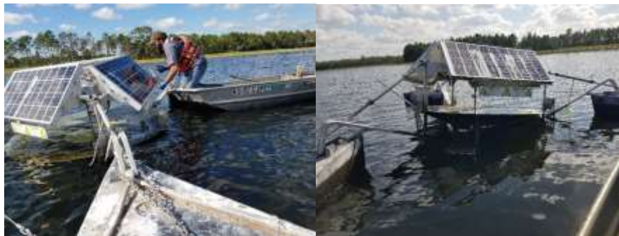
Photo of Technician installing a new battery in a SolarBee at the reclaim lakes