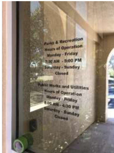
Photo of new DLH City Center Annex hours