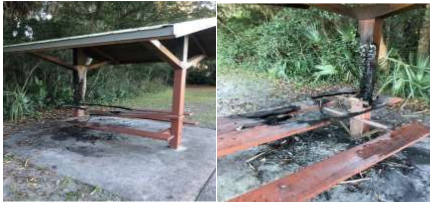
Photos of the pavilion after vandalized by fire at Buschman Park