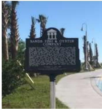
Photo of Historic sign