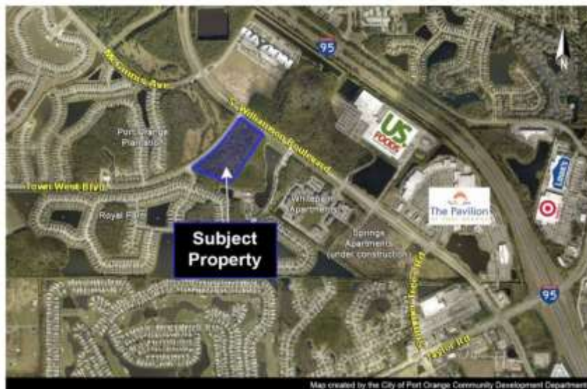
Location map of subject property located at the southwest corner of Town West Boulevard and Williamson Boulevard.

Staff initially met with the developer in October about the proposed age-restricted independent senior living development that would include an all-inclusive resort-style community with live-in managers, a 24/7 medical alert system and concierge service, gourmet chefs, housekeepers, maintenance staff, a full-time lifestyle director, etc. The subject property is located within the Workplace District in the Westside Planned Community (PC-A zoning) and the zoning on the subject property currently allows for commercial uses (some example uses include convenience stores with or without fuel operations; game/recreation facilities; hotel/motel; and restaurants with or without drive-throughs). The proposed senior congregate living facility use would be a lower intensity use and generate less vehicular trips than a majority of the commercial uses already allowed by the current zoning on the subject property. In order to develop the property as a senior congregate living facility, the developer will need to submit a Land Development Code (LDC) amendment to add congregate living facility as a permitted use in the PC-A Workplace District.