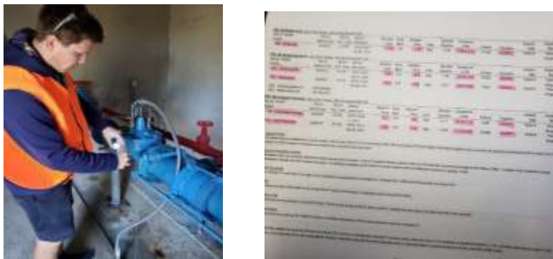
Photo of Justin collecting a drinking water sample and passing results for proficiency testing of chlorides, nutrients, and colilert-18