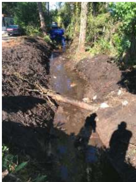
Photo of the Kaiser clearing out the Tanglewood ditch