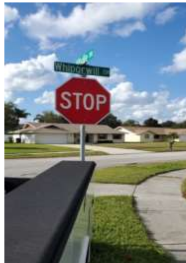
Before and after photos of a repaired sign