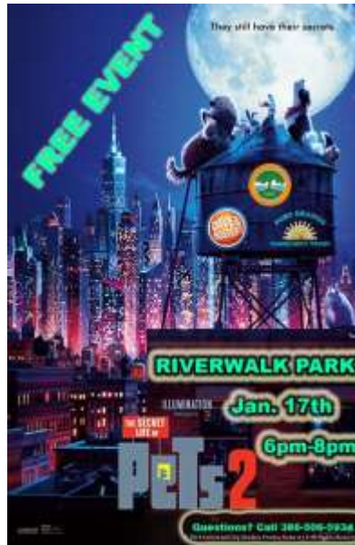
Flyer for the showing of Pets 2 at Riverwalk Park