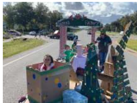
Photos of some of the spectacular Holiday Parade Floats