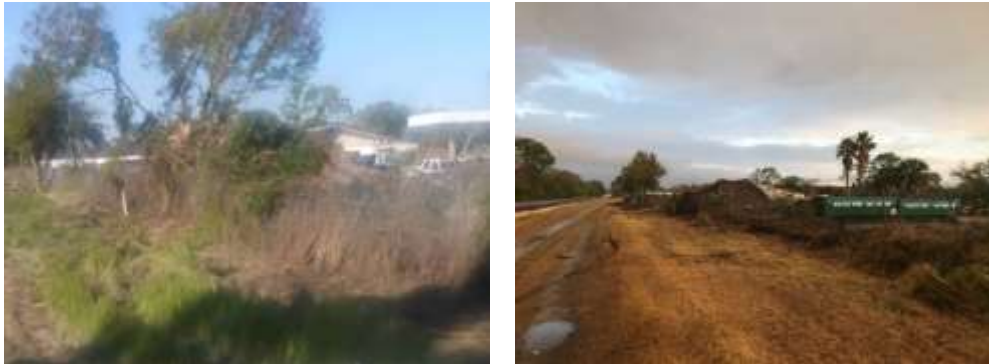
Before and after photos of fence line clearing