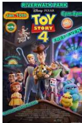
Flyer for the showing of Toy Story 4 at Riverwalk Park