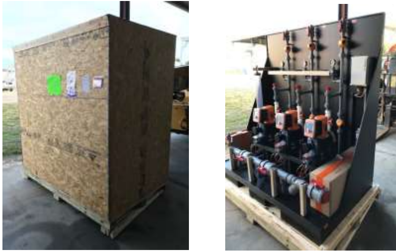
Photos of the arrival of the new pump skid for the chlorine feed trial at the Water