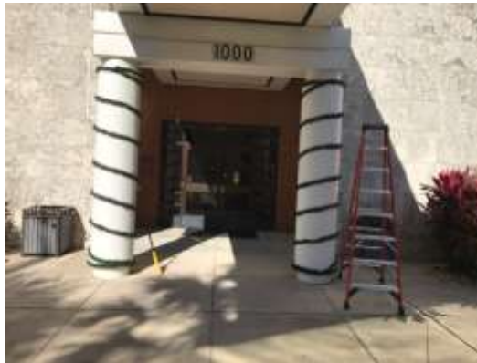
Photo of Holiday decorations at City Hall