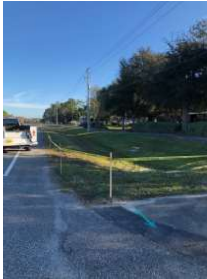
Photo of staked off right of way along Dunlawton Ave.