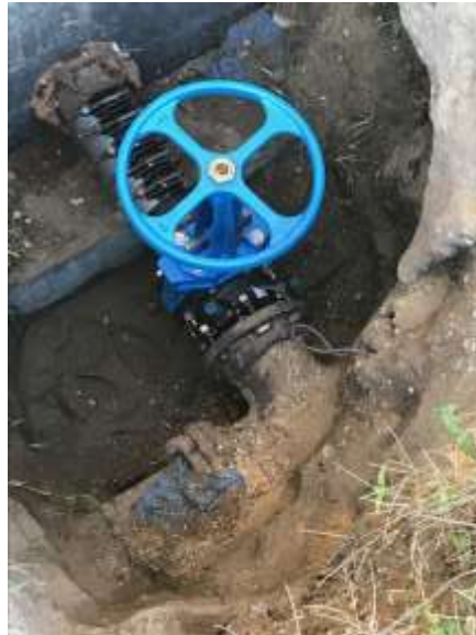
Photo of Chief Plant Mechanic Brent Reed installing the new valve on the treatment structure at the WRF