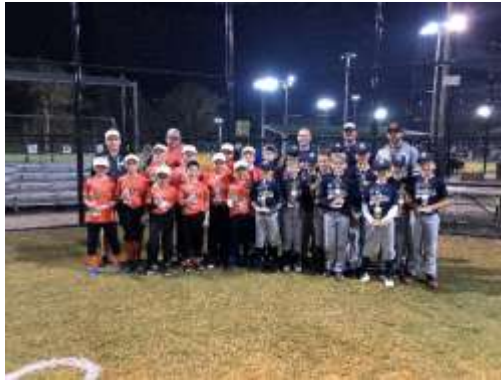
Photo from the 10U Championship Baseball Game