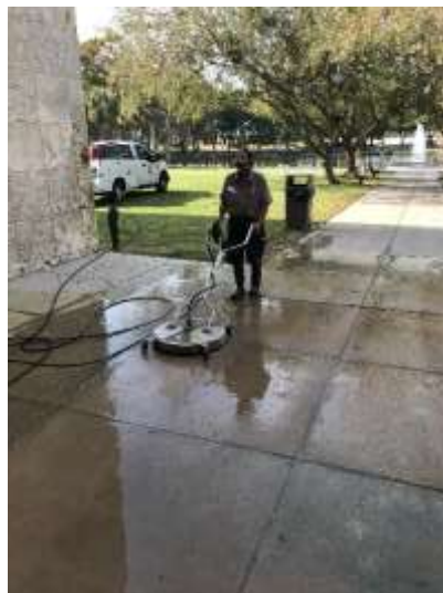
Photo of employee pressure washing