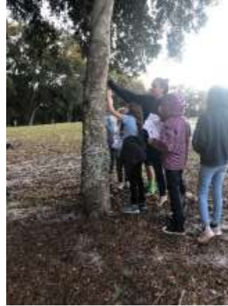
Photos of Rec Rangers sorting different leaves & counting tree rings