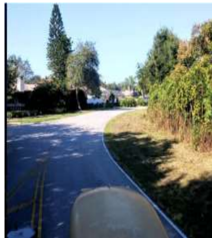
Before and after photos of right of way cut back