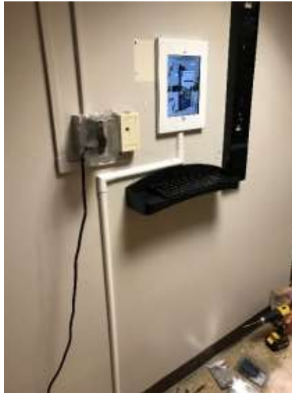
Photo of I-Pad station