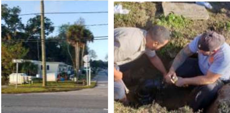
Photo of city staff installing the new master meter at Lamplighter MHP