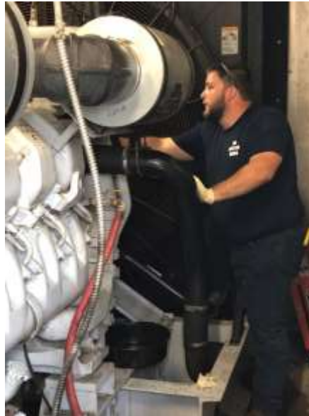
Photo of technician repairing the WTP generator