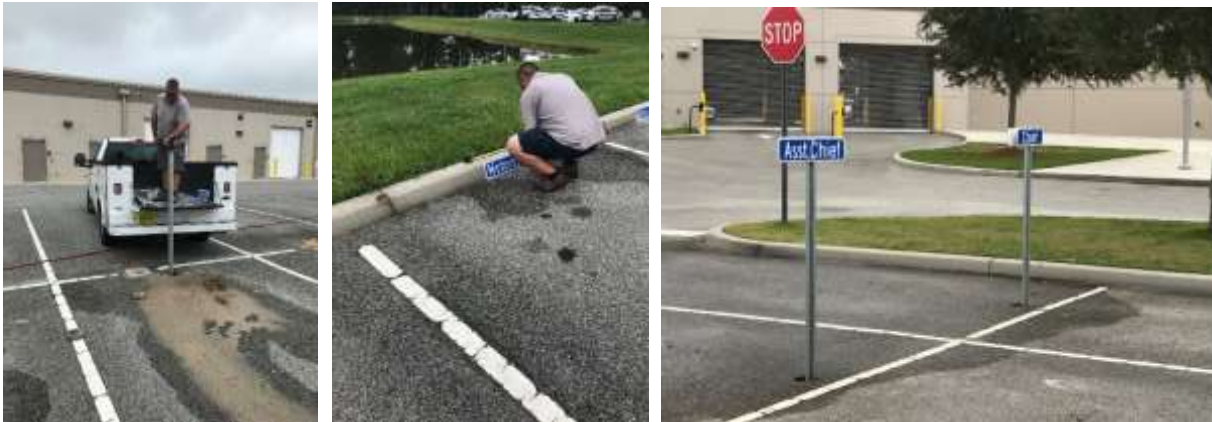
Photos of newly installed signs