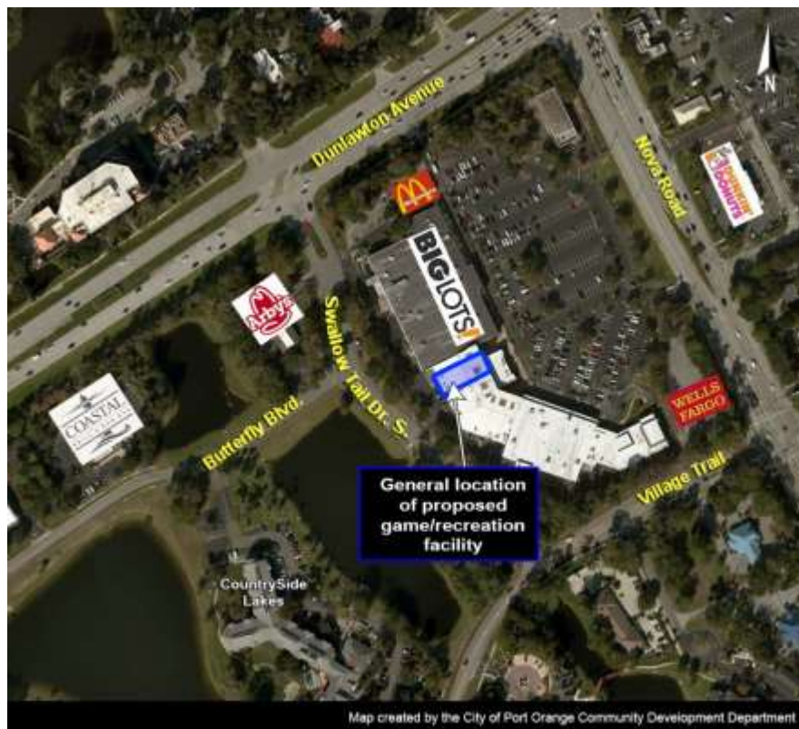
Location map of proposed game/recreation facility located at 3830 S. Nova Road