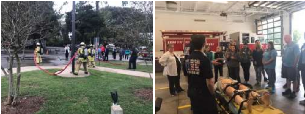
Photos of POFD staff demonstrating hose line deployment and CPR demonstration with Port Orange/South Daytona Chamber of Commerce Leadership.