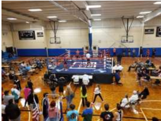
Photo of the PAL Boxing Ring and Spectators