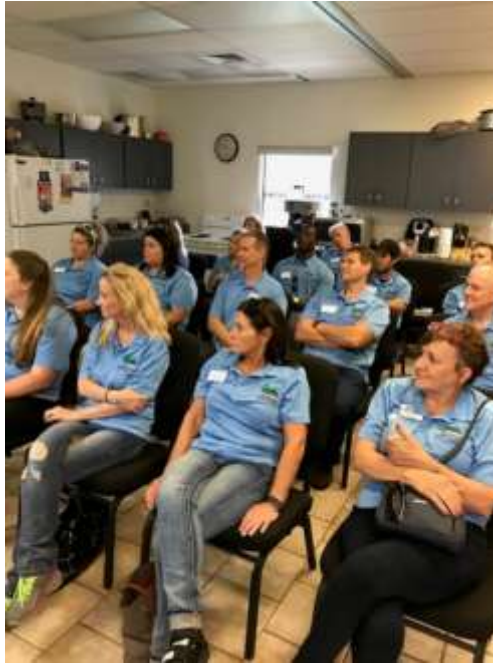
Photo of leadership group learning about “bugs” at the WRF during their tour