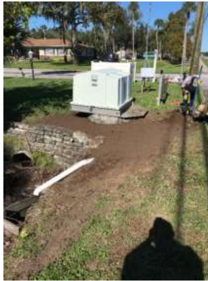
Photos of installed pipe