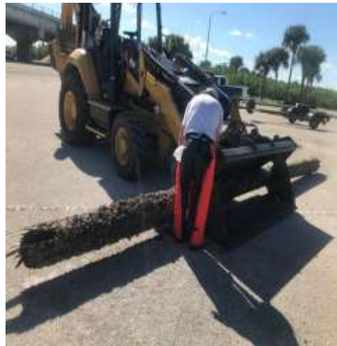
Photos of the Coast Guard and Parks Crew removing dangerous piling