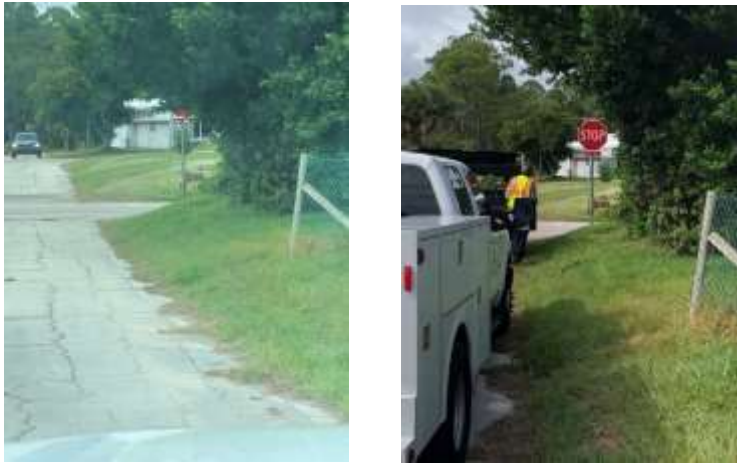
Before and after photos of sign obstruction