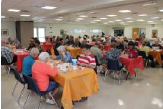
Photo of the many bingo participants