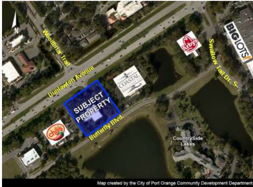
Location map of proposed medical marijuana dispensary site at 1090 Dunlawton Avenue