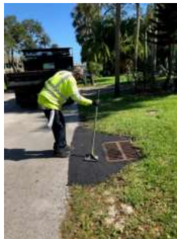
After photos of completed asphalt work