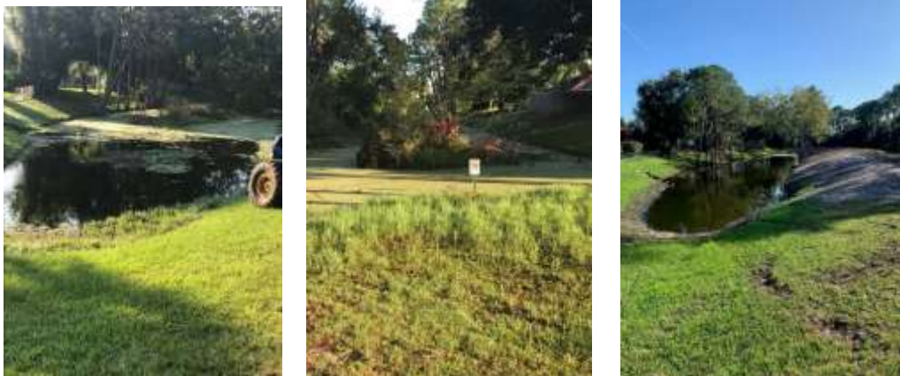
Before and after photos of Harm's Way pond dredging