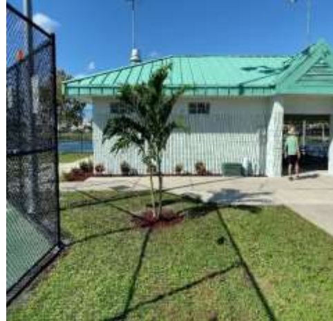
Photos of the beautiful renovations taking place at Airport Road Park