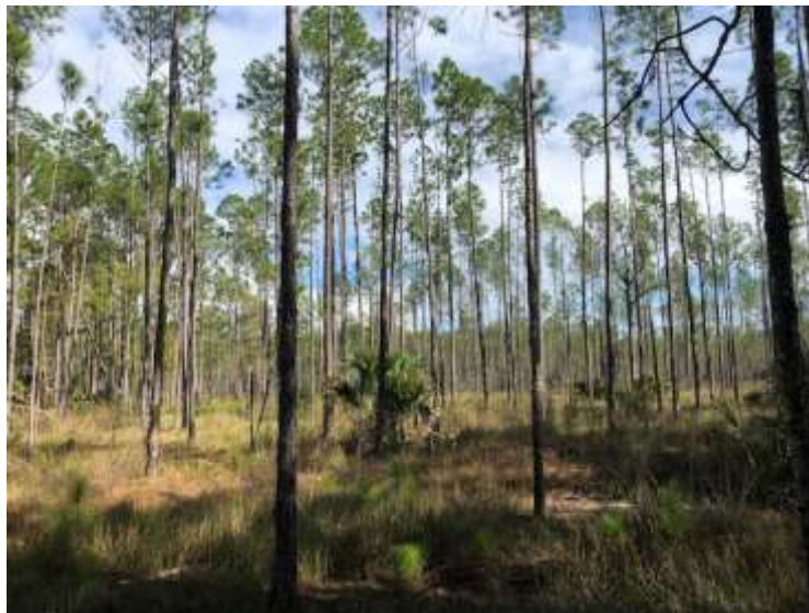
Photo of city forest off Shunz Rd., one year after thinning pine trees