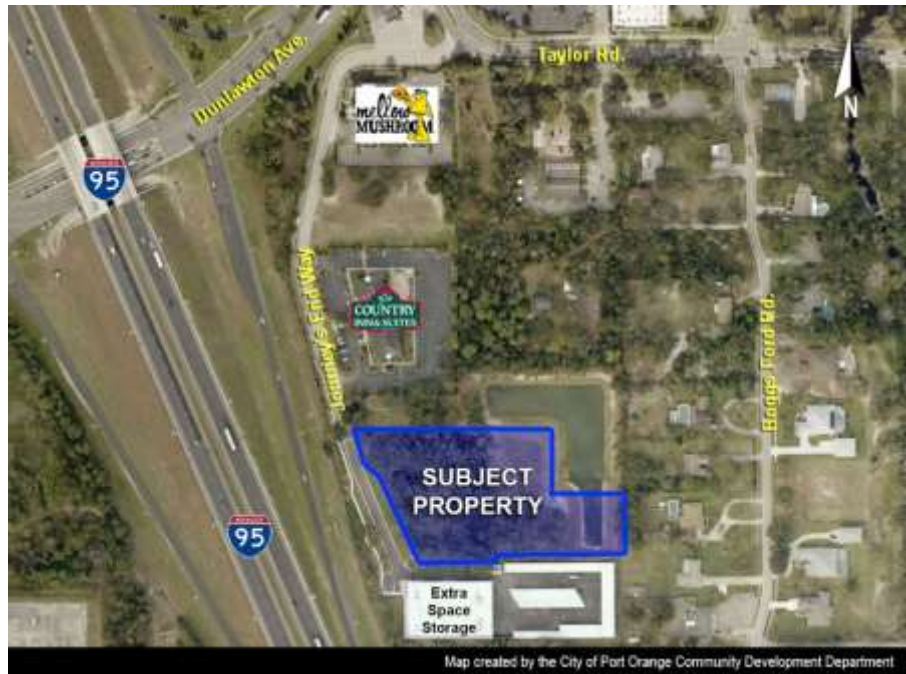
Location map of proposed hotel site on the vacant commercial lot between Extra Space Storage and Country Inn & Suites