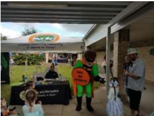
Photo of REC Man passing out candy