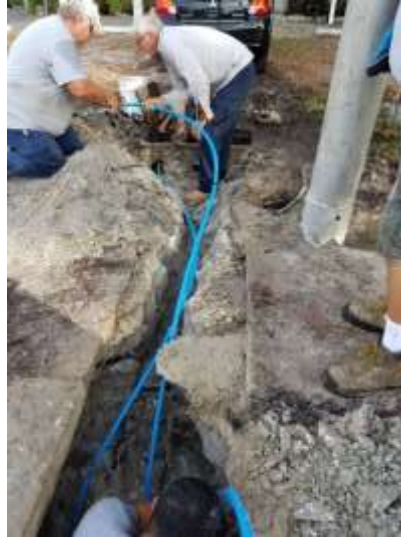
Photo of Field Ops staff replacing service lines on Charles Street