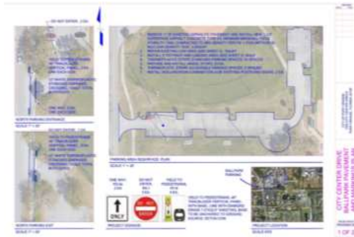
Photo of parking lot resurfacing drawing