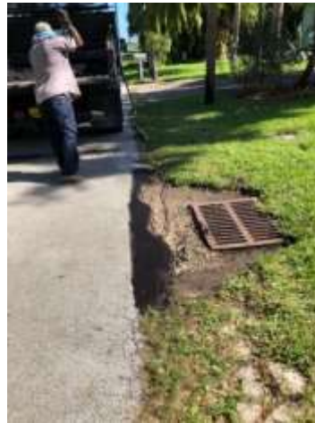
Before photos of asphalt work