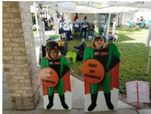
Photo of kids posing with REC Man cut-outs