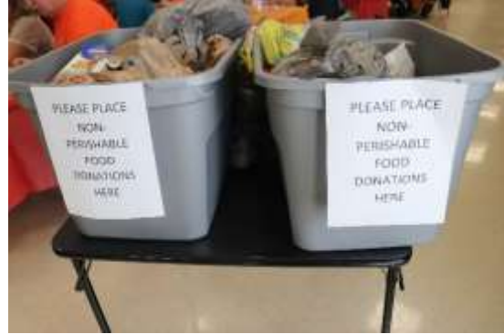
Photo of two full Non-Perishable Food Bins