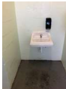
Photo of the new replacement sink