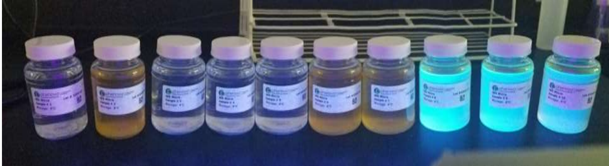
Photo of Colilert proficiency tests in the Central Lab