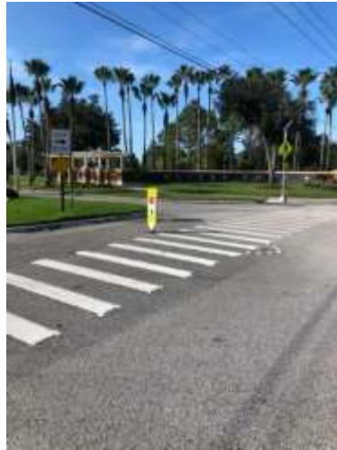
Photos of signs installed on Waters Edge Boulevard