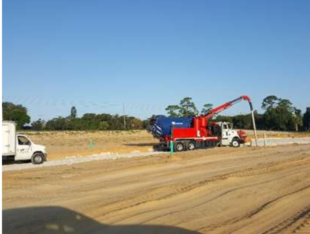
Photo of Vac truck cleaning sewer lines in King's Landing subdivision