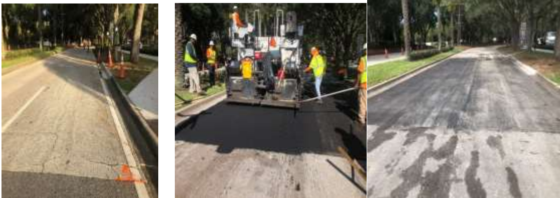
Before, During, and After road repairs were made to City Center Parkway