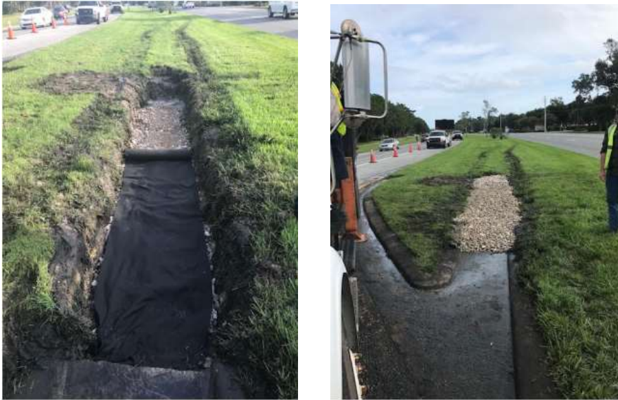
Photos of swale rehab in a Dunlawton Avenue median