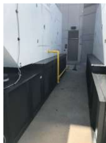
Before and after photo of painted gas line