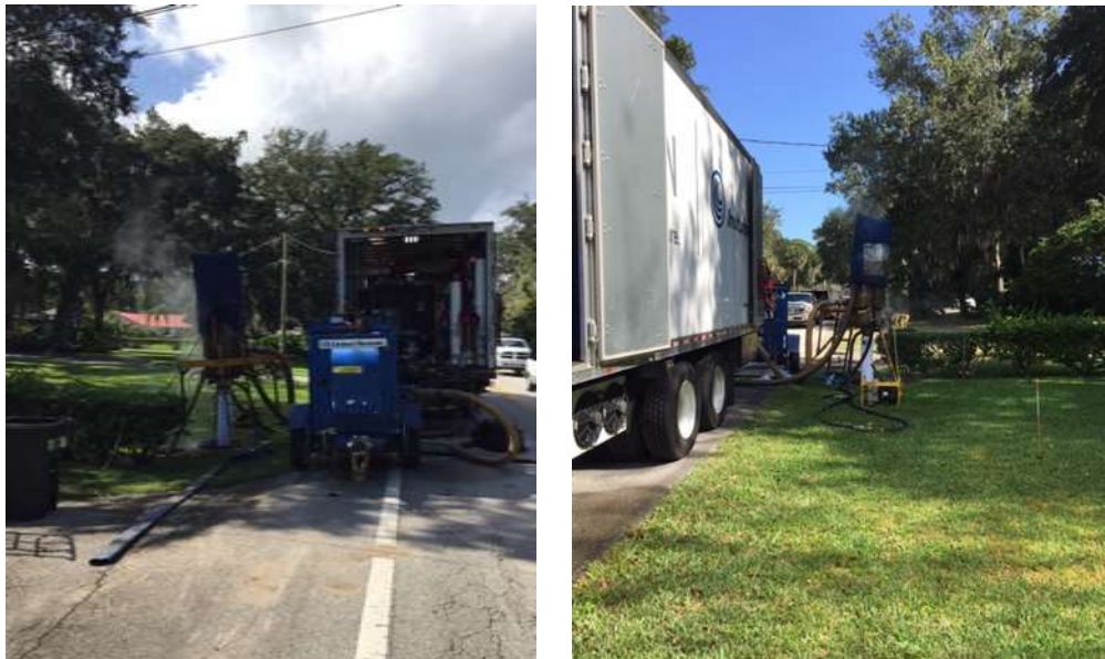
Photo of filling the liner with hot water to expand it into place and triggering the resin to start the hardening process as it later cools.