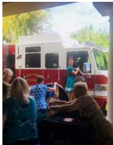
POFR Members at the lunch grab-and-go