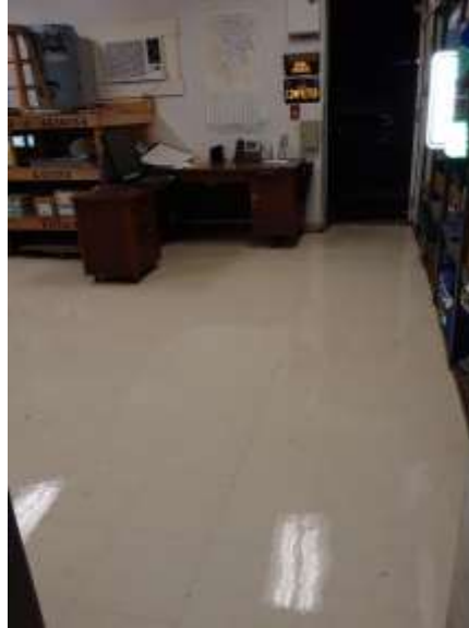
Before and after photos of stripped and waxed floors