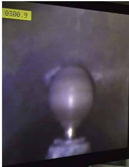
Photo of cutting tool cutting the opening in the liner for a service lateral after it cures by using a remote video camera to control it.