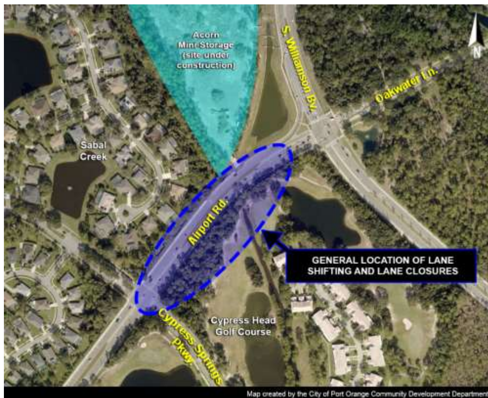
Map indicating general location of lane shifting and lane closures on Airport Road