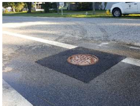
Photo of demonstration of a paving patch material for Field Ops