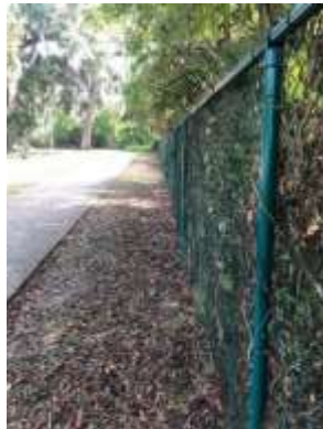
Picture of the cleaned-up fence-line at Buschman Park