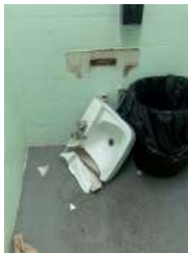
Photo of the broken sink