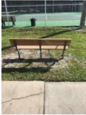
Picture of a new park bench