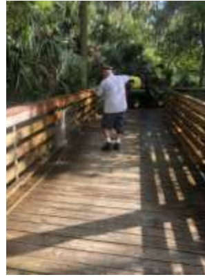
Picture of the deck being pressure washed