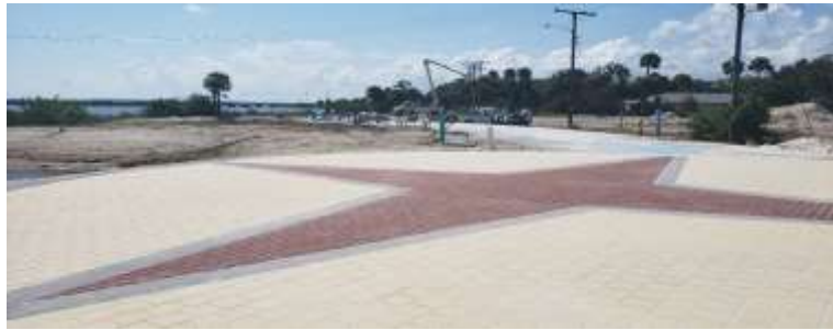
Photo of public trail with decorative pavers installed