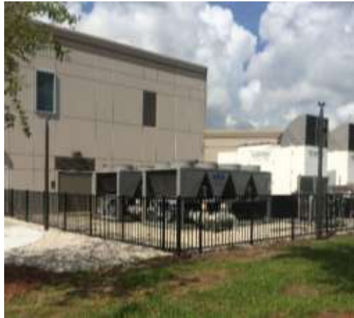
Photo of newly installed fence at Police Department