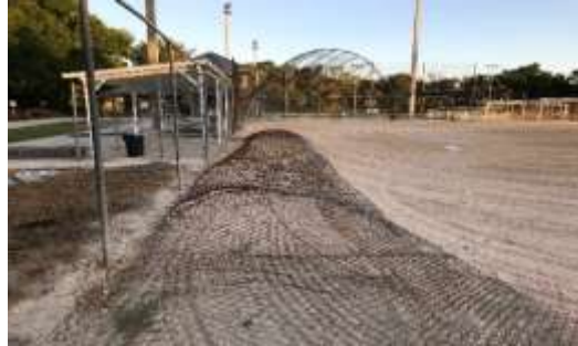
Photos of Spruce Creek Road Park's back stop fencing being removed