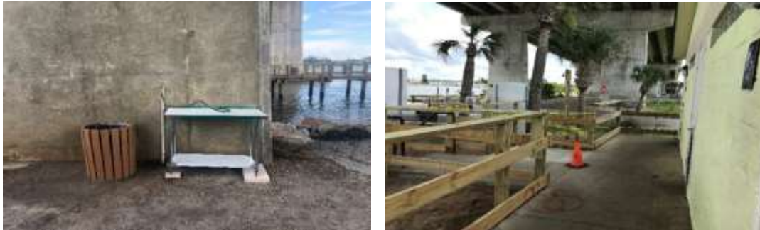
Photos of fishing table and shower at Causeway Park