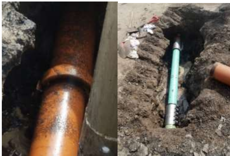
Photo of clay sewer line repair performed on Farmbrook Rd.