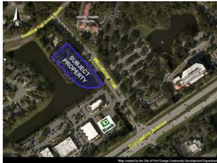
Location map of Elite Plaza located at 3821 Woodbriar Trail.