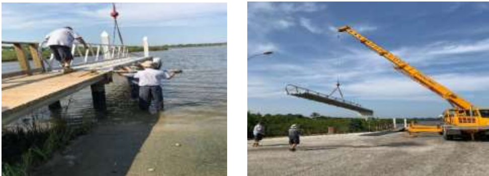
Photos of crew removing and replacing Gangways at Causeway Park