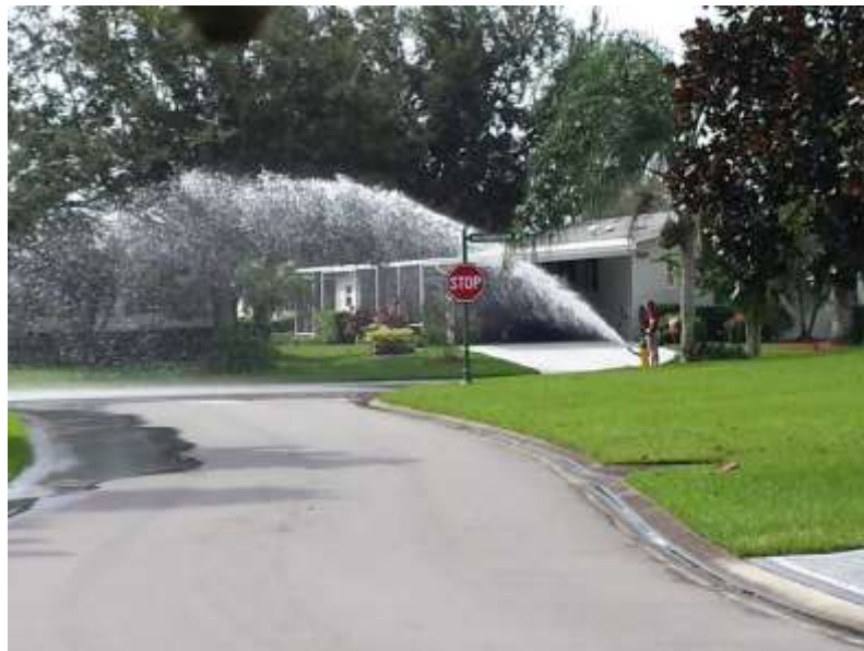
Photo of Lab Analyst flushing a hydrant in Crane Lakes to ensure good water quality