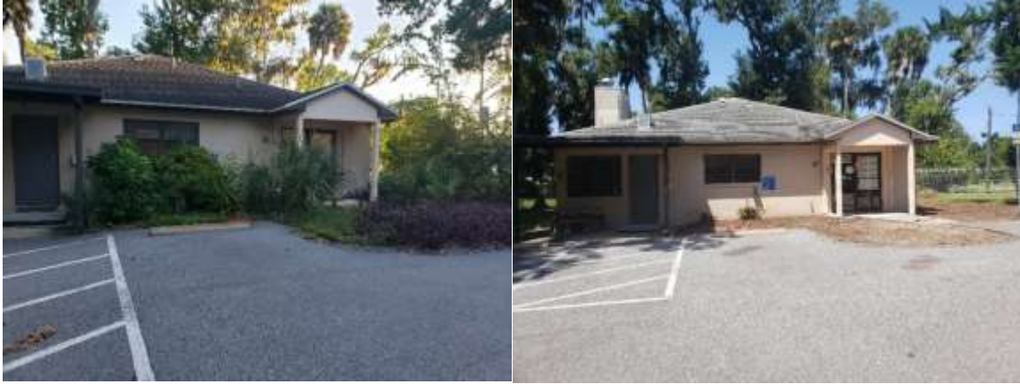
Photo of the laboratory exterior before and after clean-up