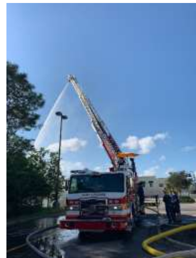
POFR members aerial operations training