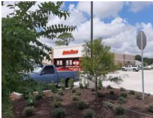
Photo of AutoZone (front and side of building) and parking lot.