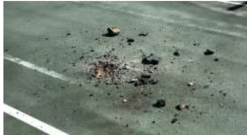
Photos of the resurfacing project starting at the Airport Road Park