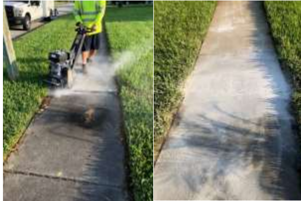
Before and after photos of sidewalk grinding