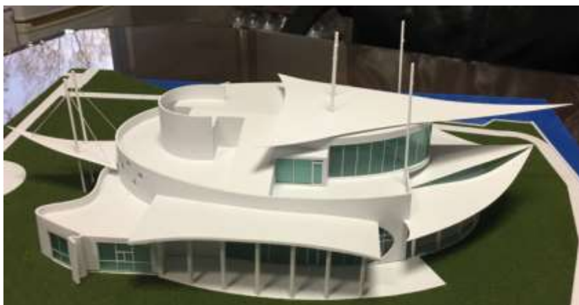
Photo model of the proposed restaurant on the “point” at the Riverwalk project.