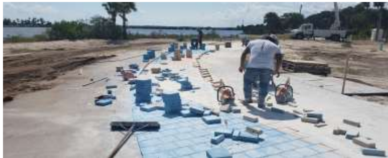
Photo of public trail with decorative pavers being installed