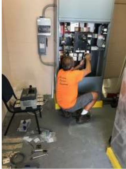
Photo of new primary electrical breaker being installed by Economy Electric