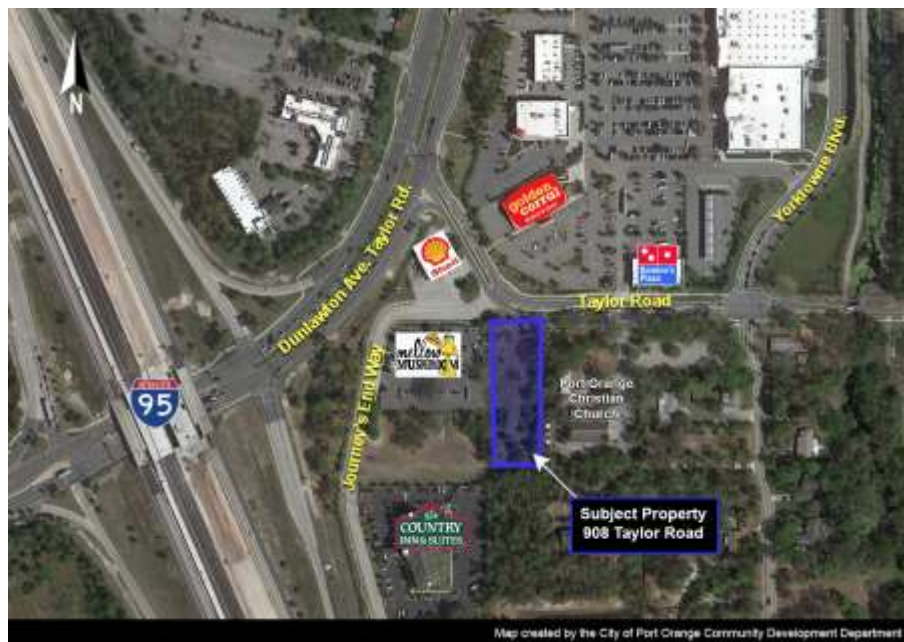
Location map of proposed office building and design center for Paytas Homes located at 908 Taylor Road.