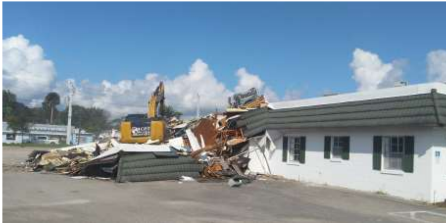
Photo of demolition of the Cardwell Funeral Home