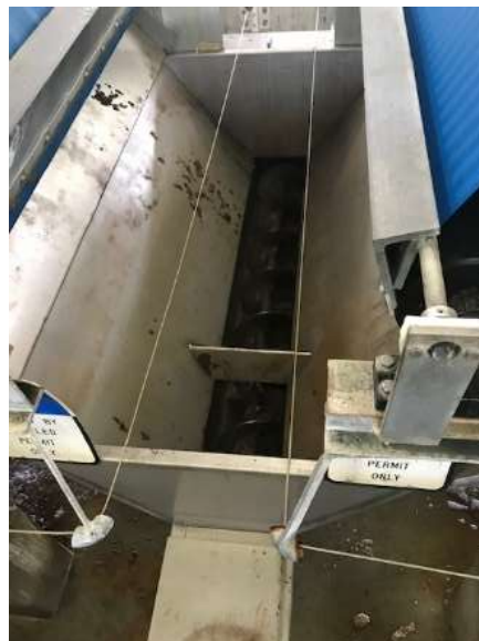
Photo of conveyor with new bearings installed by the Maintenance staff