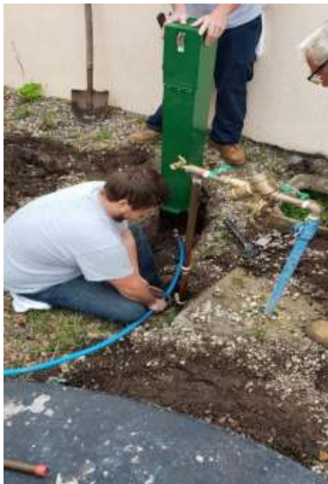
Photo of Crews installing a new water sample station