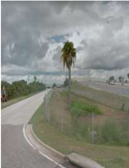
Drainage Area under Dunlawton Bridge Before