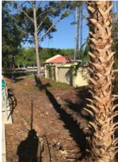
DLH Gas Pump Area After