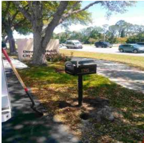
Photo of New Mailbox installed at DLH City Center Annex