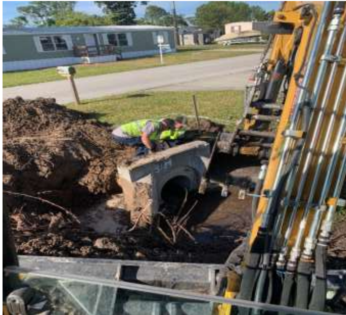
Photo of Staff working on the Turton and Barhydt Drainage Project