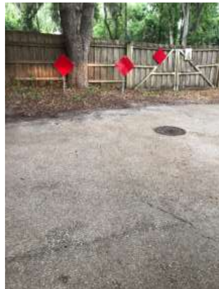
Oak Forest Circle After Cleaning