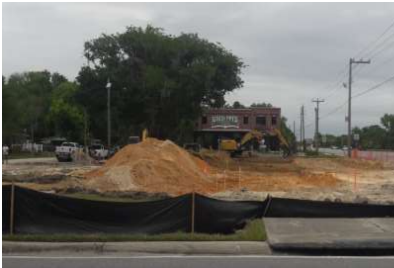
Photo of construction at the Giuseppe’s site.