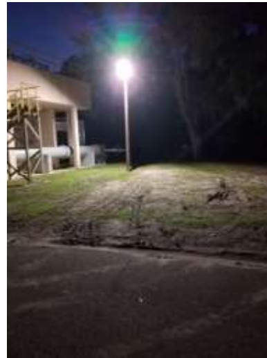
Photo of new light fixture installed