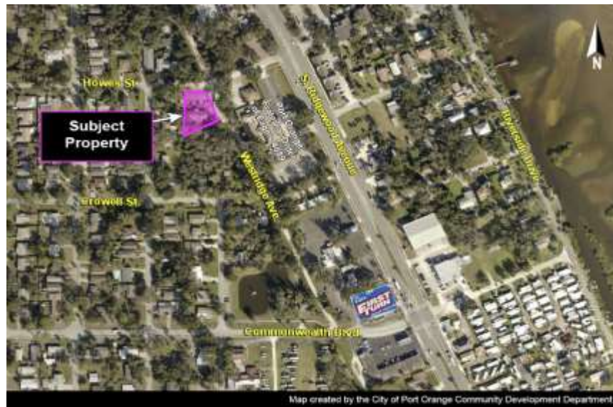
Location map of 119 Howes Street