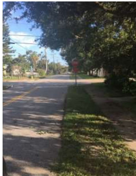
Orange Ave. After Trimming