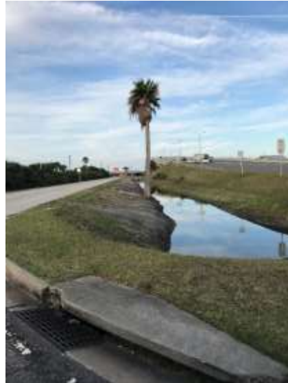
Drainage Area under Dunlawton Bridge After