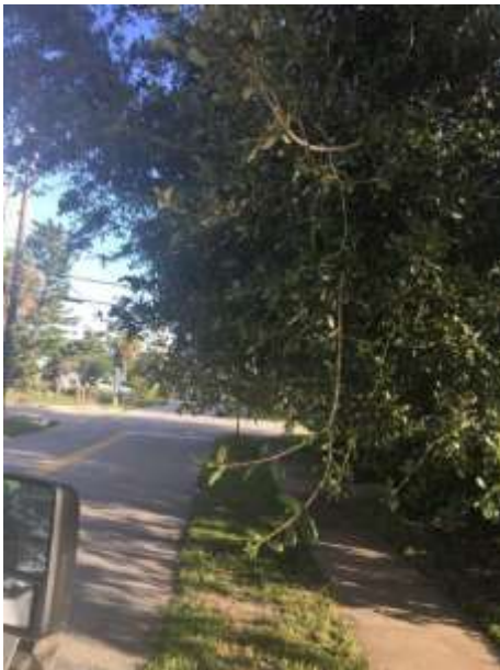
Orange Ave. Before Trimming