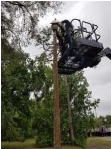
Photo of old light fixture being removed