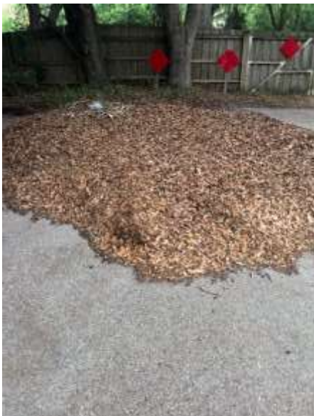
Oak Forest Circle Before Cleaning