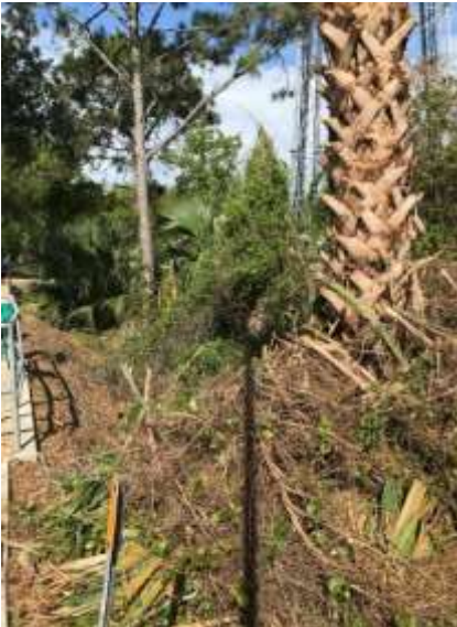
DLH Gas Pump Area Before