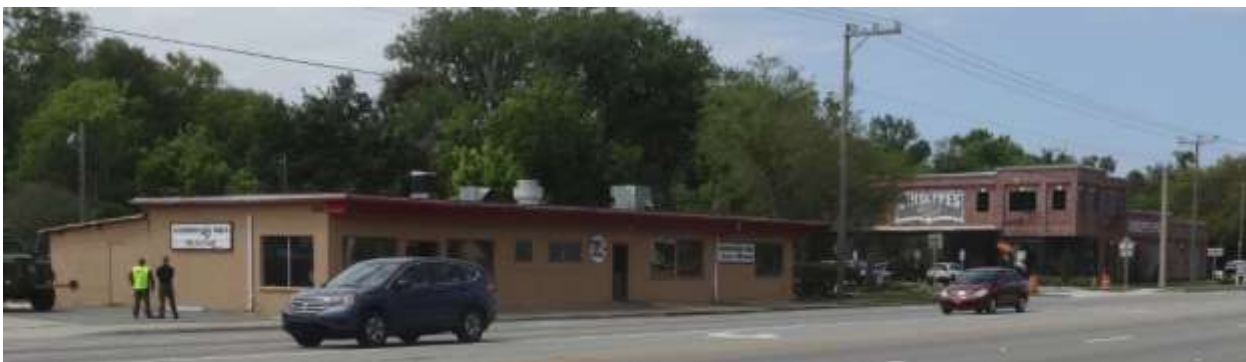
Photo of the old Giuseppe's Pizza building with the newly finished Giuseppe's Pizza building in the background