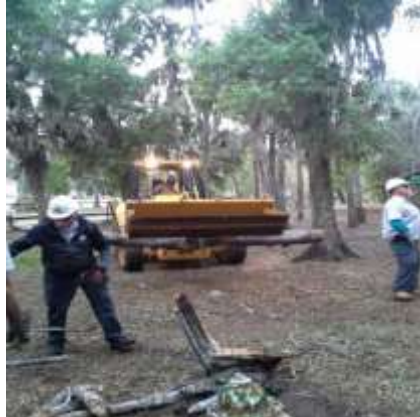
A photo of the dead tree was removed