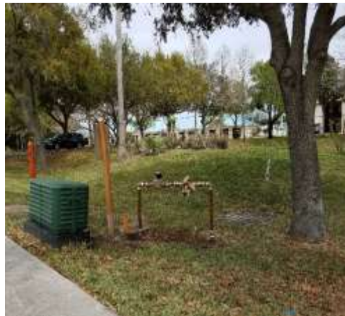
Photo of Finished Installation of Williamson Lift Station Water Meter