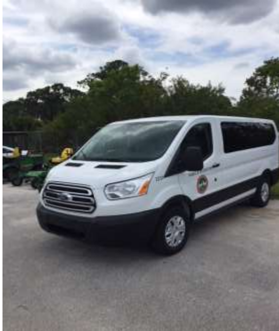
Photo of a New 2019 Ford Transit for Parks & Recreation