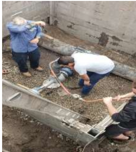
Photo of A New Potable Water Tap Installed on Williamson Blvd.