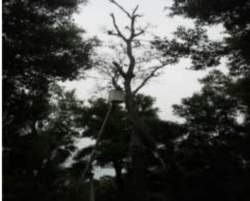
A photo of a dead tree before removal