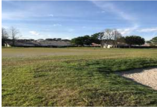
A photo of the Golf Course Greens