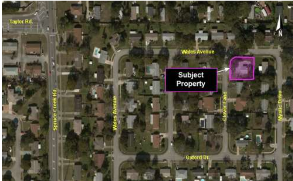
Location map for variance application located at 5807 Clover Lane