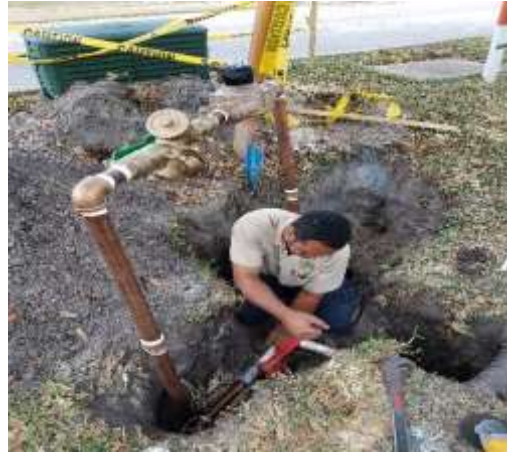
Photo of Crew Replacing Williamson Lift Station Water Meter