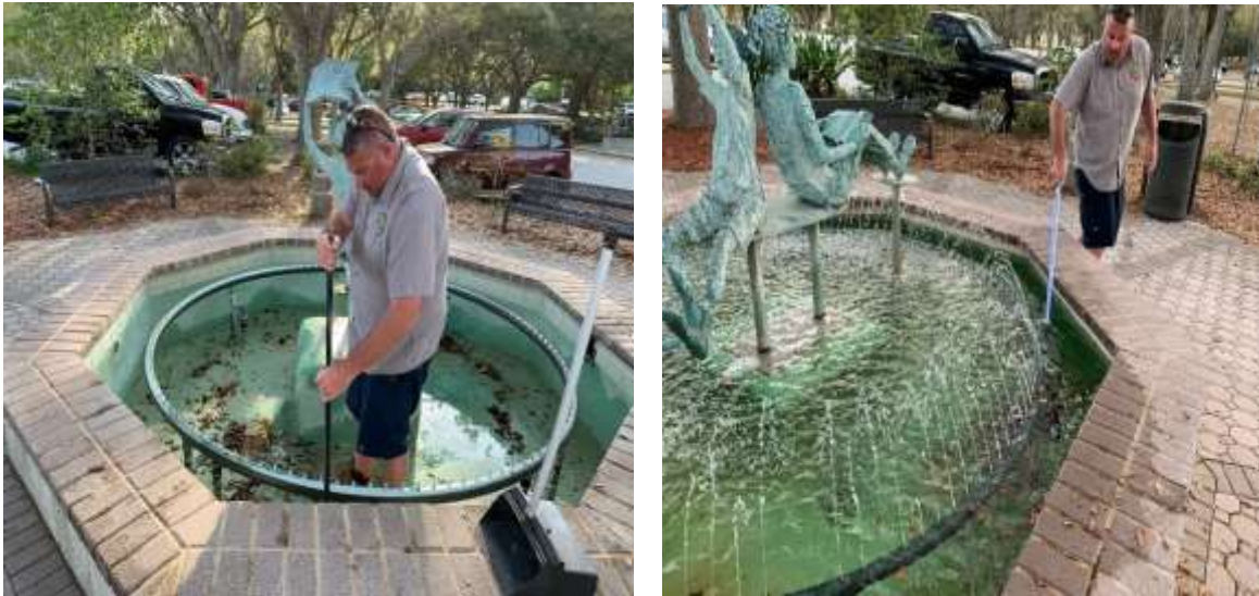
Photos of the Cleaning Activities on the Library Fountain