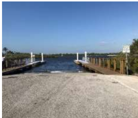
A photo of the Causeway Boat Ramp