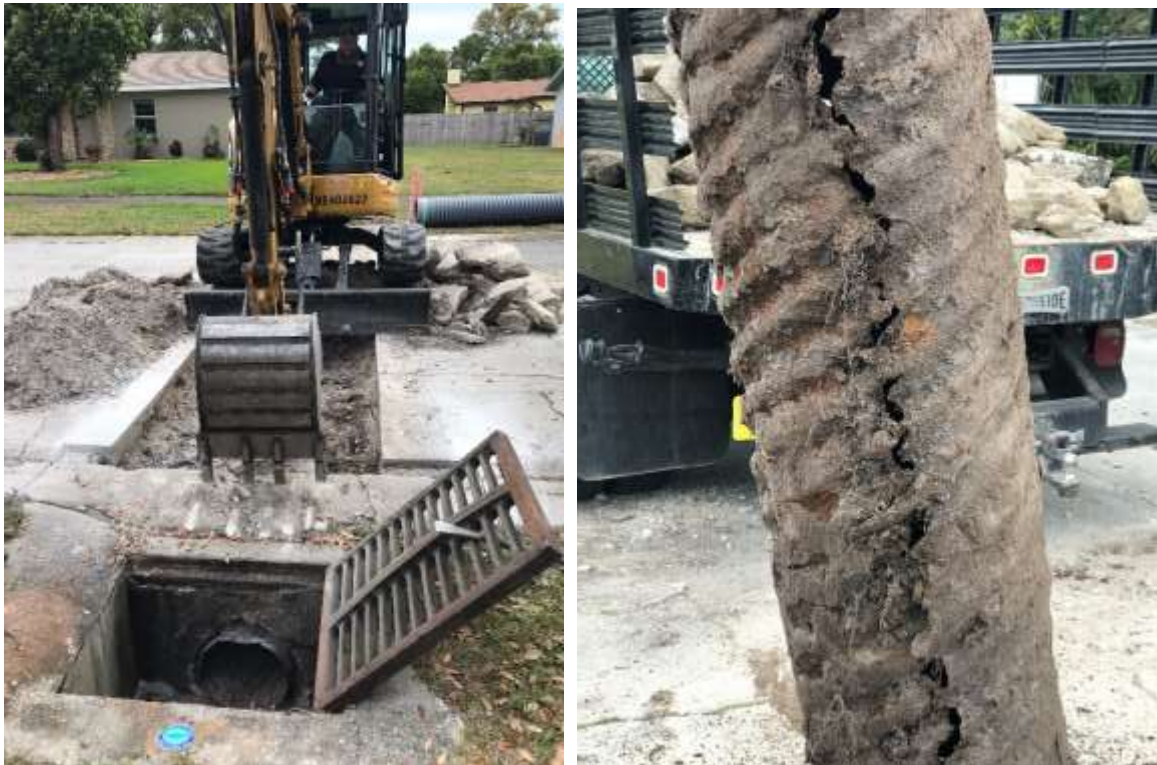
Photos of 5809 Wales Ave Metal Pipe Replacement Project