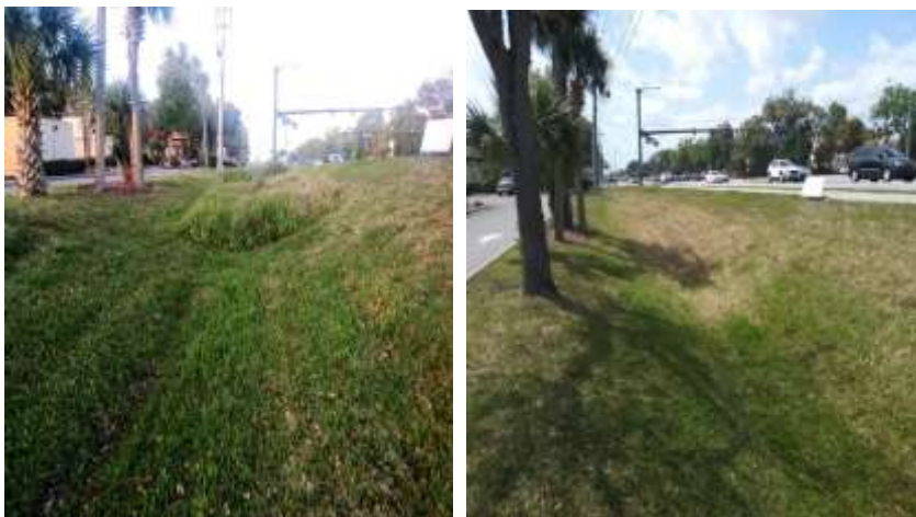
Photos of a Drainage Swale on Dunlawton Ave. Cleaned