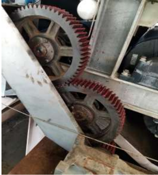
Photo of Maintenance Staff installed new gears at the Dewatering Belt press #4