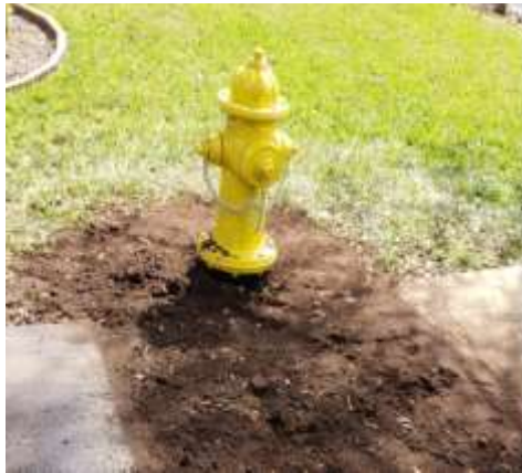
Photo of Fire Hydrant Replaced in Riverwood Subdivision