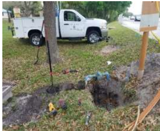
Photo of Williamson Lift Station Water Meter before Replacement