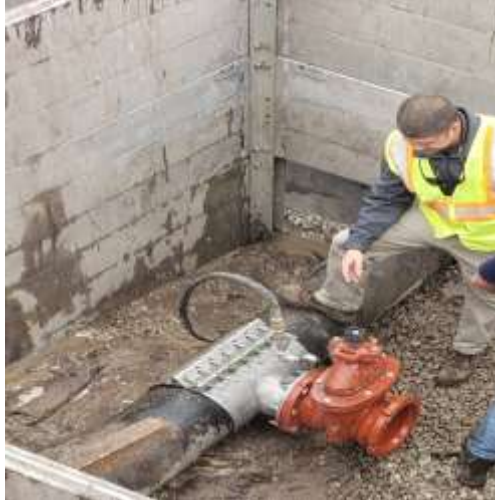
Photo of A New Potable Water Tap Installed on Williamson Blvd.