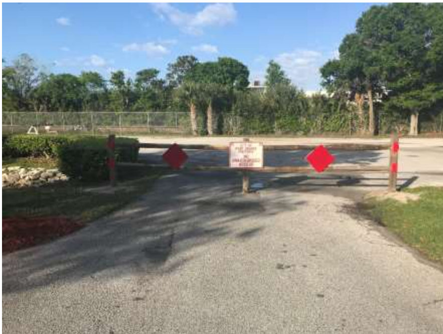
Photo of a New Split Rail Fence at Public Works