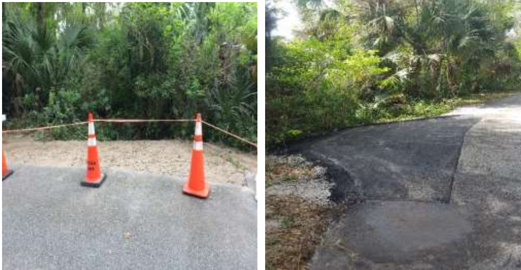
Photos of a new spillway on 117 Magnolia Loop was installed to reduce erosion