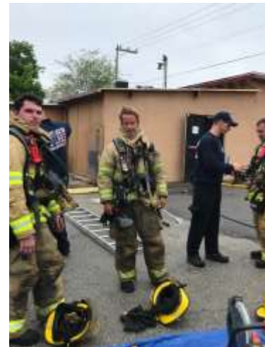
Photos of the line crews participating in a simulated fire training at the old Giuseppe's Steel City Pizzeria