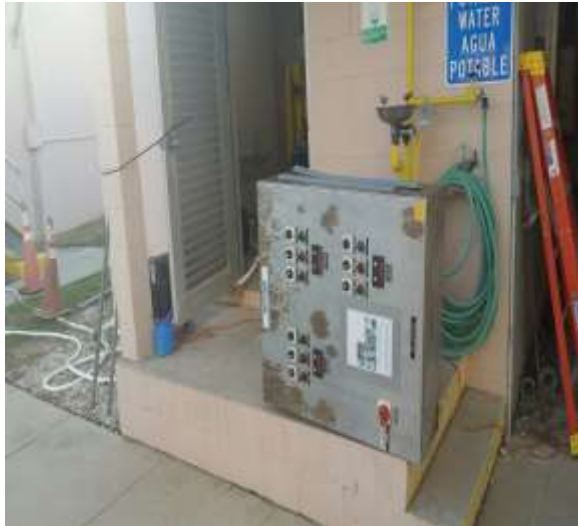
The Old Chlorine Feed Panel is Removed and Will Be Replaced