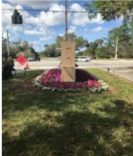
Photo of City Center Entrance After Plantings