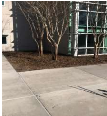
Photo of the Police Dept. Entrance After