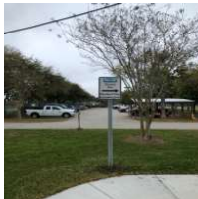
New Directional Signs at Public Works