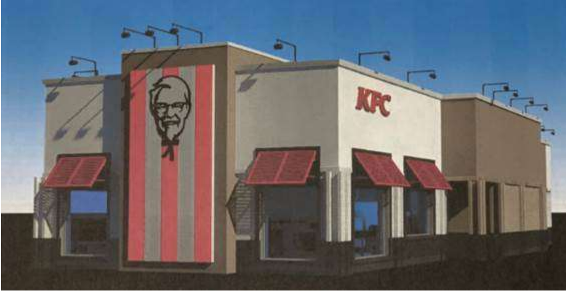
Rendering of the Kentucky Fried Chicken restaurant.