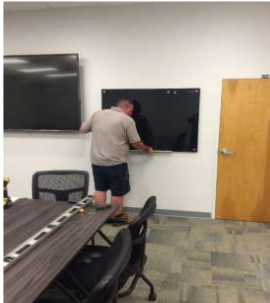
A photo of the hung dry erase board at DLH City Center Annex