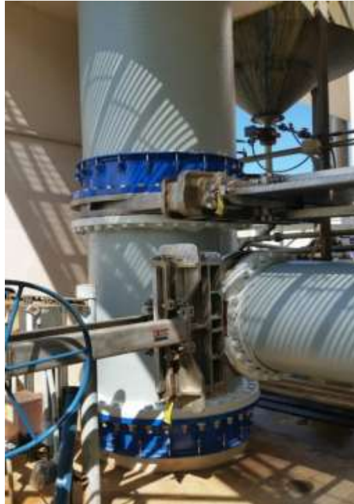
New Influent Piping Was Painted