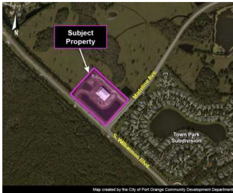
Map showing location of property at corner of Madeline Ave. and Williamson Blvd.

According to the Town Park PCD Amended and Restated MDA which governs this property, the property owner is required to have an approved site plan and building permit to bring the site and building into compliance or demolish the building prior to May 31, 2019 . If the site plan and building permit are approved before May 31, 2019, the property owner has until May 31, 2020, according to the Town Park PCD Amended and Restated MDA, to complete all required site and building improvements.