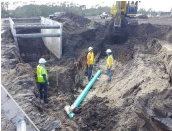
Developer Installing New Sewer Pipes at the Springs Apartment Complex