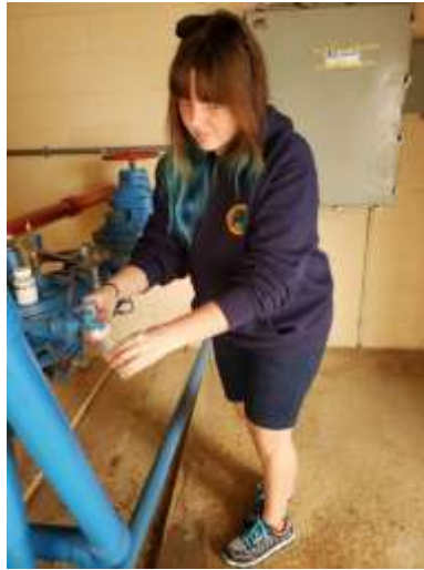
Staff Collected Samples from the City's Drinking Water Wells