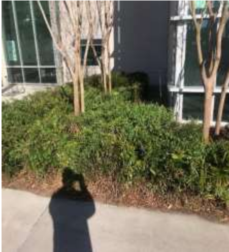
Photo of the Police Dept. Entrance Before