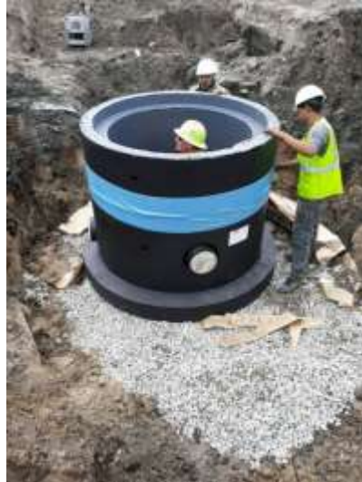
Developer Installing New Manhole Structures at the Springs Apartment Complex