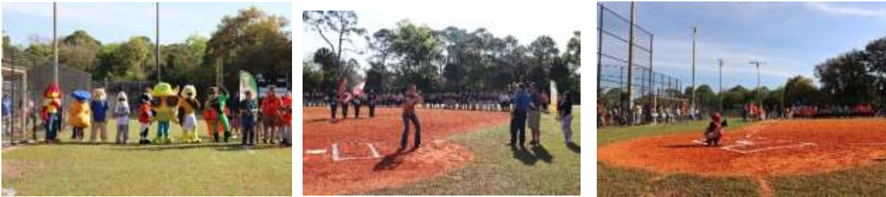
Photos taken at the opening day of baseball at City Center Complex on March 9