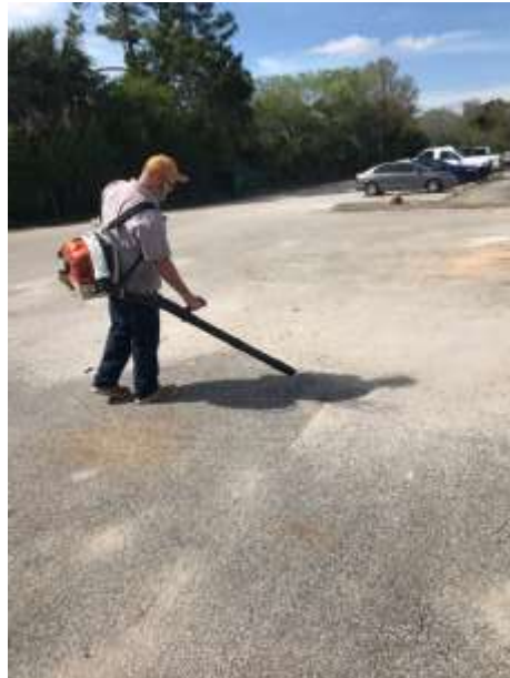
A photo of one of our staff blowing off the Public Works parking lots