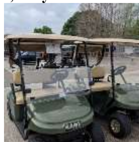
A photo of new golf carts