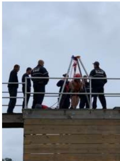
Photos of the POFR Technical Rescue/Confined Space Rescue Team (TRT)