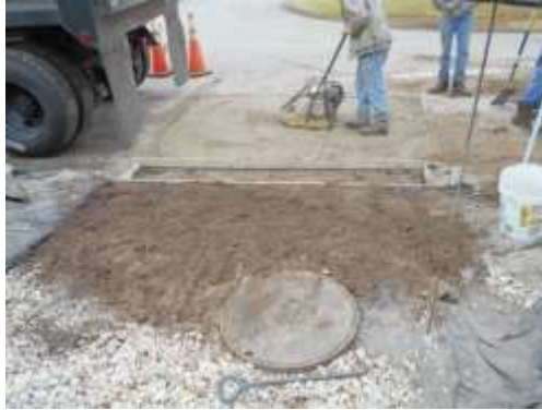
A photo of surface restoration after the manhole repairs