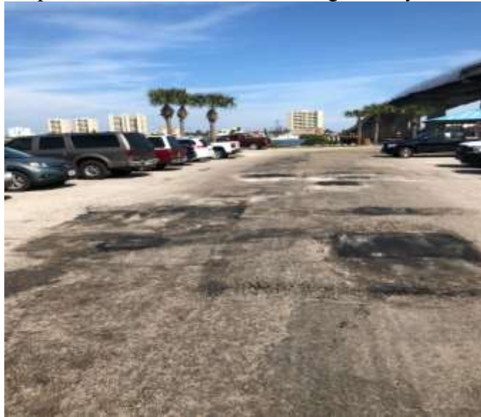
A photo of pavement repairs under Dunlawton Ave. Bridge