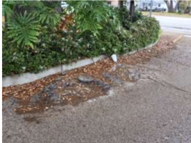
A photo of the current condition of the roadway on Raintree Drive