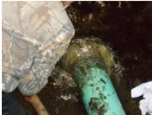
A photo of a connection to the repaired manhole