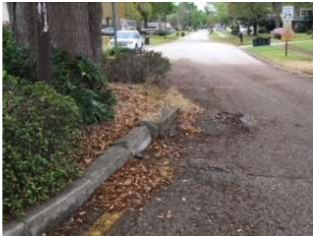
A photo of the current condition of a roadway on Raintree Drive