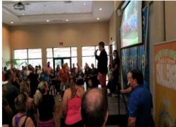
Photo of kickoff at Lakeside Center