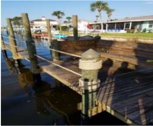
Photo of the dock before it was removed