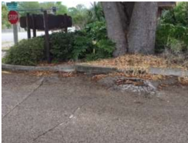
A photo of the current condition of the roadway on Raintree Drive