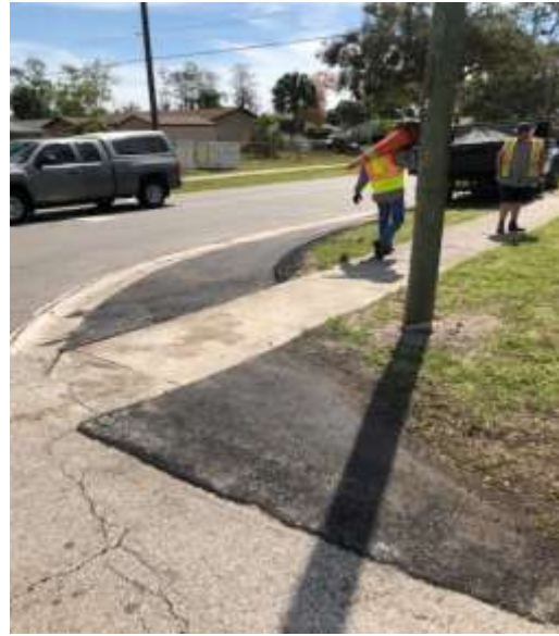
A photo of Hidden Lakes Dr. after repairs