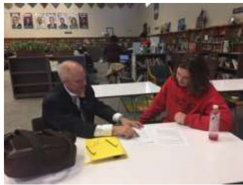
Photos during the “Student Government Day Kick Off Event 2019” with students and department head representatives from Atlantic High School