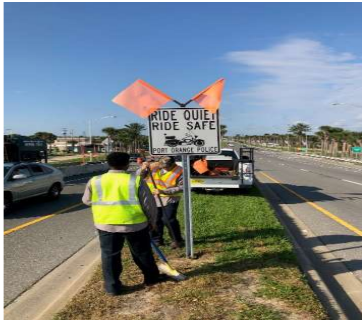
A photo of signs installed in preparation of Bike Week