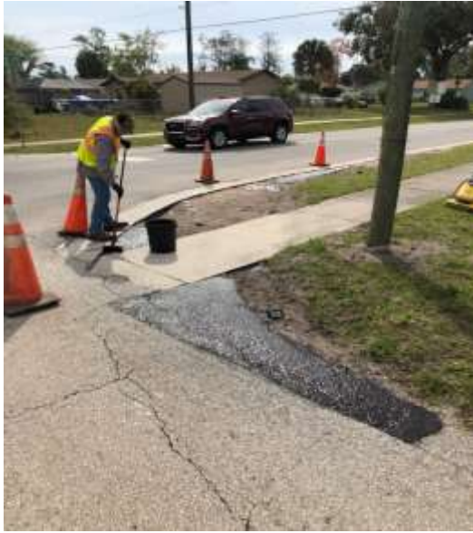
A photo of Hidden Lakes Dr. during repairs