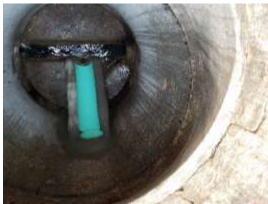
A photo of the inside of the manhole after repairs