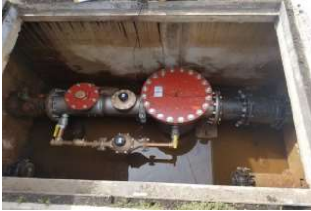
A photo of a new 10-Inch water meter installed