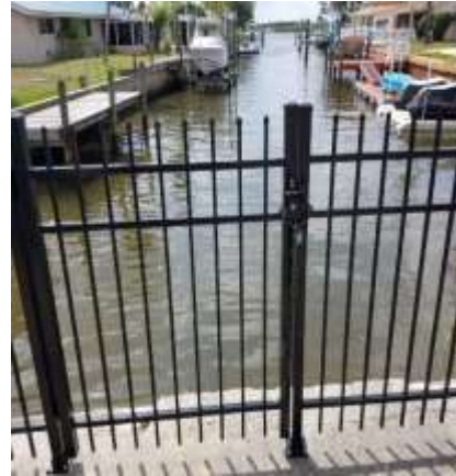
Photo of the dock after it was removed