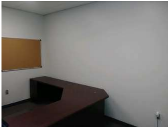
A photo of Detective's Office Painted by Staff