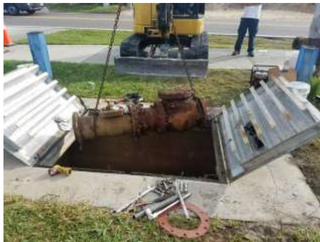
A photo of an old 10-Inch water meter removed