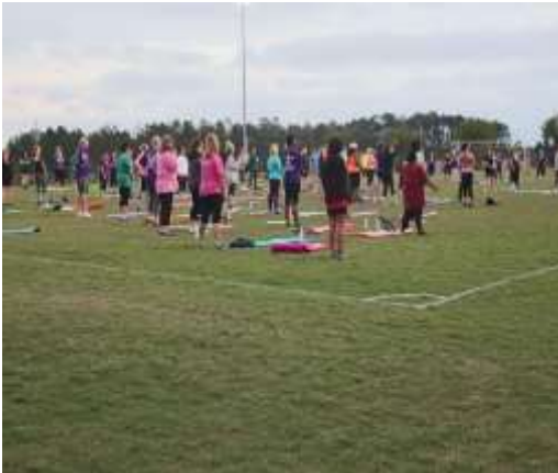
A photo of first workout of Get Fit