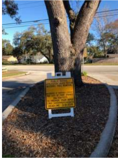
A photo of the sign posted by the tree on Raintree Drive