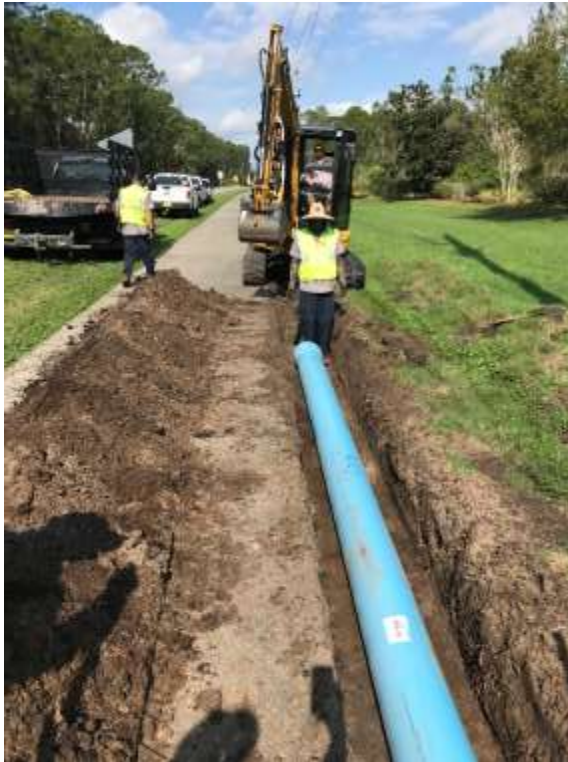
A photo of Yorktowne Blvd. where a stormwater drain pipe is installed