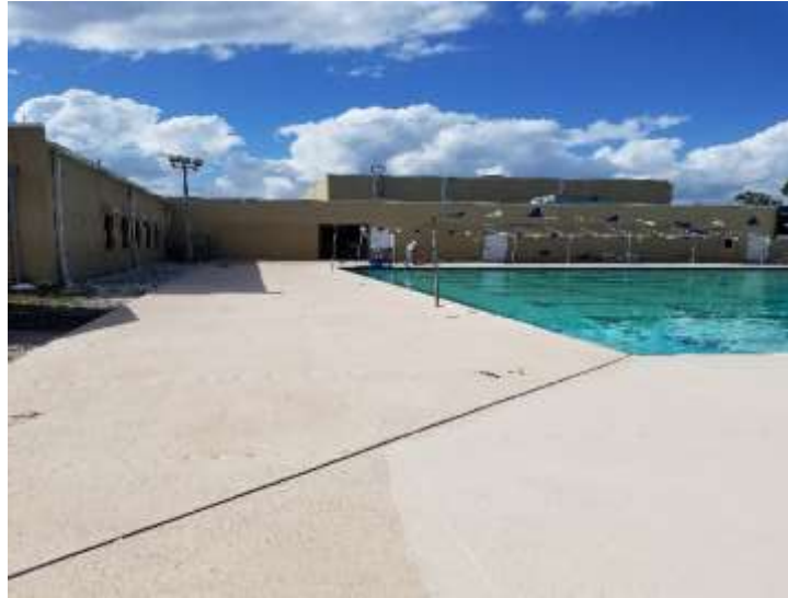
YMCA POOL & DECK