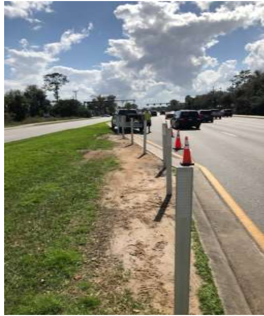
A photo showing Dunlawton median After