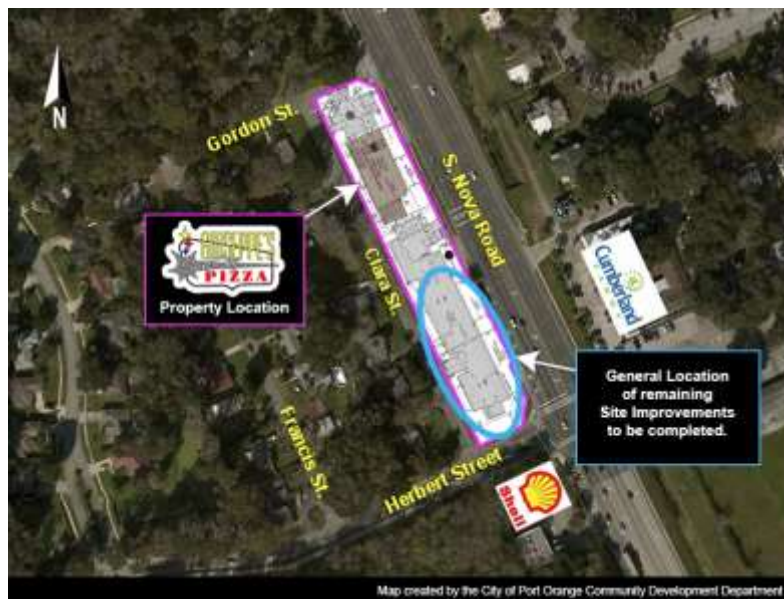
Aerial image of Giuseppe’s Steel City Pizza and location of remaining site improvement to be completed