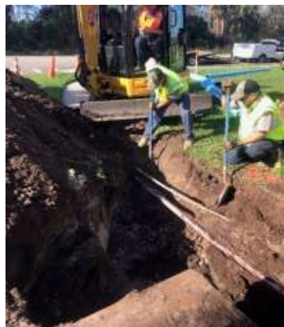
Yorktowne Side Drainage work In Process