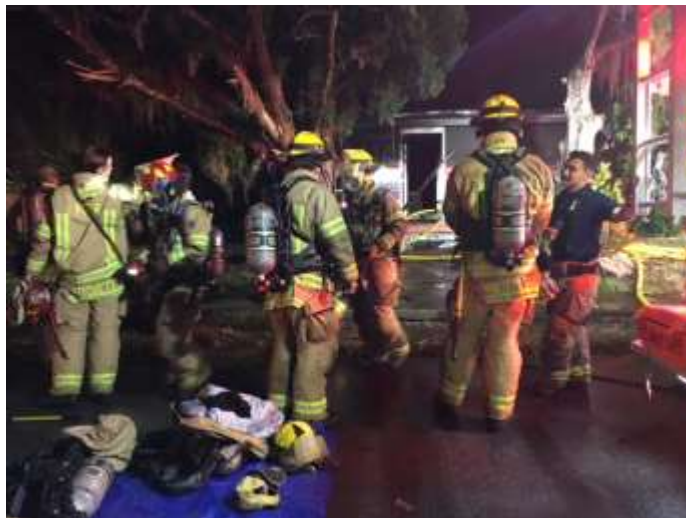
Photo shows our firefighters at the scene of a structure fire near Lafayette and Oak Street.