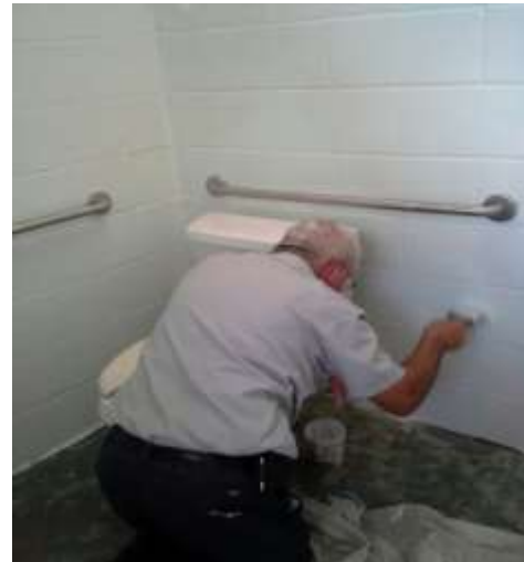
A photo shows the completion of painting