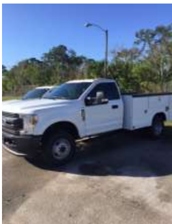
A photo of a 2019 Ford F350 4X4 Utility Truck