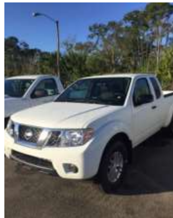
A photo of a 2019 Nissan Frontier 4X4 Pickup