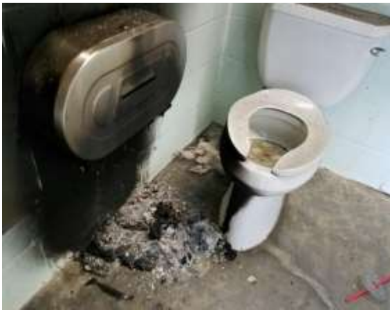
A photo showing Riverwalk restroom that caught fire