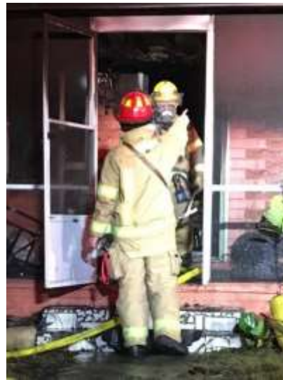
Photos show our firefighters responding to a working structure fire near Lafayette and Oak Street.