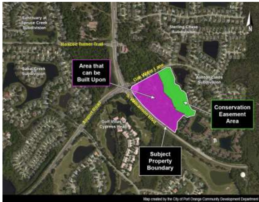
Location map of proposed Assisted Living Facility