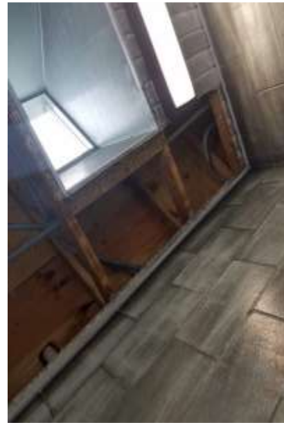
A photo showing the repairs after the fire