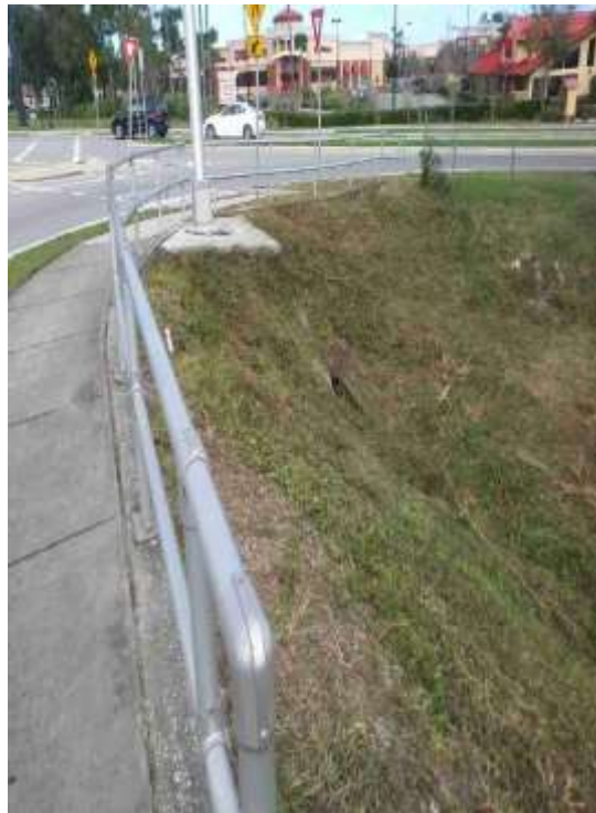
Taylor Road After