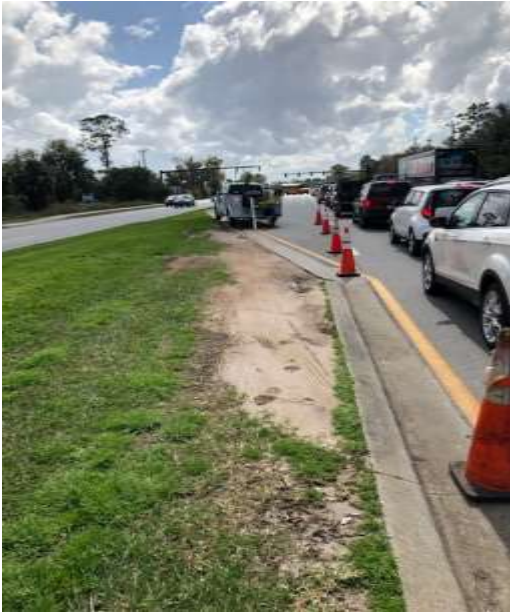
A photo showing Dunlawton median Before