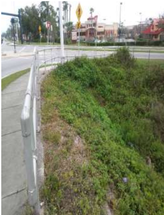
Taylor Road Before