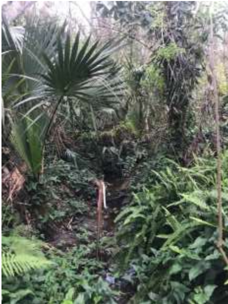
Sleepy Hollow Before