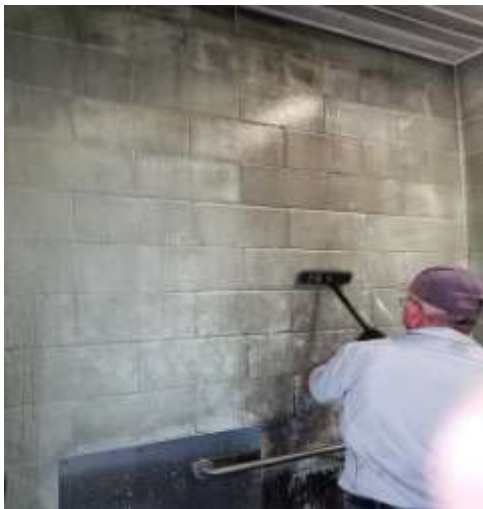
A photo shows repairs being done after the fire