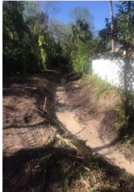
Sleepy Hollow After