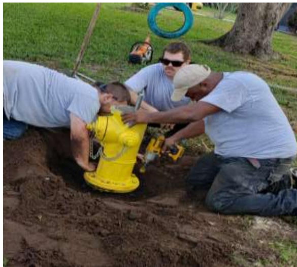
Crew Replacing Fire Hydrant on Viking Dr.