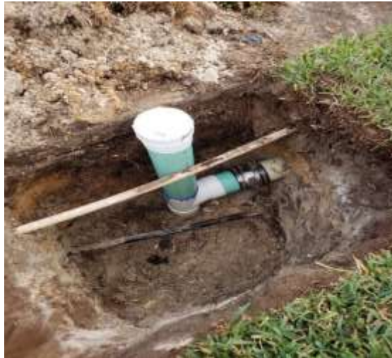
Sewer Lateral repaired at 25 Black Jack Circle