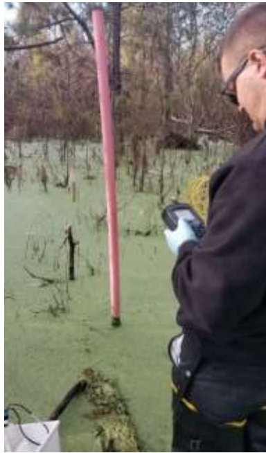
Lab Staff Monitor Wetlands on Shunz Road Regularly