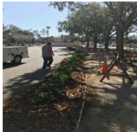
Plants installed at the Annex to the next to the Future Flexi-Pave Sidewalk