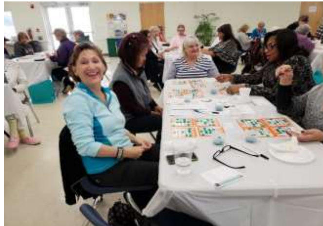
Having fun at Bingo!