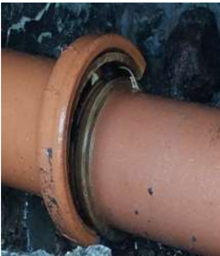
Broken Clay Pipe on Pineland Ave.