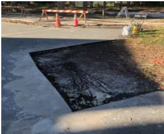
Annex Parking Lot Before