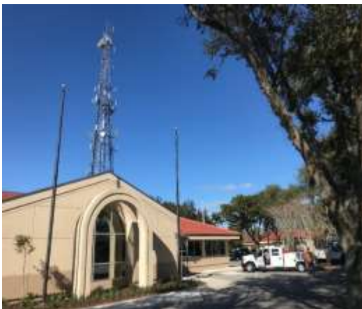
Oak Trees trimmed at the Annex Entrance