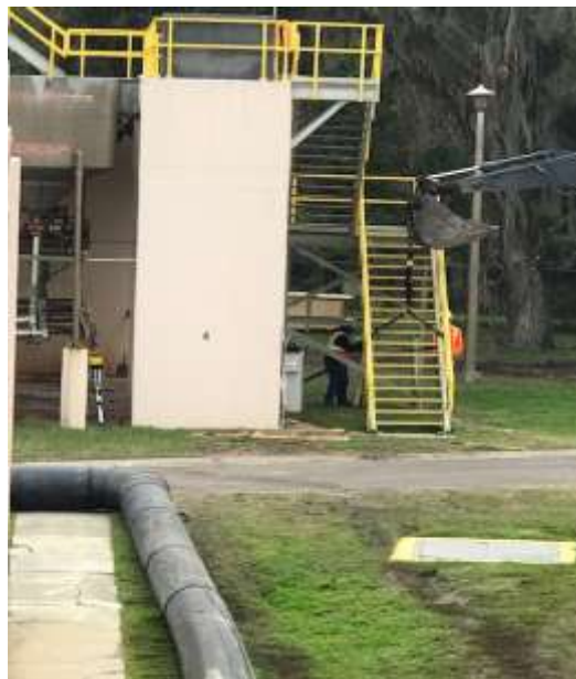
Stair Removal at the Reclamation Facility Headworks