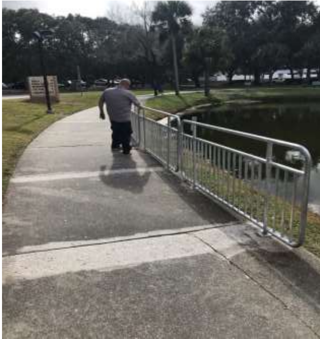
Handrails for the Sidewalk around City Hall