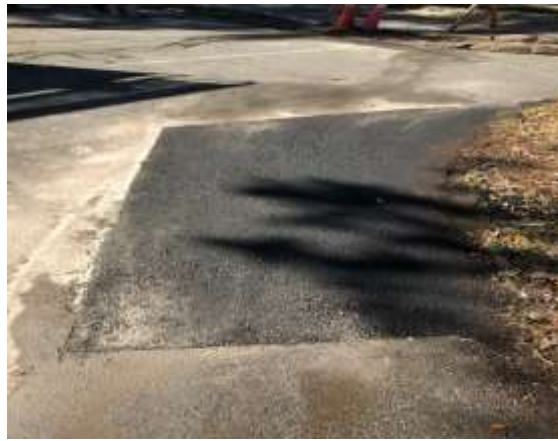
Annex Parking Lot After