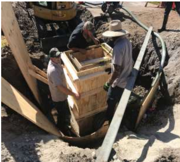
Staff Building Drainage Structure