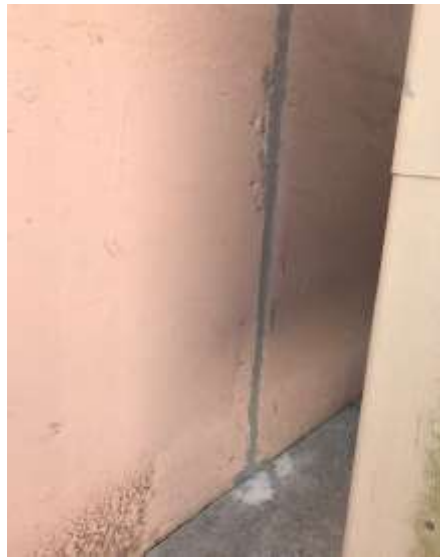
Structure Leaks After Repair