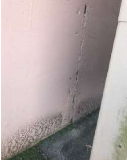
Structure Leaks Before Repairs