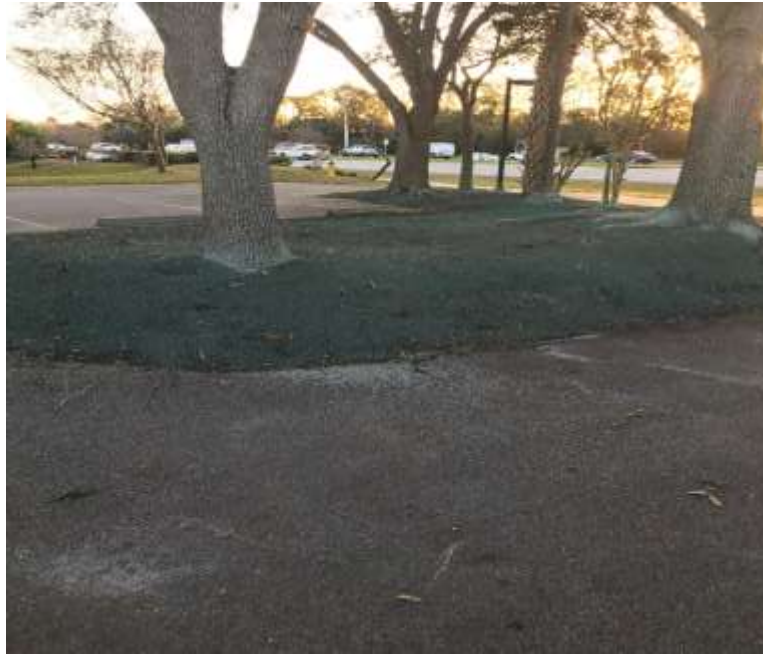
Hydro Seeding under the Oak Trees at the Annex