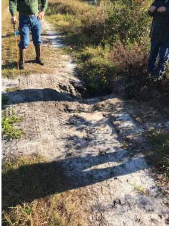
Investigation Reveals Failures in the Culvert System at Shunz Road