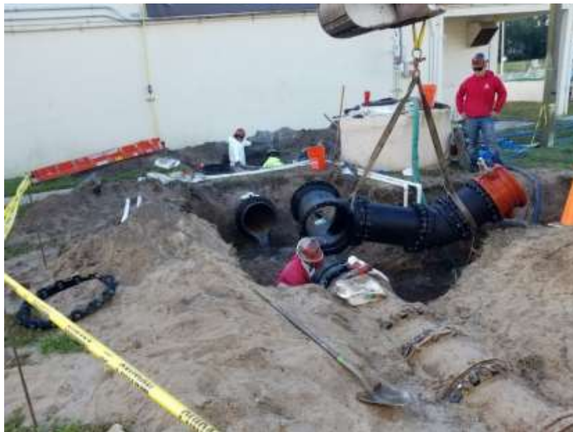
18 x 20-inch Tee, 18-inch Valve, and 20-inch Valve were Installed into the existing 20-inch pipe