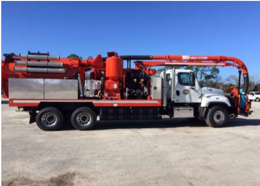
2019 Freightliner 114SD Vac-Con Vacuum Body