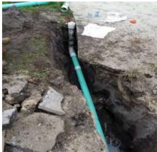
Repaired Sewer Pipe on Pineland Ave.