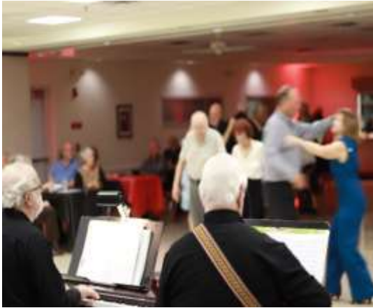
The Sound performing at the dance