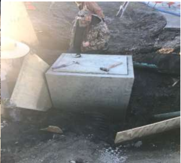
New Concrete Drainage Structure